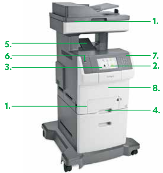
Lexmark XS748de color laser MFP shown with optional 550/2000 sheet drawers and optional caster base

Operate your printer with ease and confidence using the 7-inch (17.8-cm) color touch that makes navigation smart and intuitive.