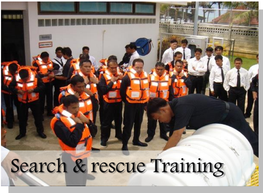
Search & rescue Training