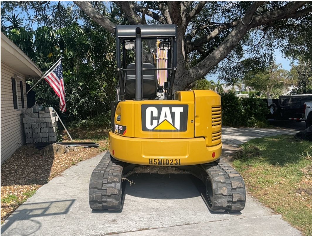
Rear / 04-05-2024