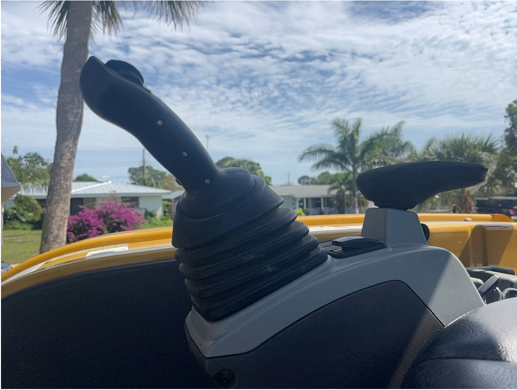
Switches and Controls / 04-04-2024