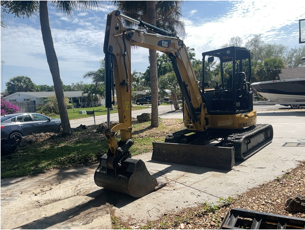
Front Left / 04-04-2024