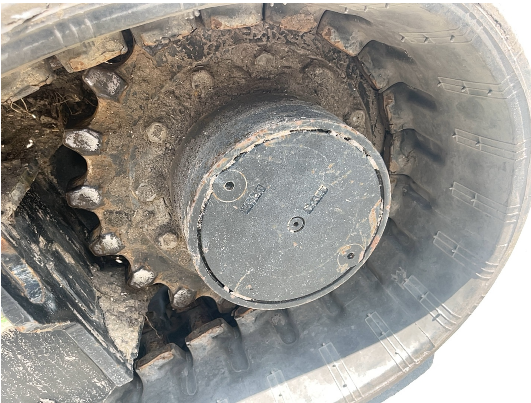
Left Track Condition / 04-04-2024