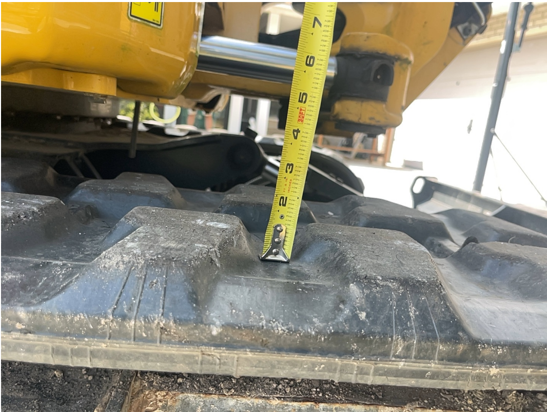
Right Track Tread Depth Measurement / 04-04-2024