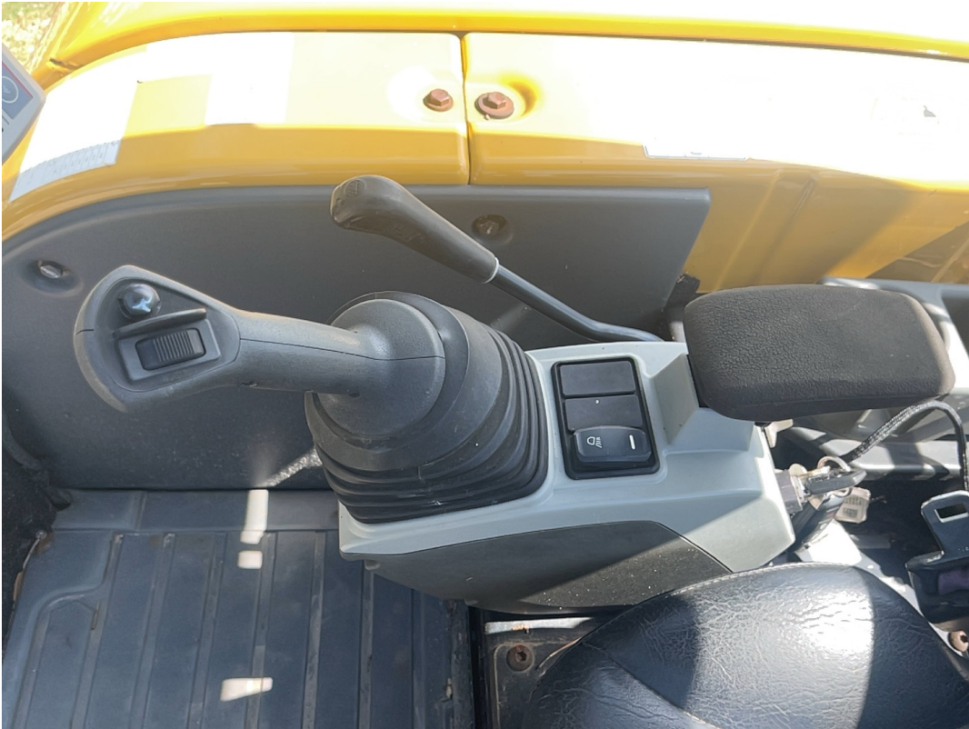
Switches and Controls / 04-04-2024