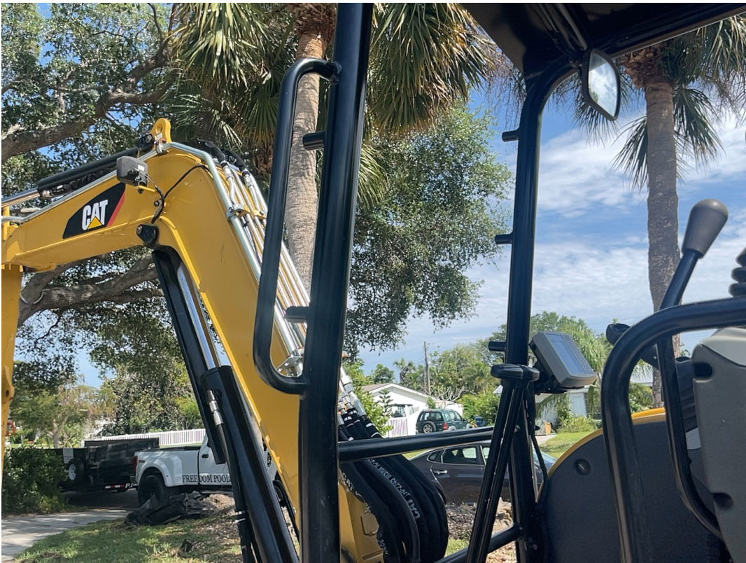
Handrails / 04-04-2024