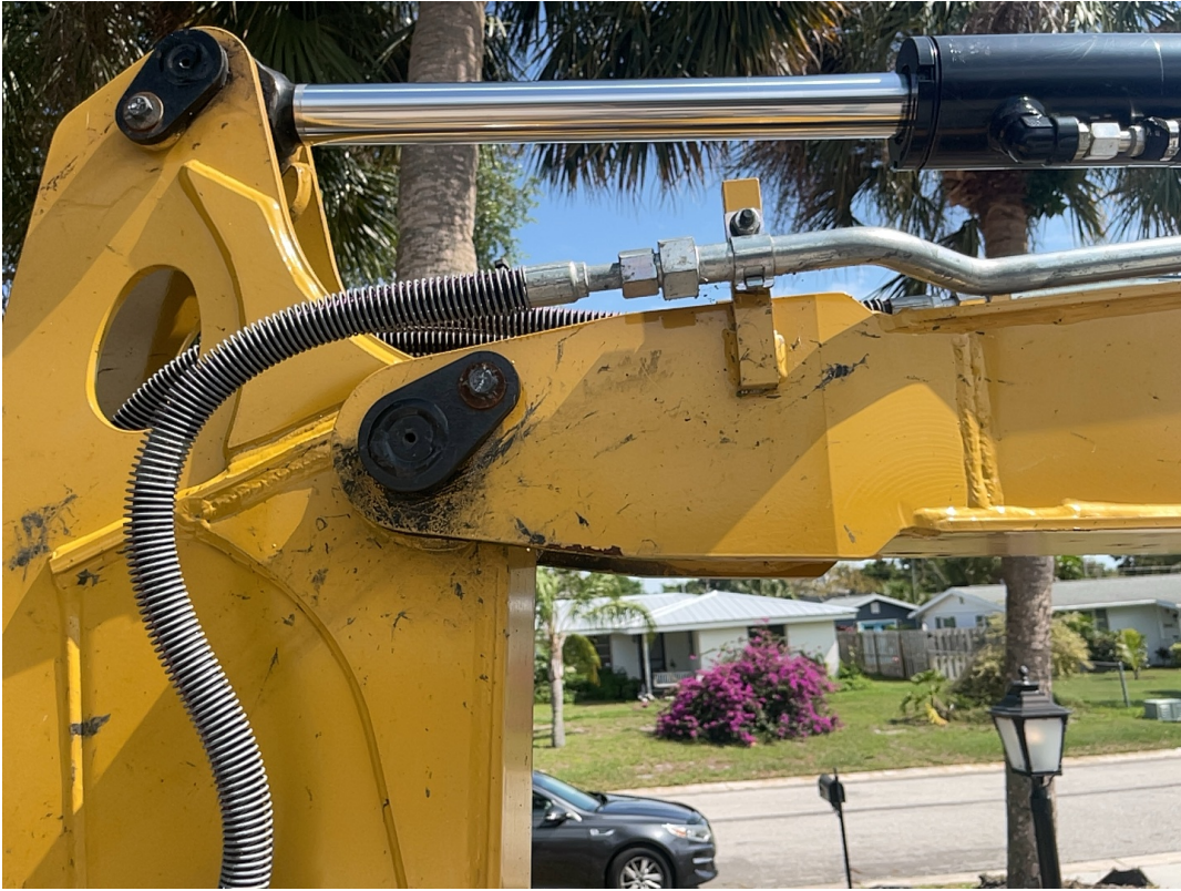
Cylinders / 04-04-2024