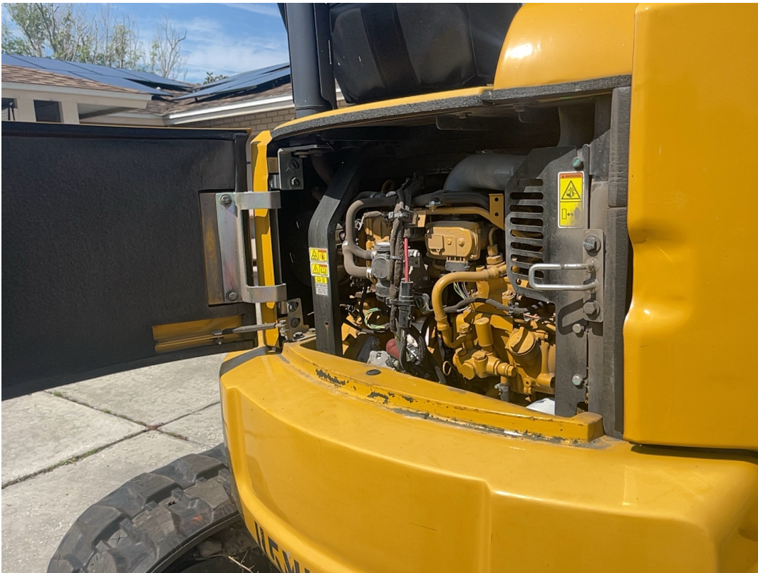
Engine Compartment / 04-04-2024