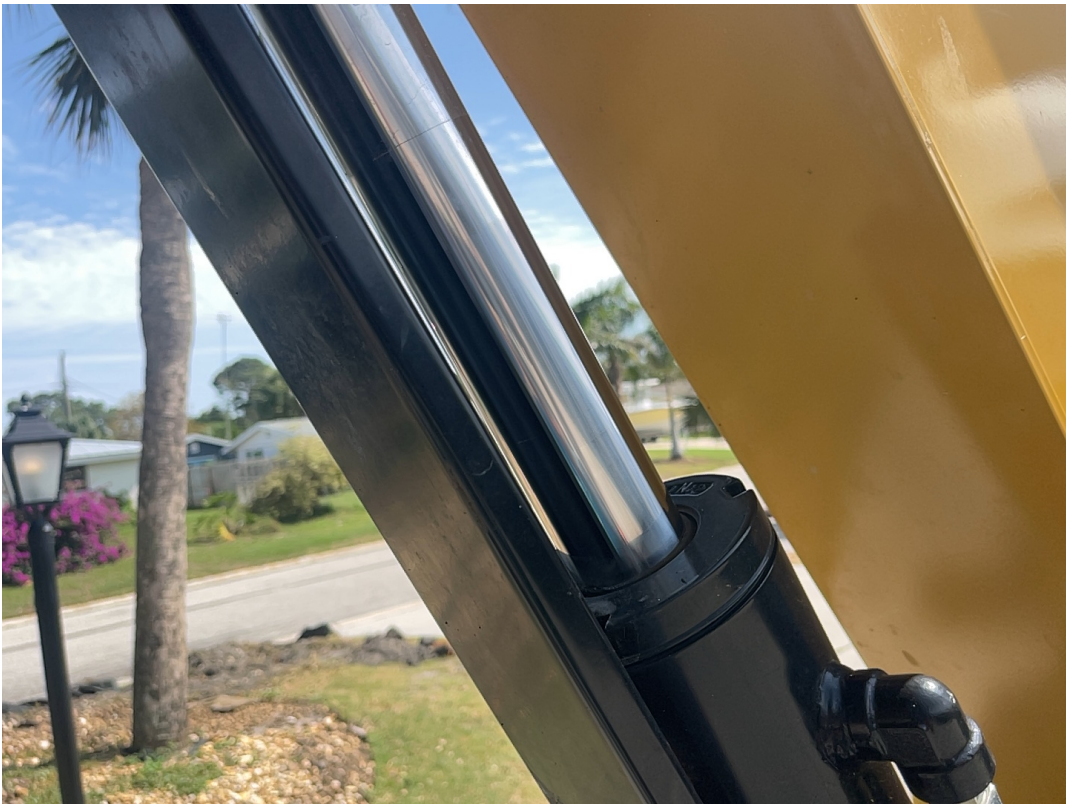
Cylinders / 04-04-2024