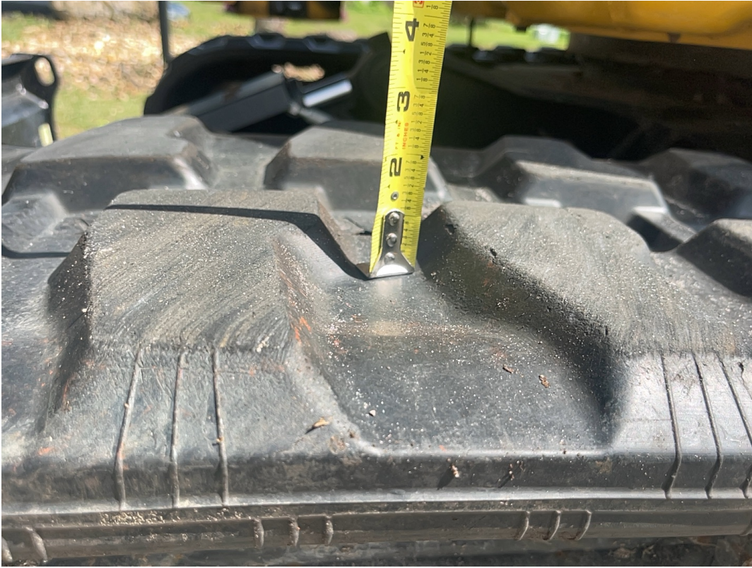
Left Track Tread Depth Measurement / 04-04-2024