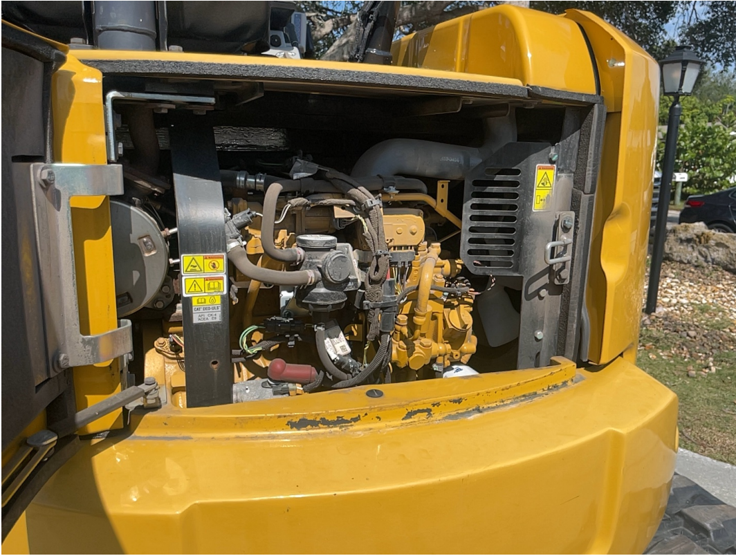
Engine Compartment / 04-04-2024