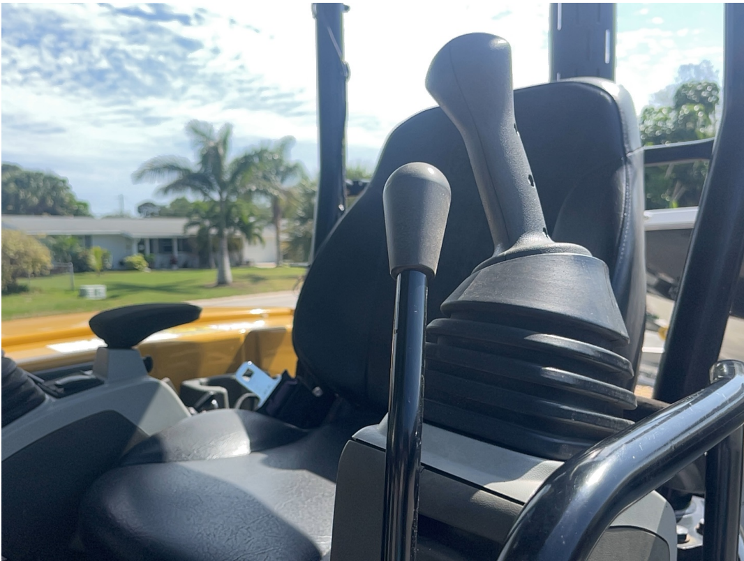
Switches and Controls / 04-04-2024