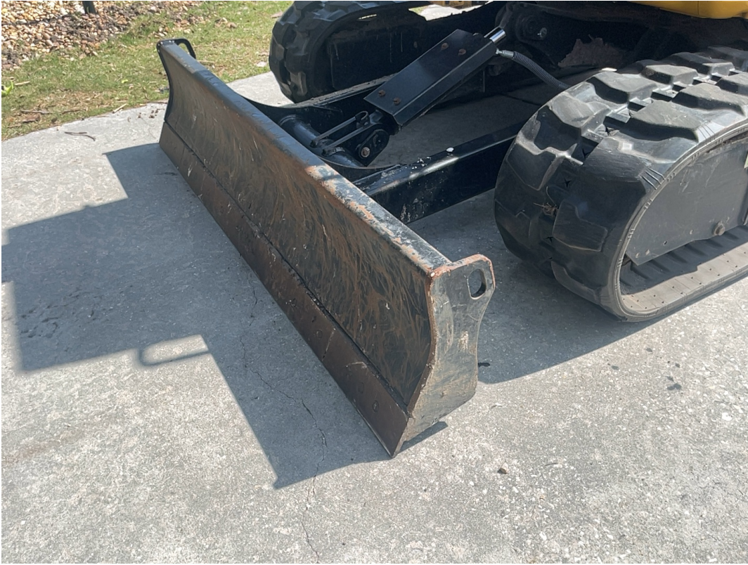
Attachments / 04-04-2024