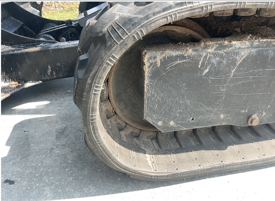
Left Track Condition / 04-04-2024