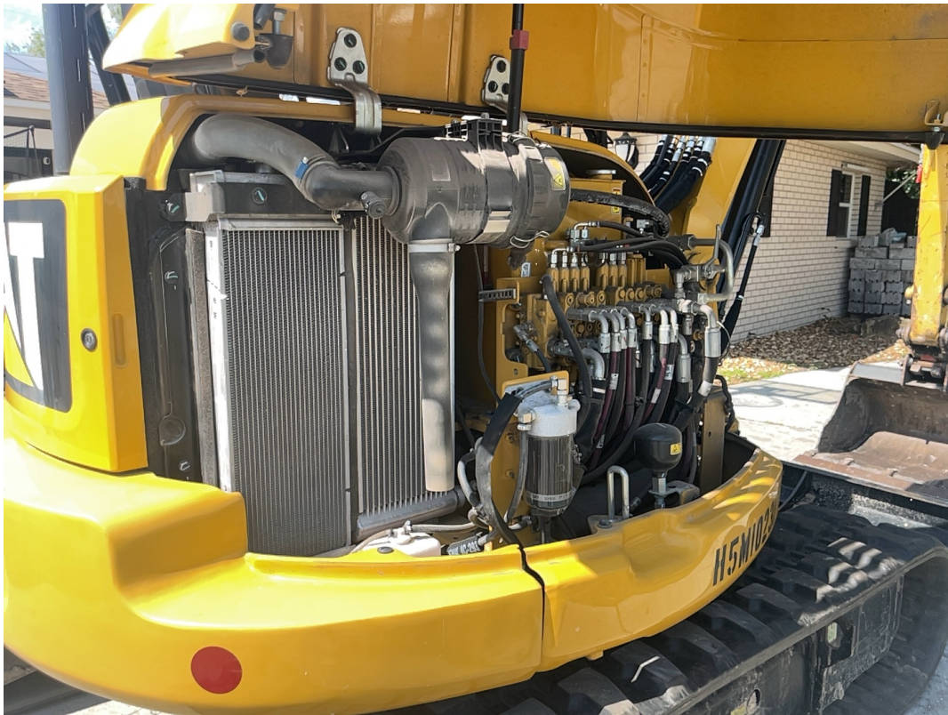
Hydraulic Compartment / 04-04-2024