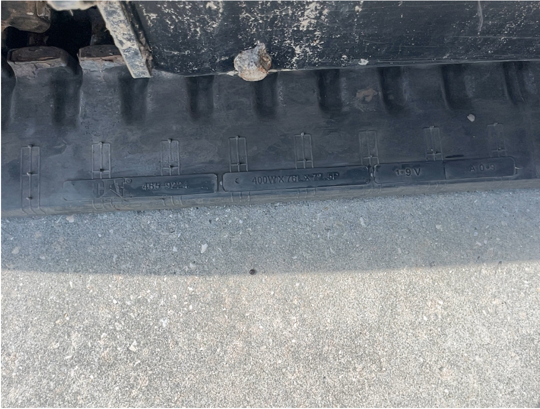
Left Track Brand / Left Track Size / 04-04-2024