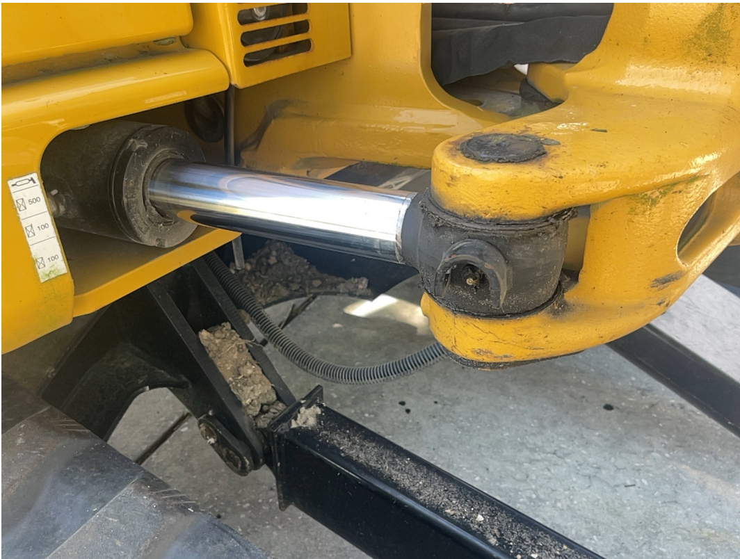
Cylinders / 04-04-2024