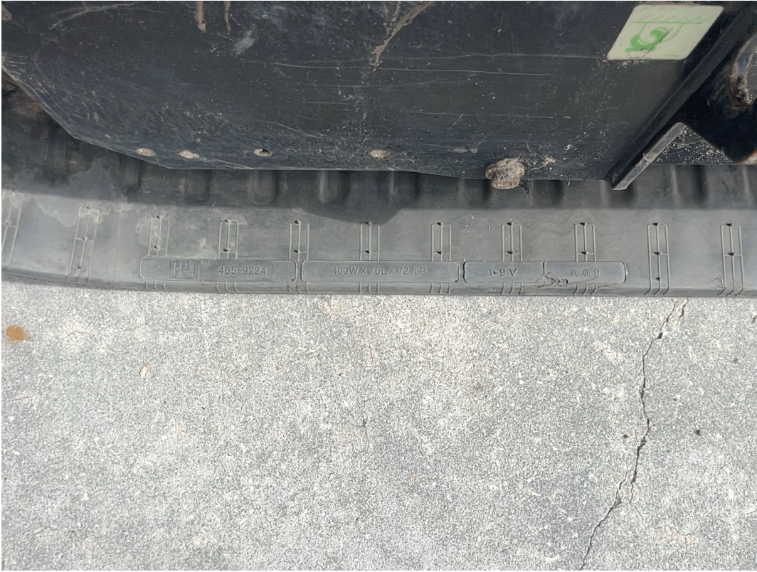
Right Track Brand / Right Track Size / 04-04-2024