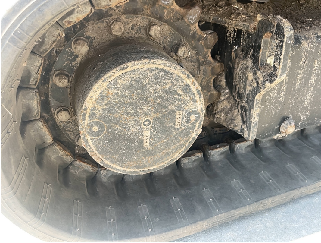
Right Track Condition / 04-04-2024