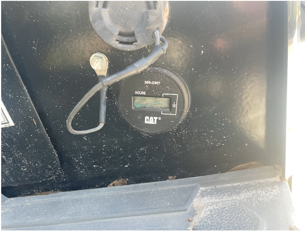
Engine Hours / 04-04-2024