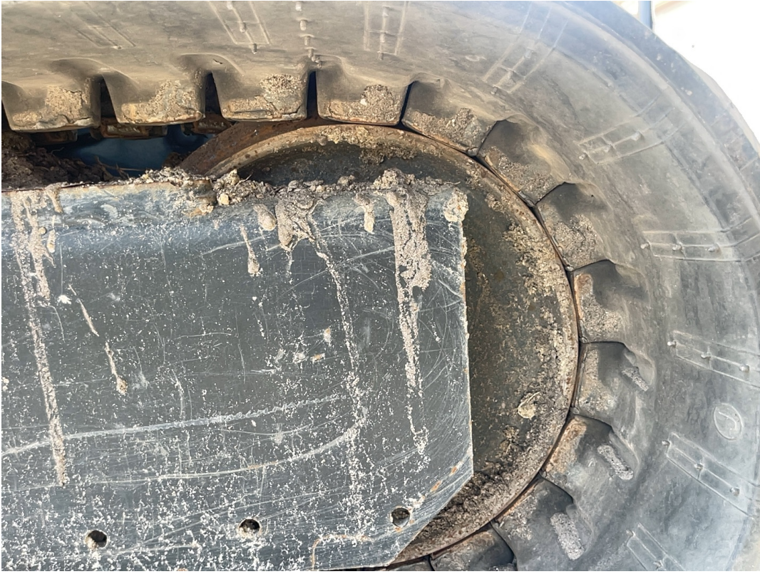
Right Track Condition / 04-04-2024