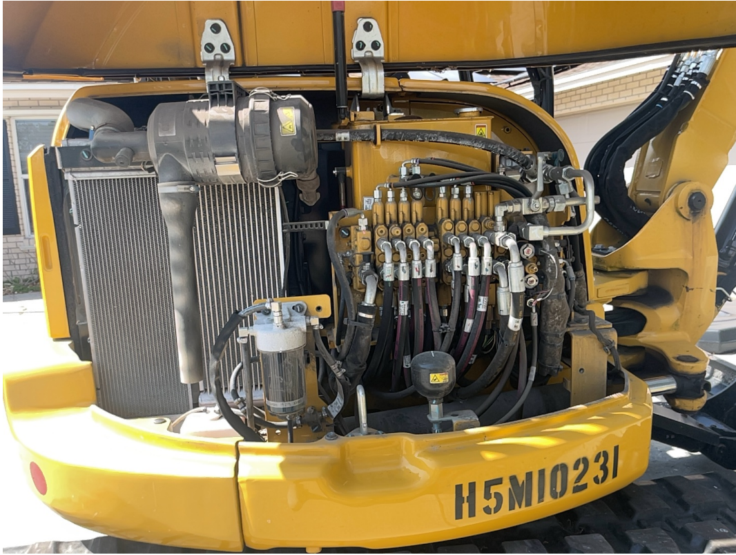
Hydraulic Compartment / 04-04-2024