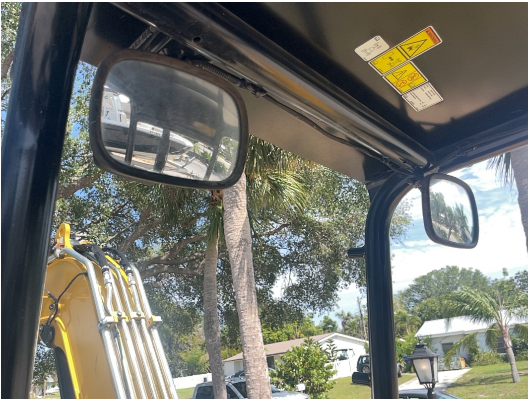
Mirrors / 04-04-2024