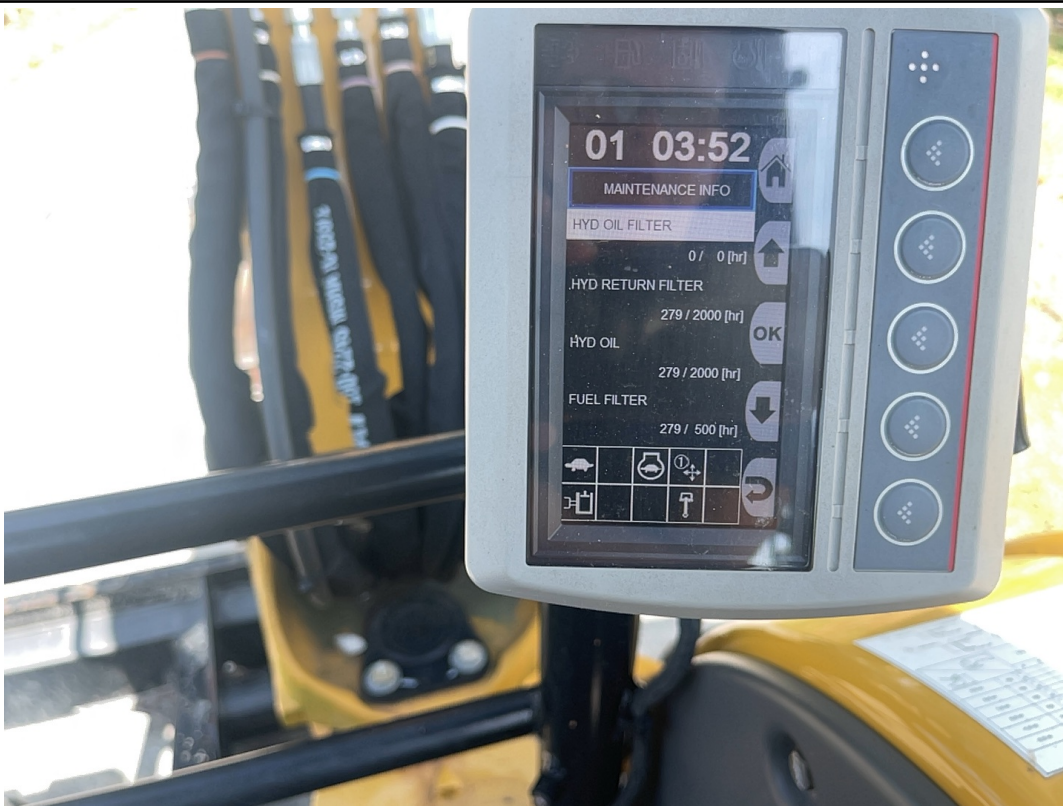
Engine Hours / 04-04-2024