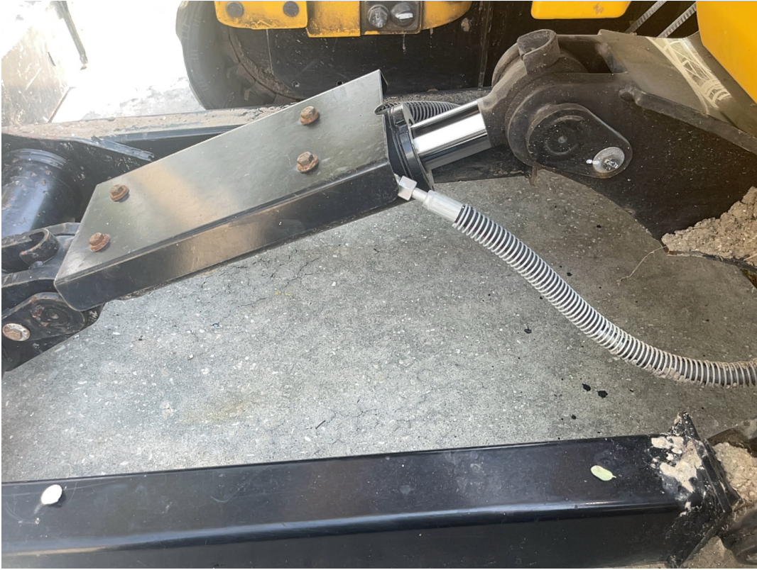
Cylinders / 04-04-2024