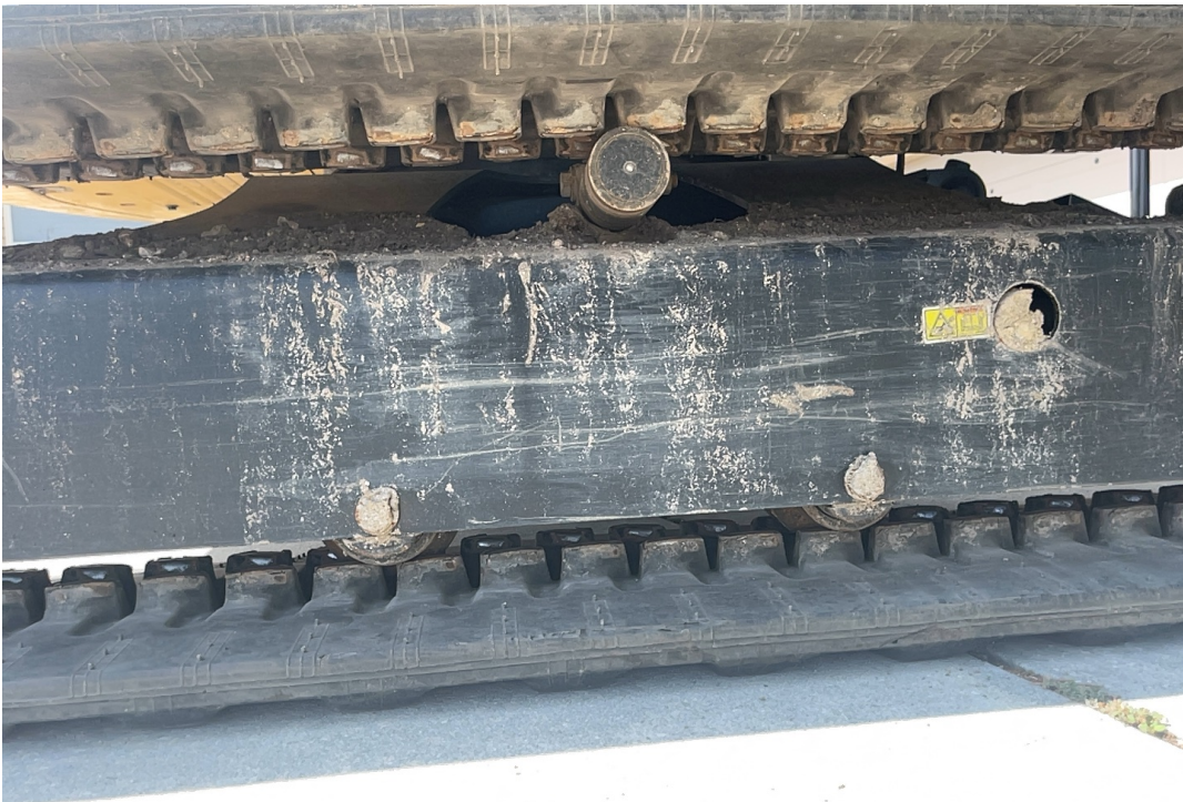
Right Track Condition / 04-04-2024