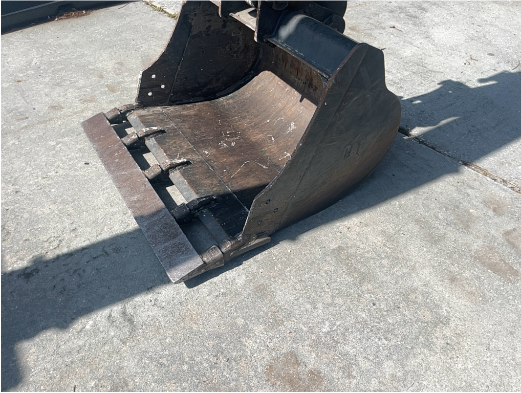
Attachments / 04-04-2024