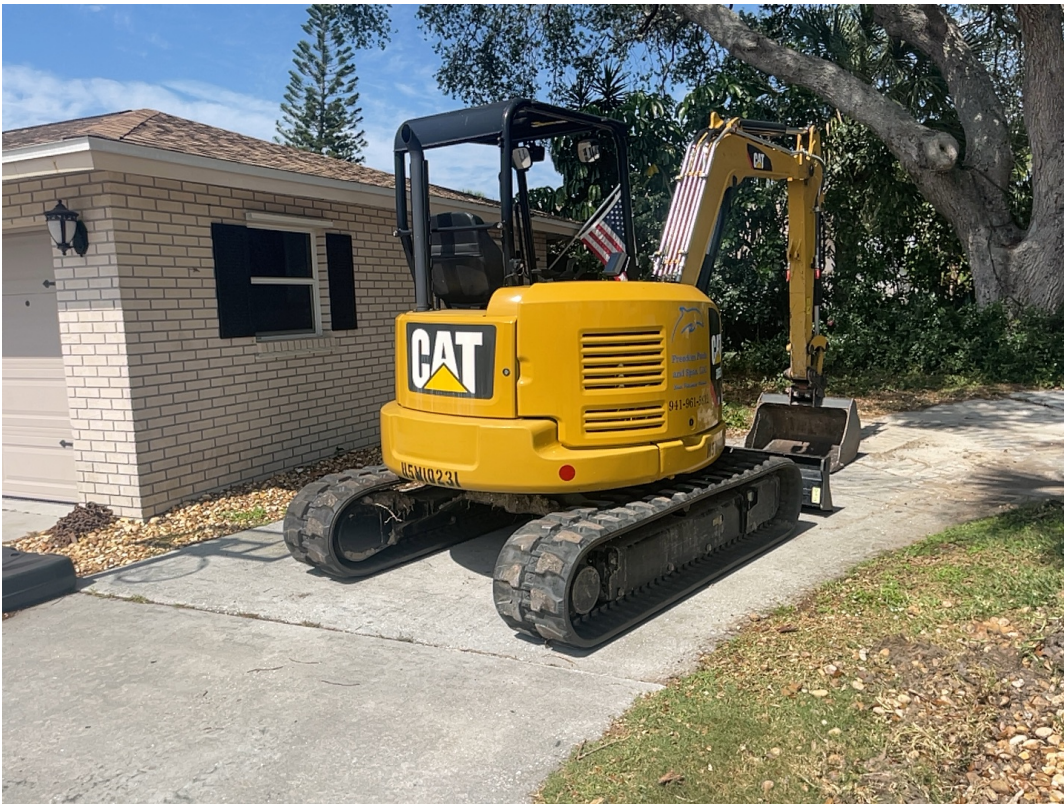
Rear Right / 04-04-2024