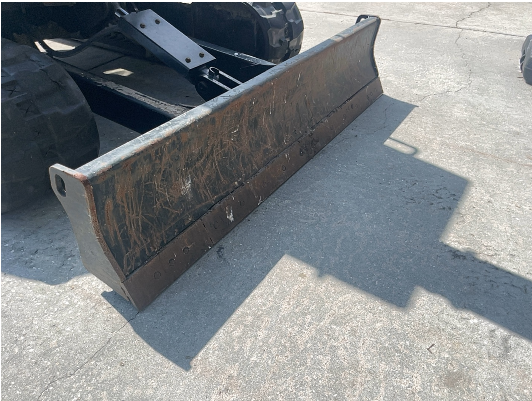
Attachments / 04-04-2024