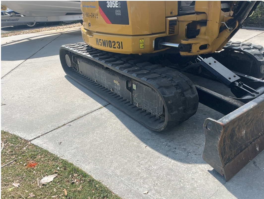
Right Track Condition / 04-04-2024