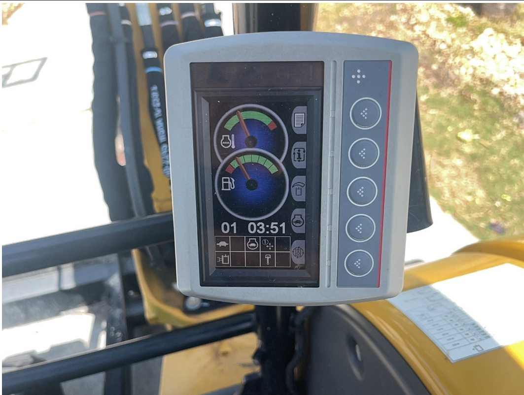
EMS Warning Lights / 04-04-2024