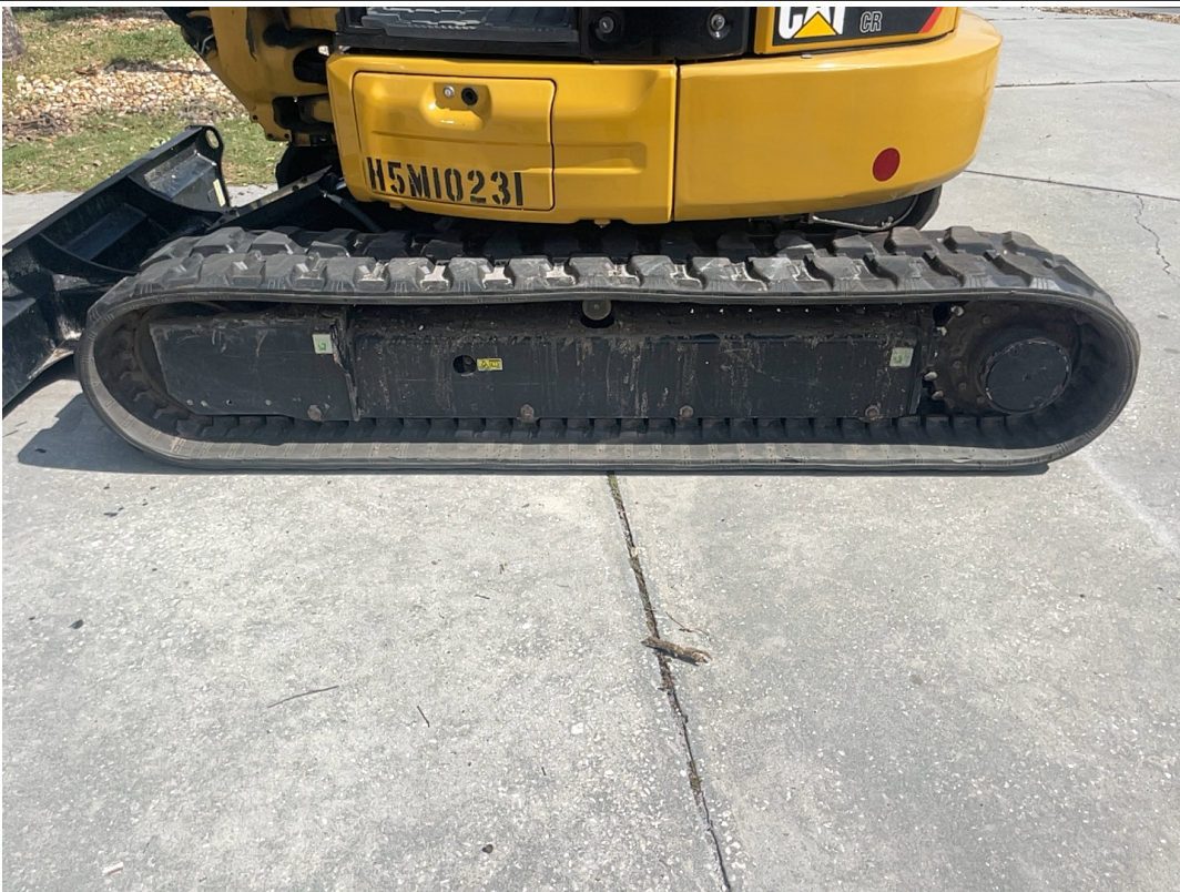
Left Track Condition / 04-04-2024