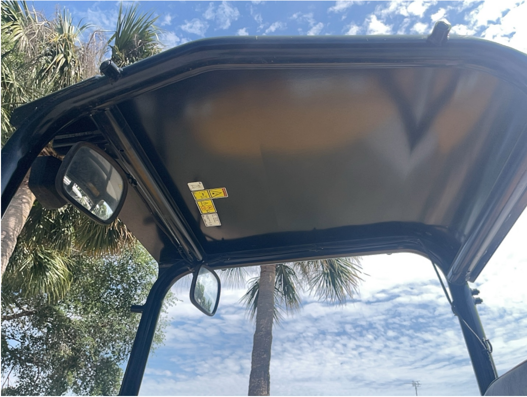
ROPS / 04-04-2024