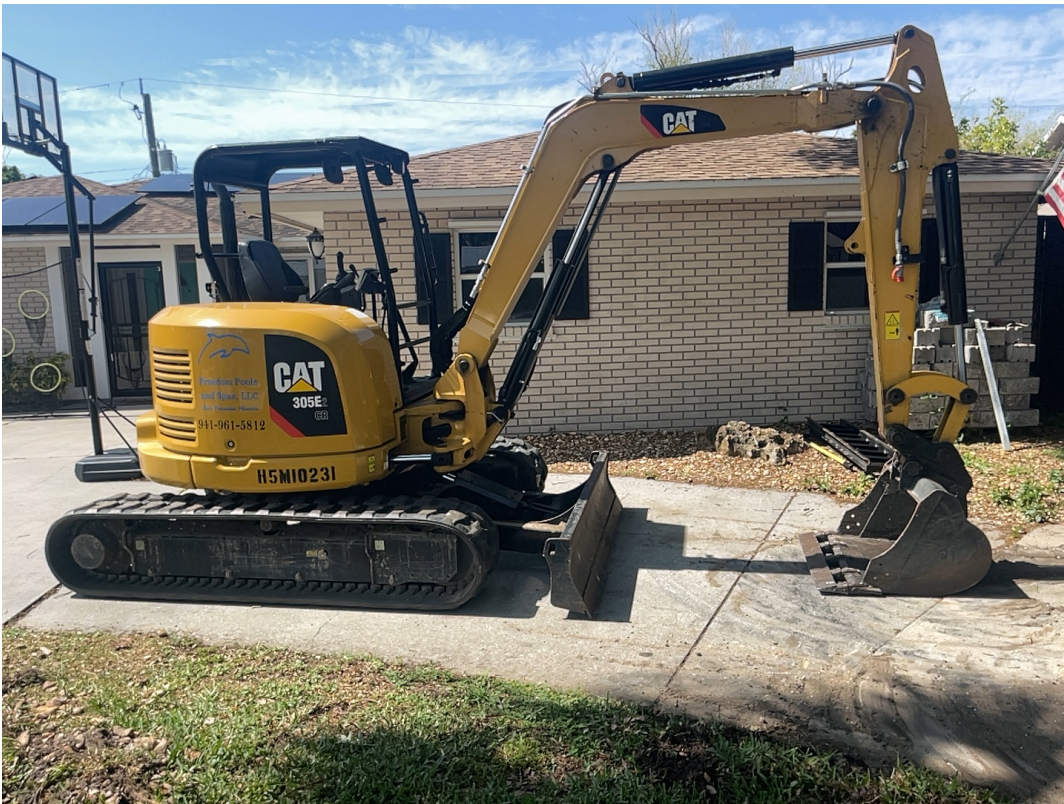
Right / 04-04-2024