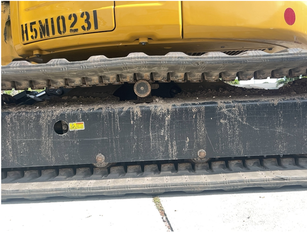
Left Track Condition / 04-04-2024