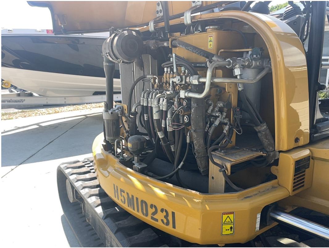
Hydraulic Compartment / 04-04-2024