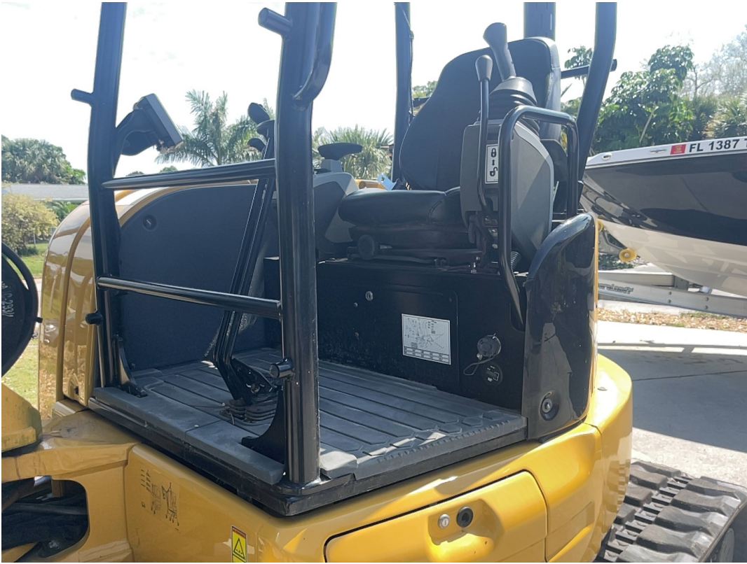
Cab Interior / 04-04-2024