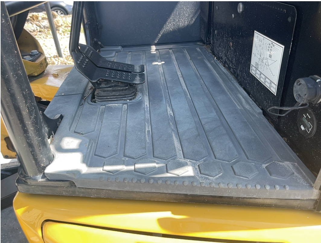
Floorboard / Pedals / 04-04-2024