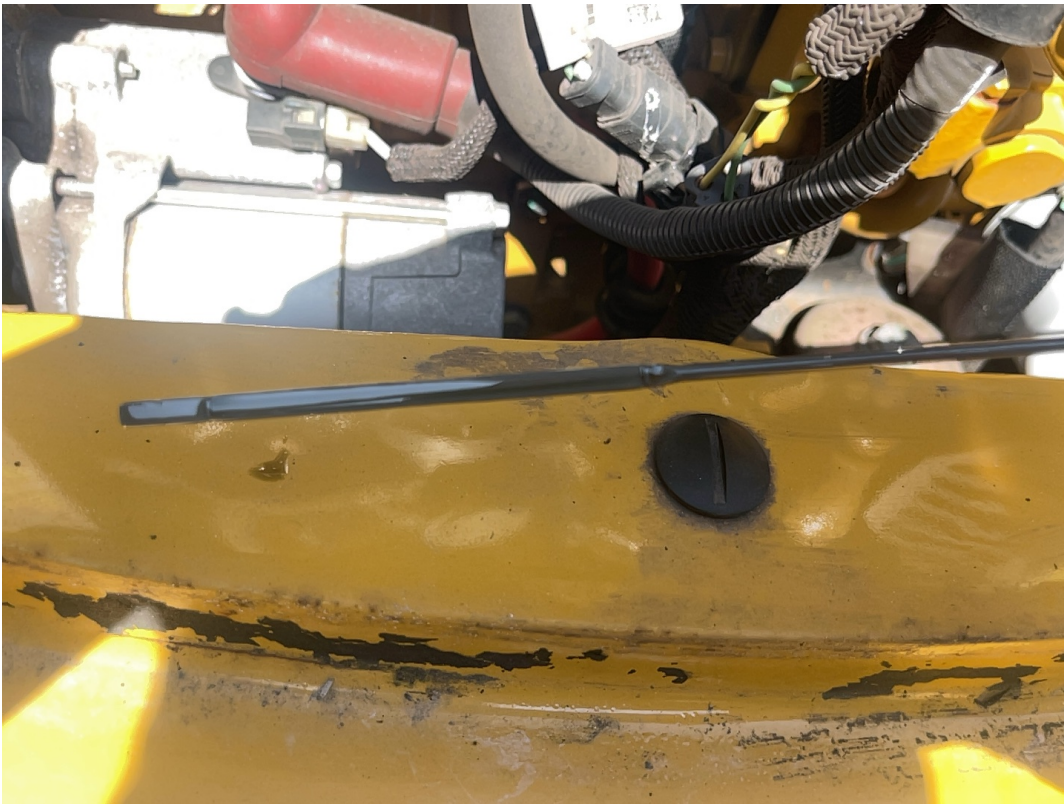
Oil Dipstick / 04-04-2024