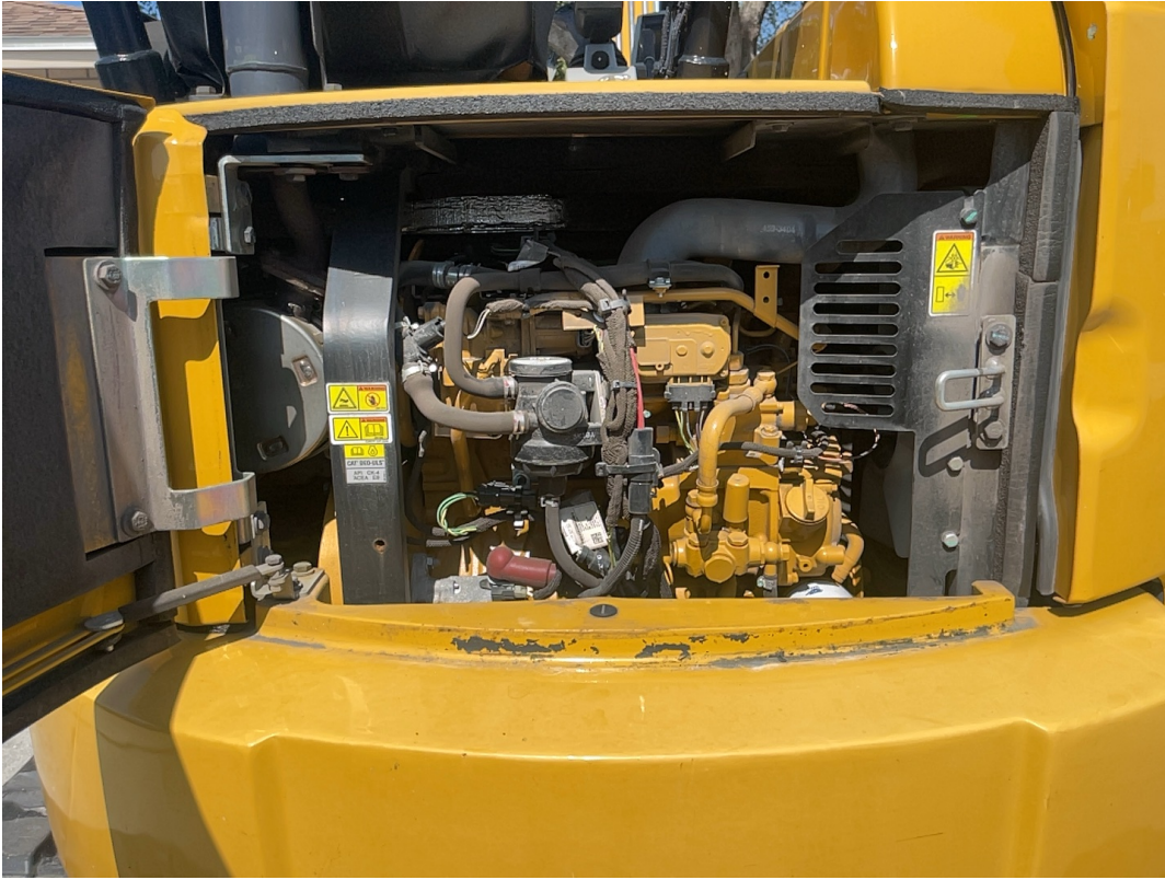
Engine Compartment / 04-04-2024