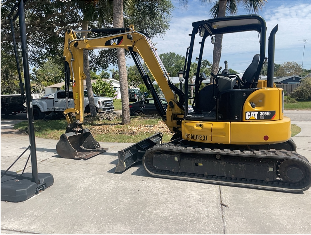
Left / 04-04-2024