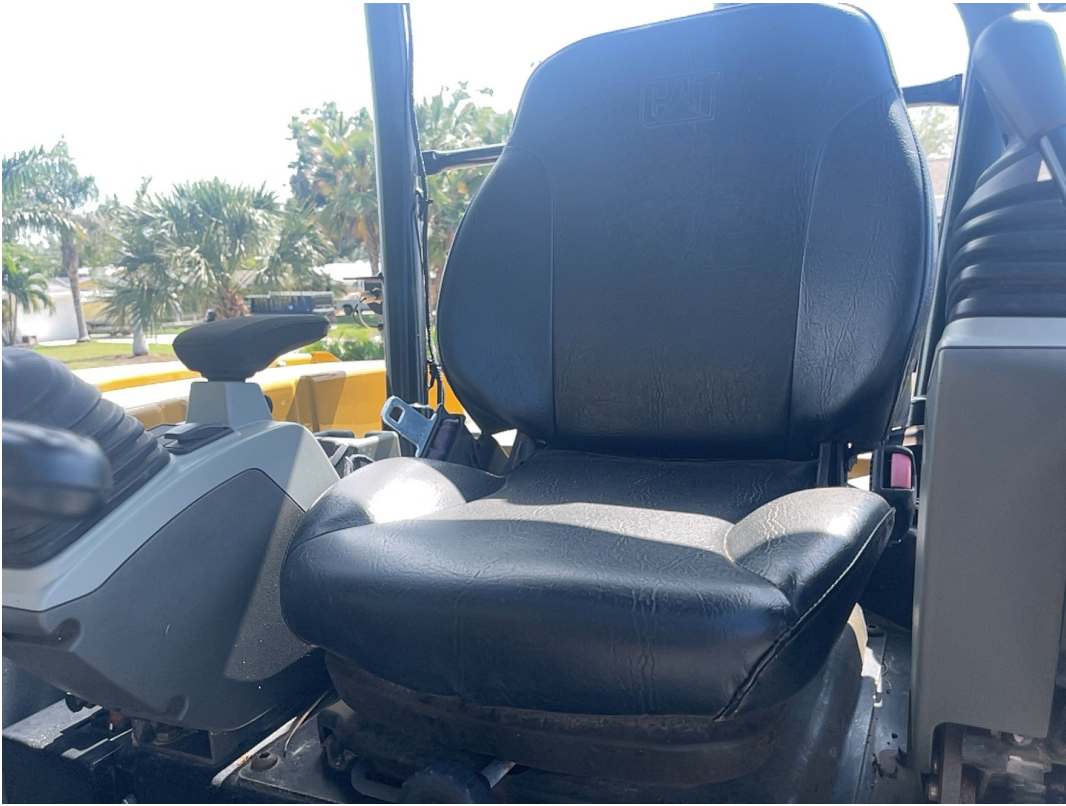
Operator's Seat / 04-04-2024