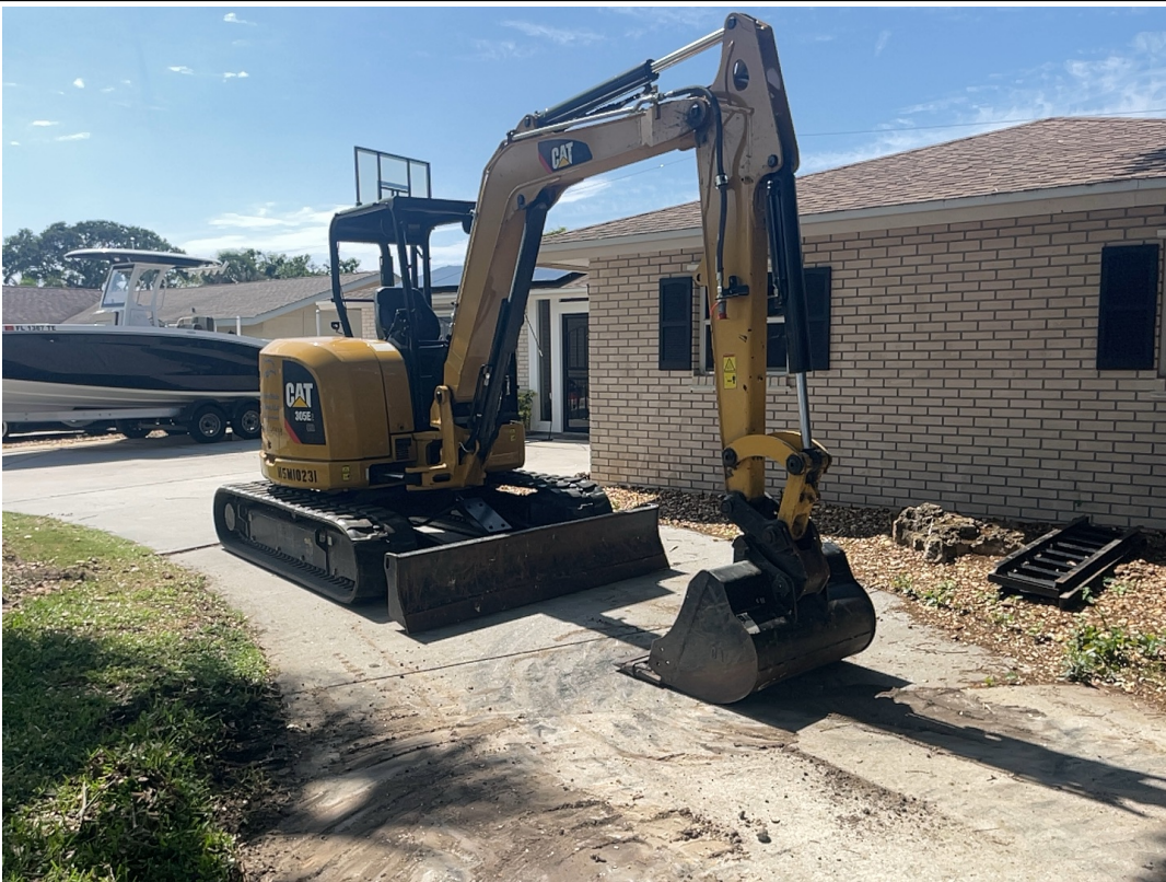
Front Right / 04-04-2024