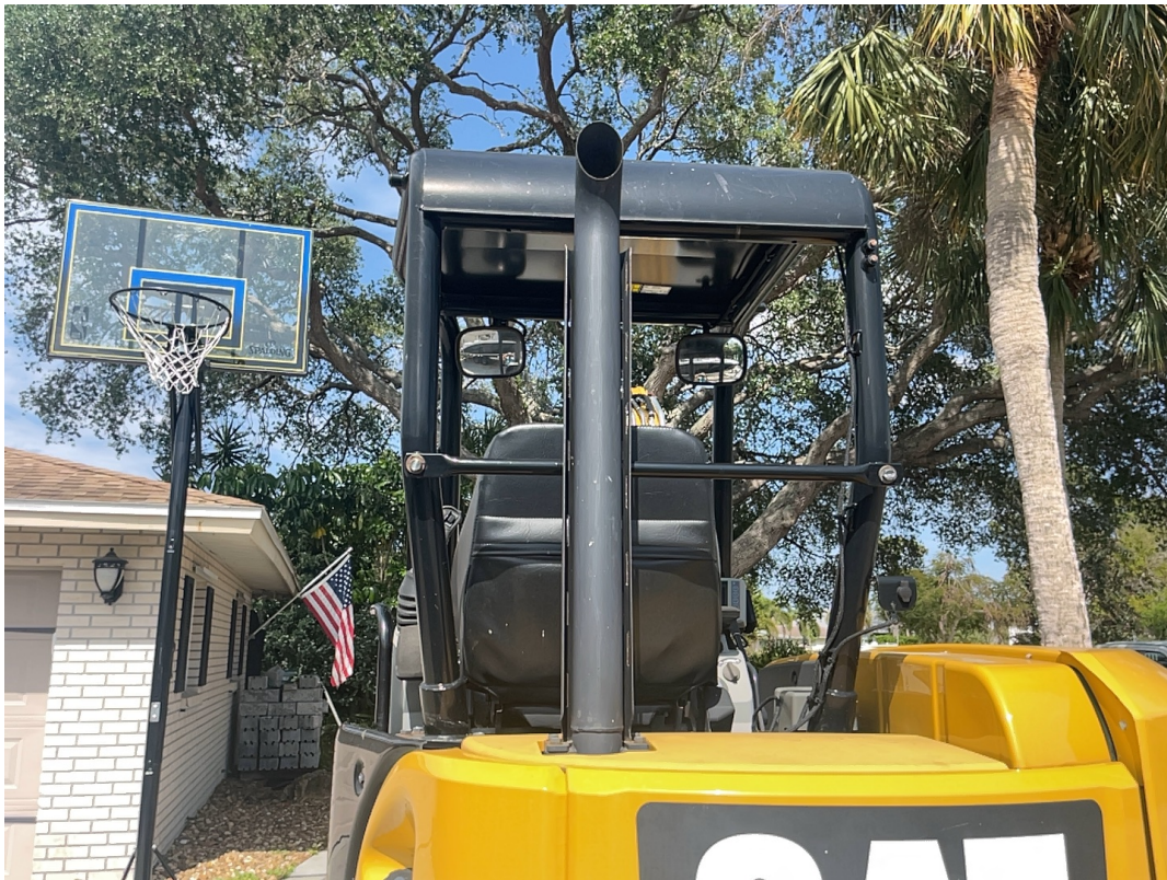
Exhaust Pipe / 04-04-2024