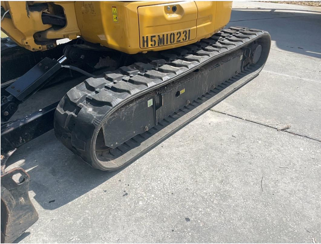
Left Track Condition / 04-04-2024