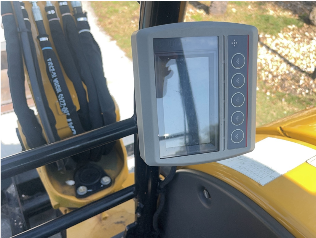
Switches and Controls / 04-04-2024