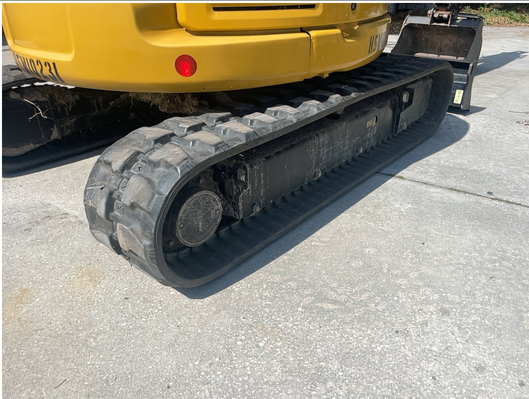
Right Track Condition / 04-04-2024