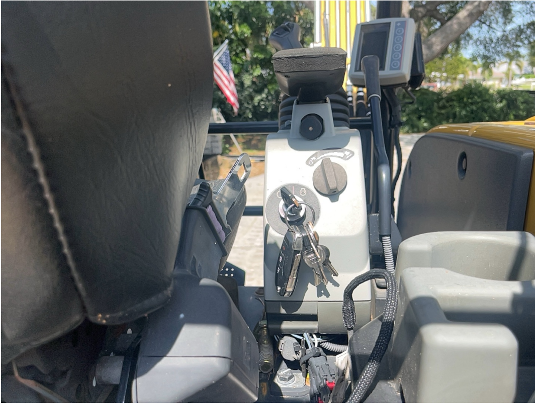
Switches and Controls / 04-04-2024