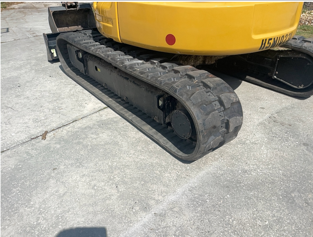
Left Track Condition / 04-04-2024