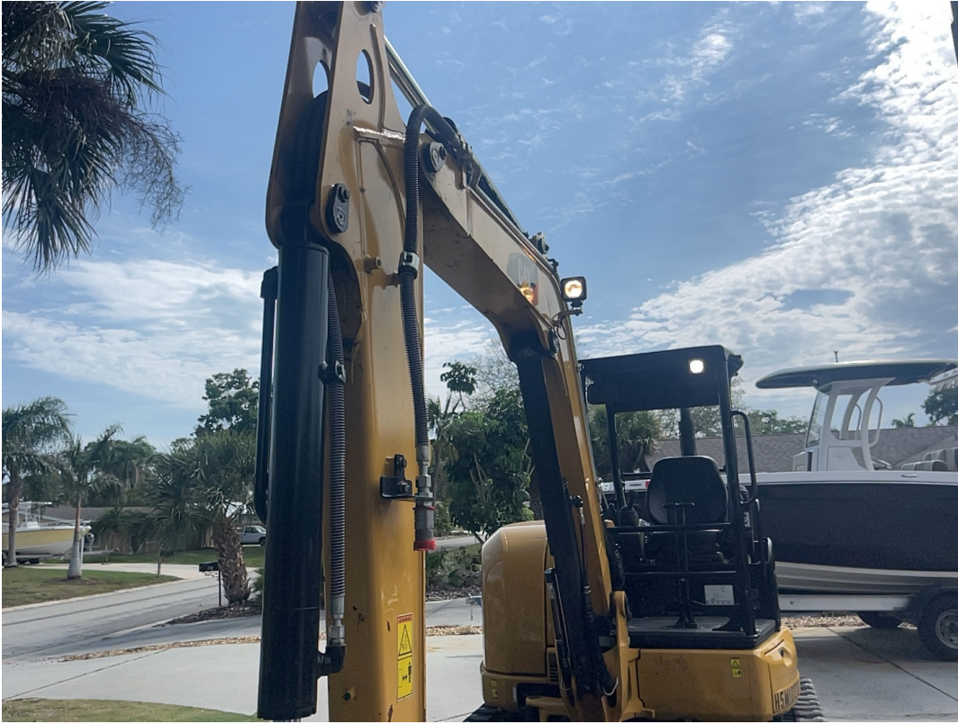
Front Lights / 04-04-2024