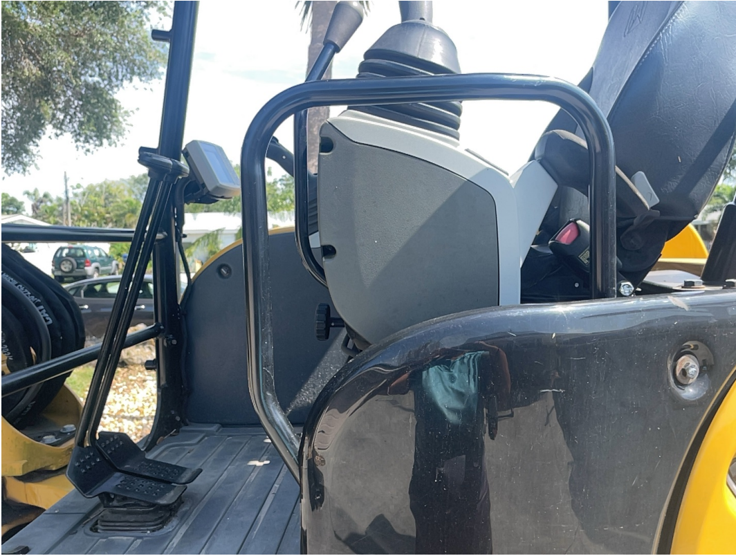
Handrails / Travel Controls / 04-04-2024