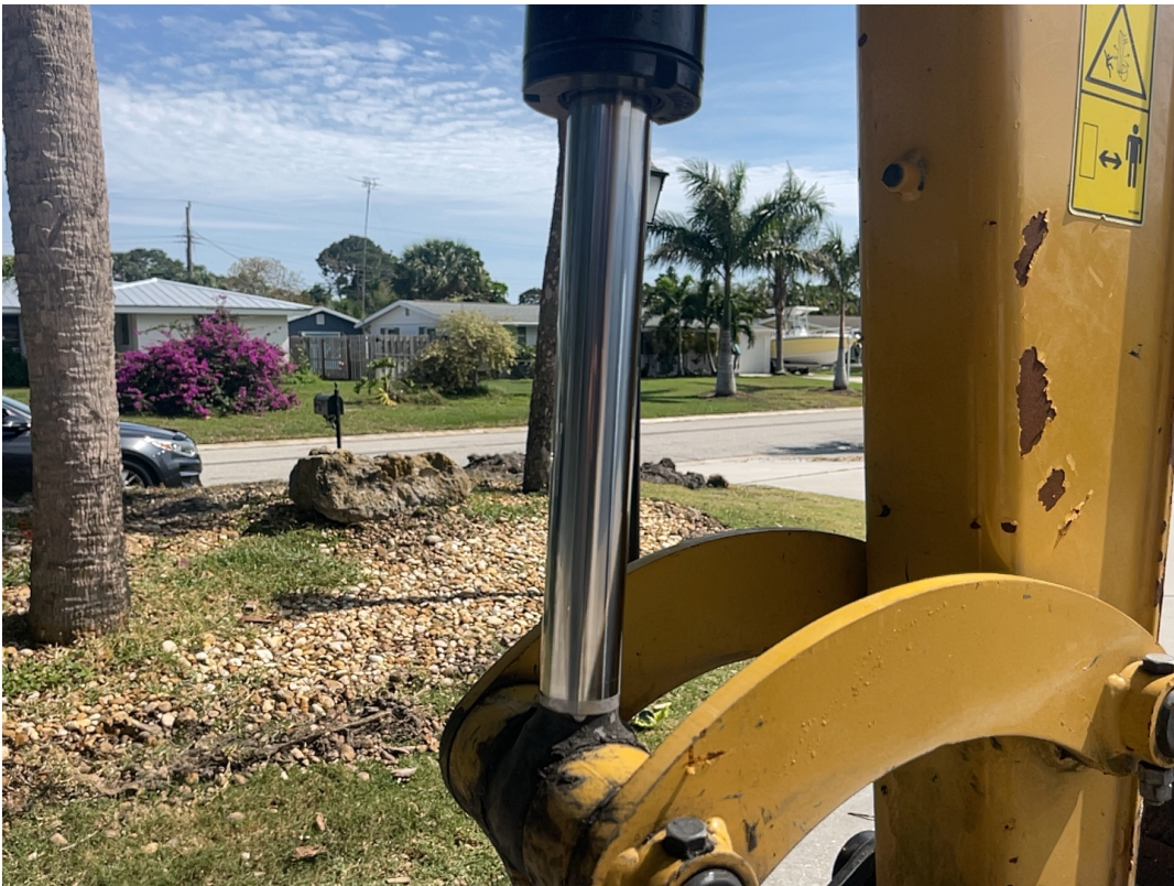
Cylinders / 04-04-2024