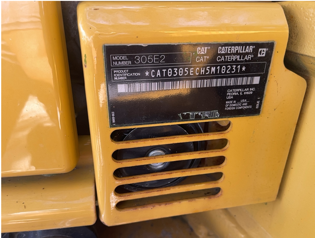
Serial Number: CAT0305ECH5M10231 / 04-04-2024