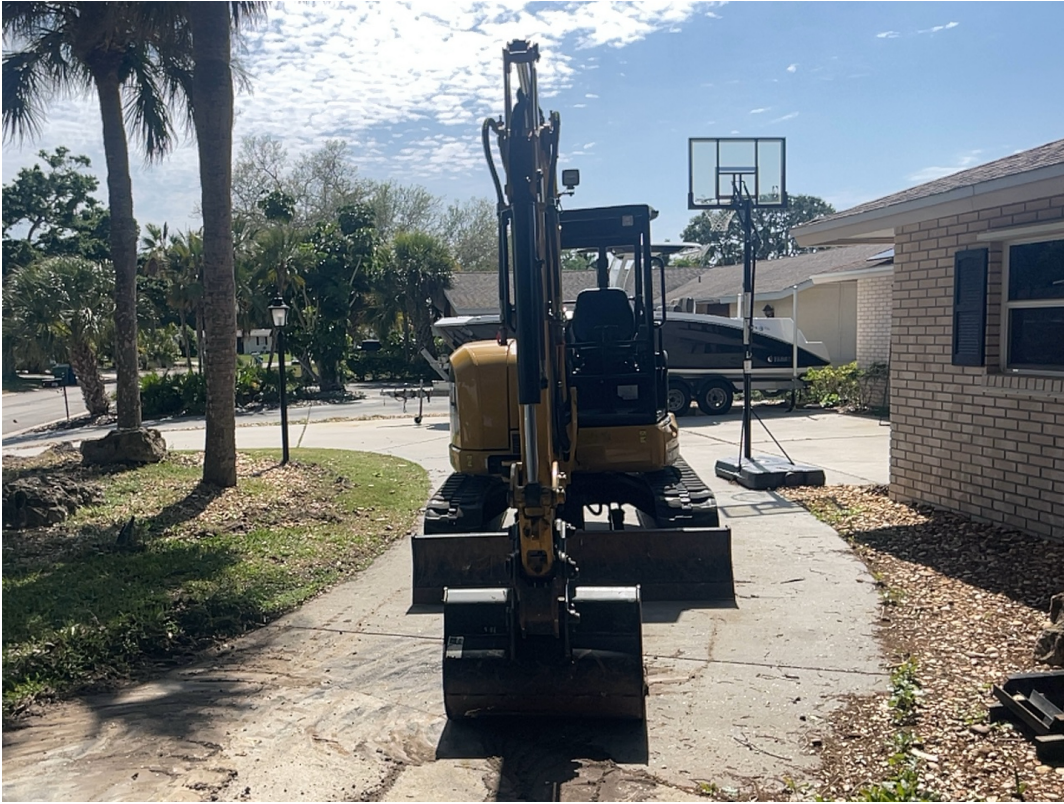
Front / 04-05-2024