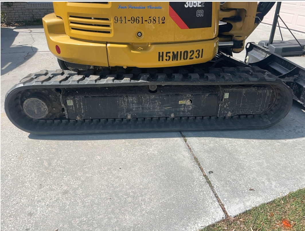
Right Track Condition / 04-04-2024