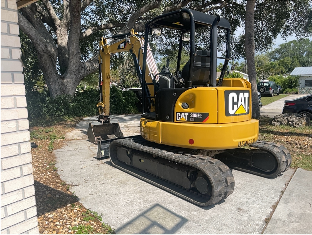
Rear Left / 04-04-2024