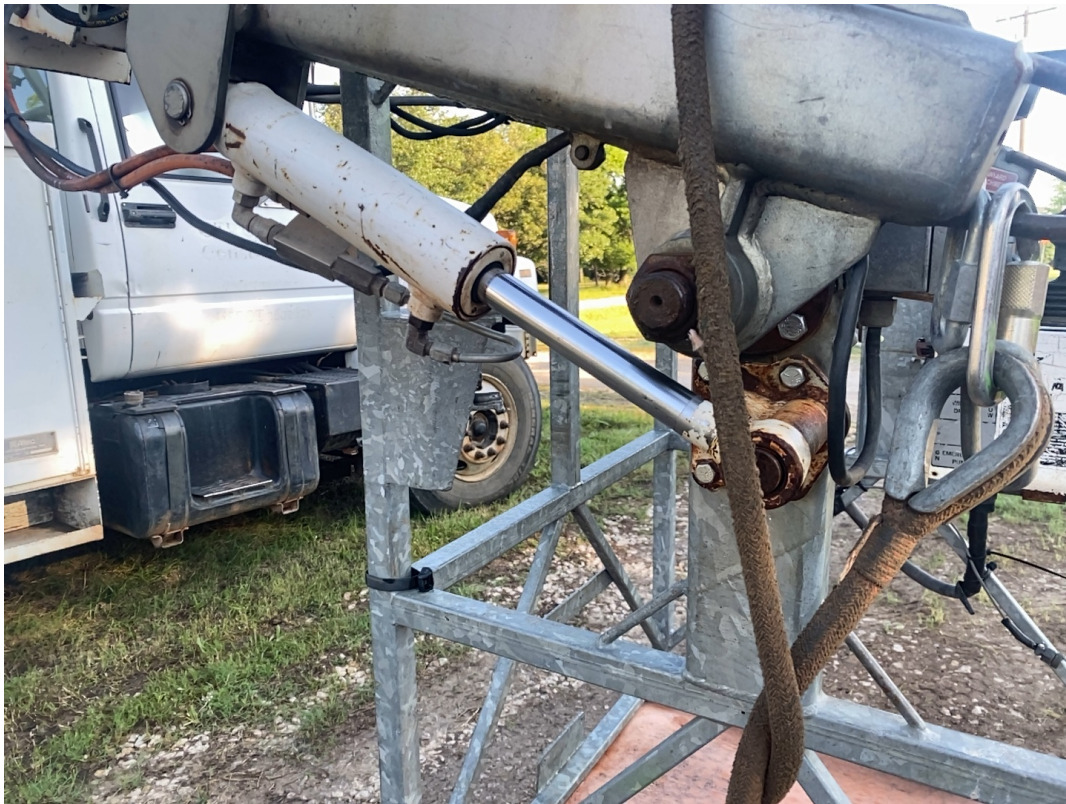
Cylinders / 05-15-2024