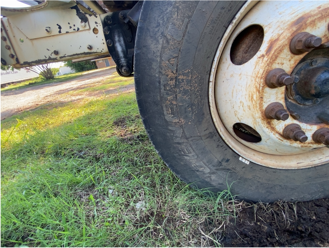
Left Steer Tire Brand / 05-14-2024