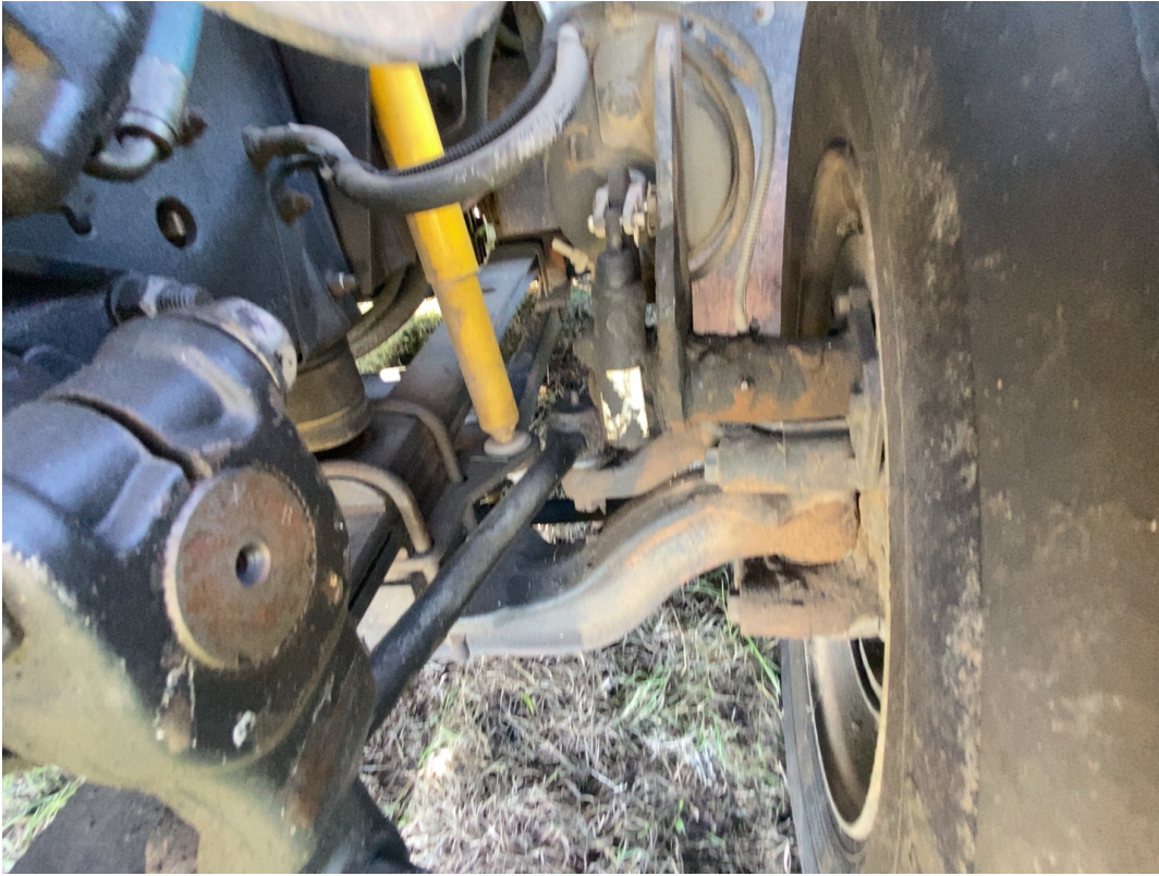
Axles / 05-14-2024