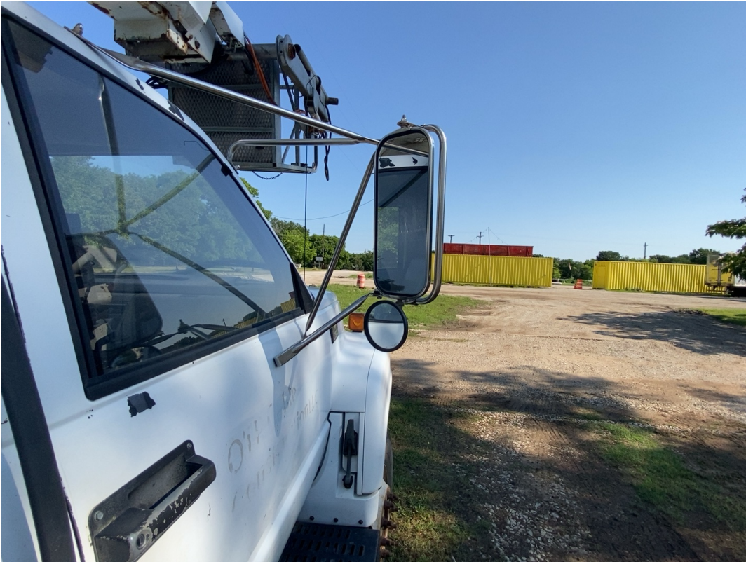
Mirrors / 05-14-2024