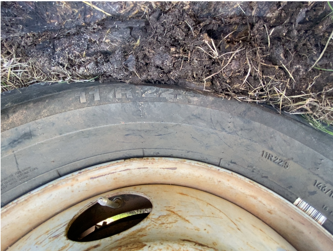
Left Steer Tire Size / 05-16-2024