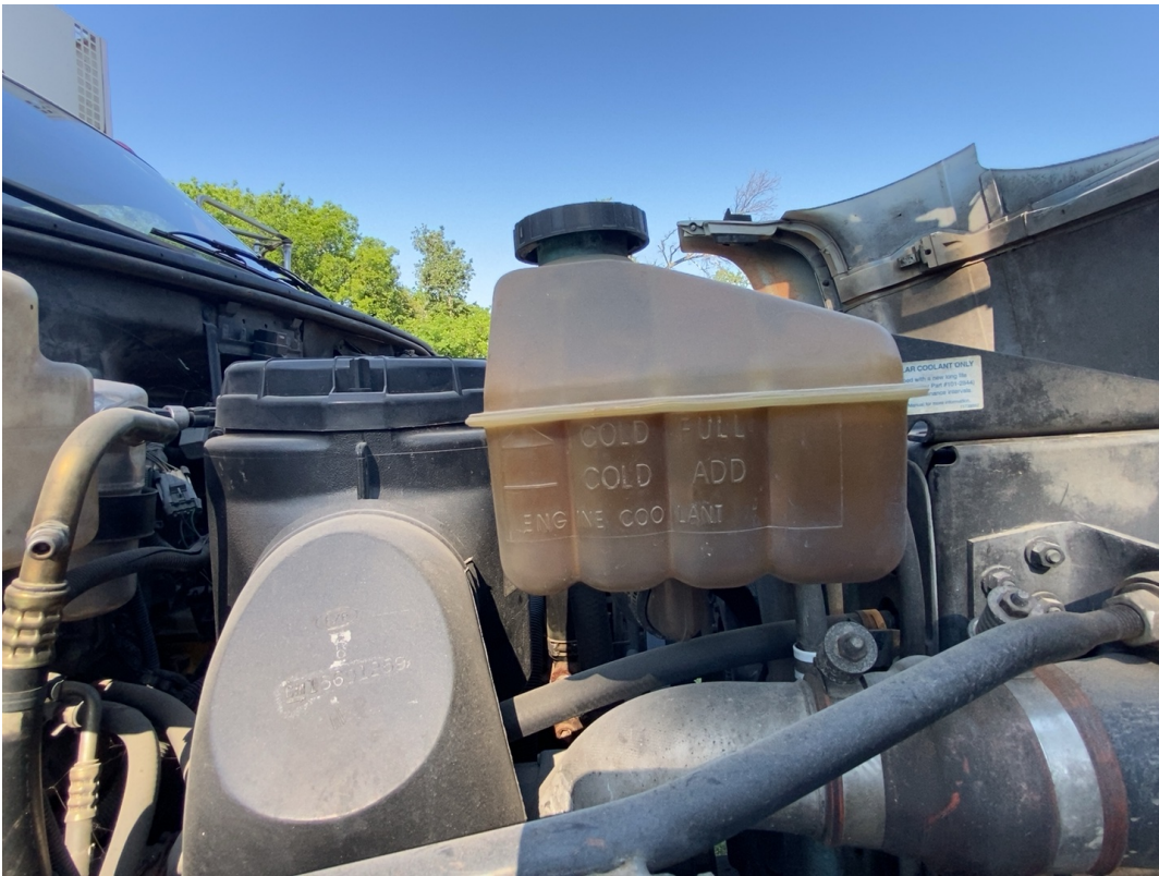
Coolant / 05-14-2024