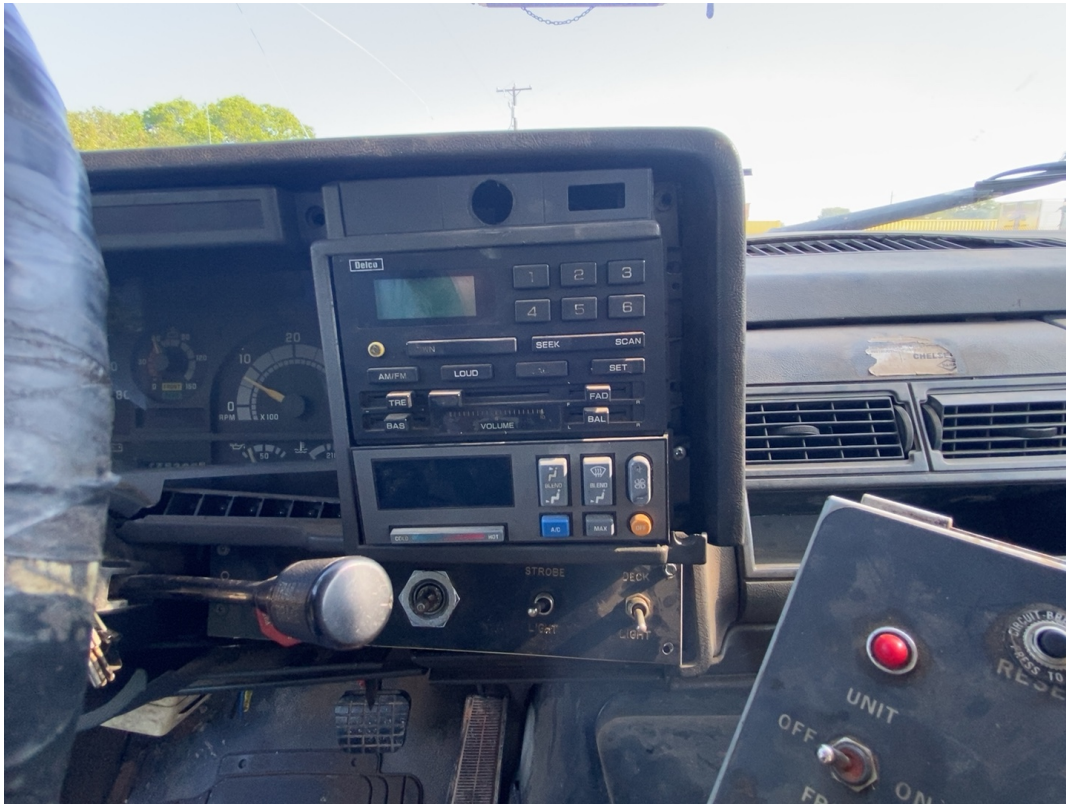
Radio / A/C / Switches and Controls / 05-14-2024