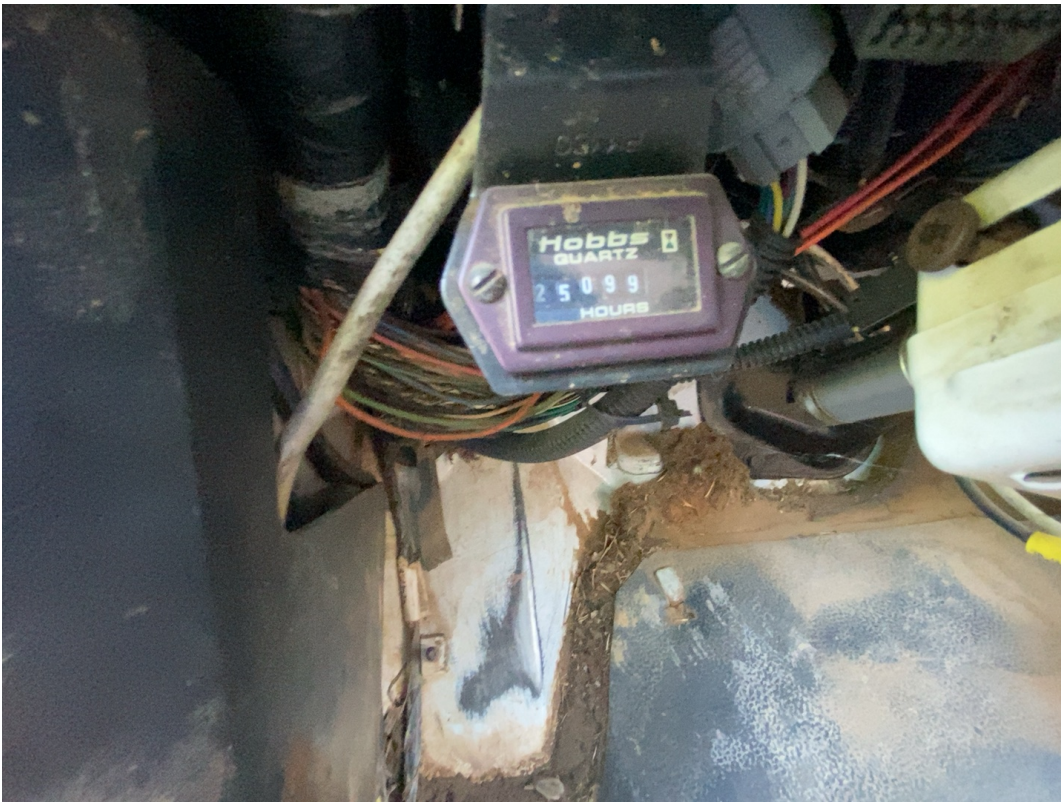
Engine Hours: 25,099 / 05-14-2024