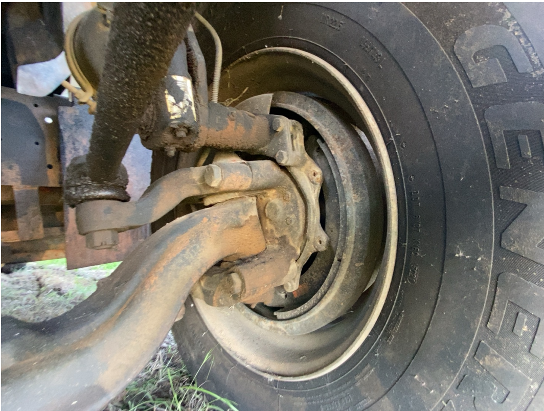
Axles / Brakes / 05-14-2024