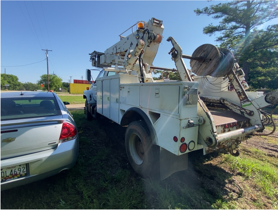
Rear Left / 05-14-2024