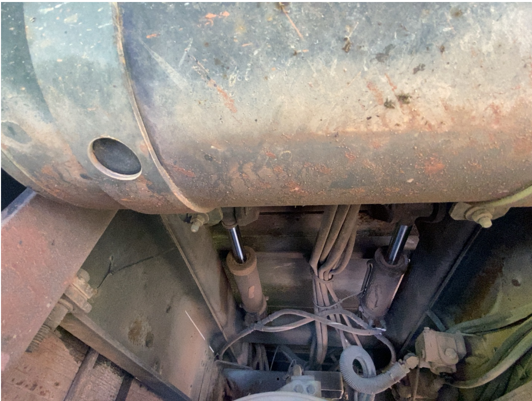
Cylinders / 05-14-2024