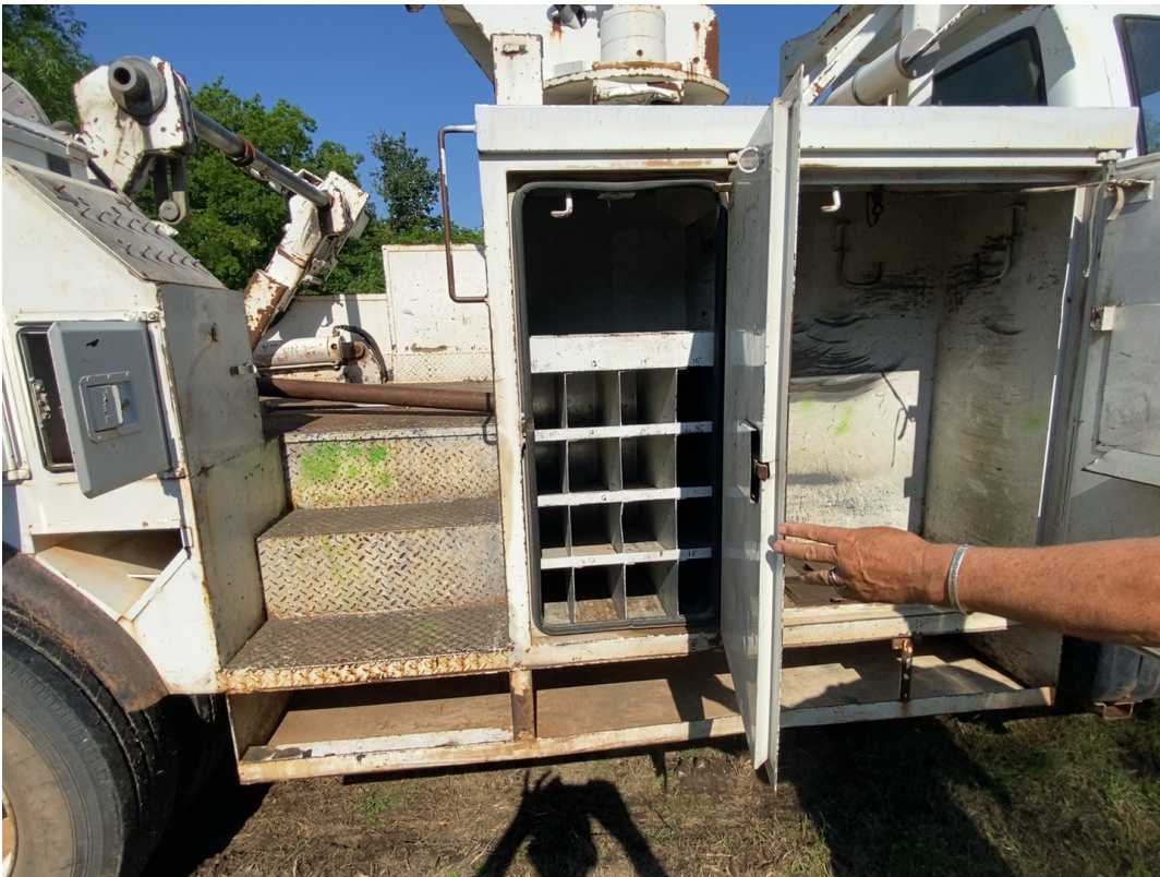
Handrails / Unit Condition / 05-14-2024