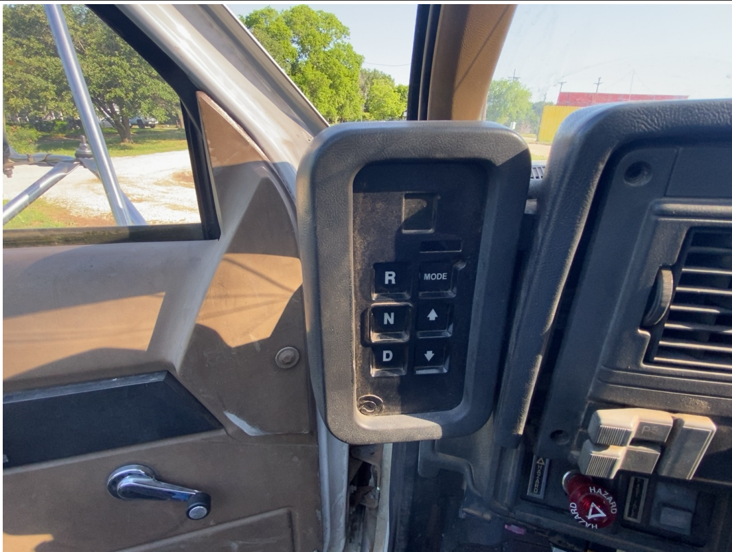
Transmission Shifter / 05-14-2024