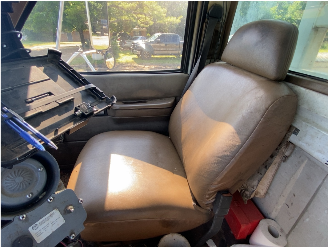
Passenger's Seat / 05-14-2024