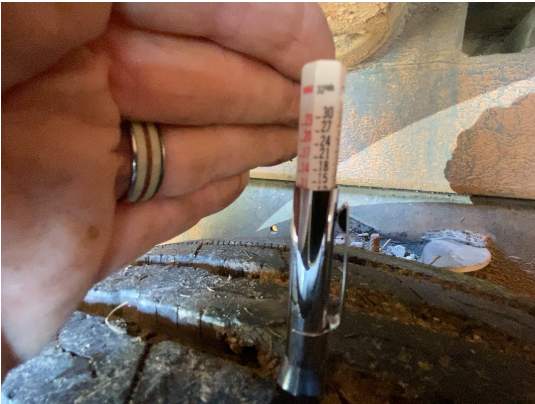
Right Inner Drive Tire Tread Depth Measurement / 05-14-2024