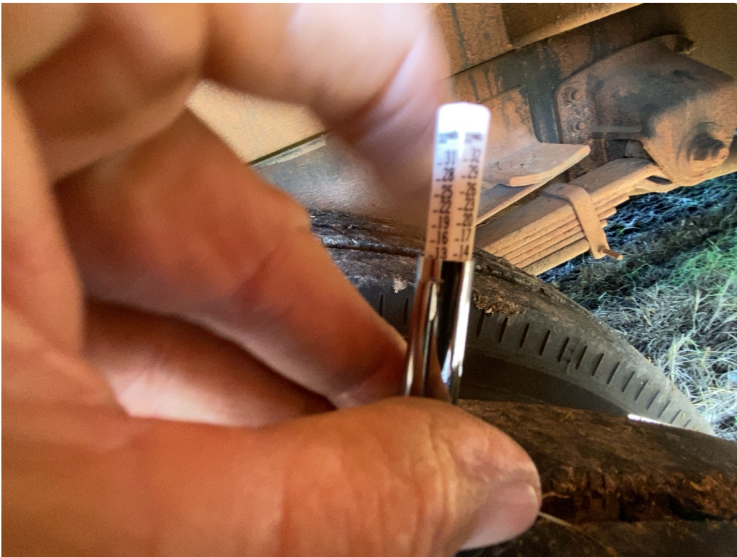
Right Outer Drive Tire Tread Depth Measurement / 05-14-2024