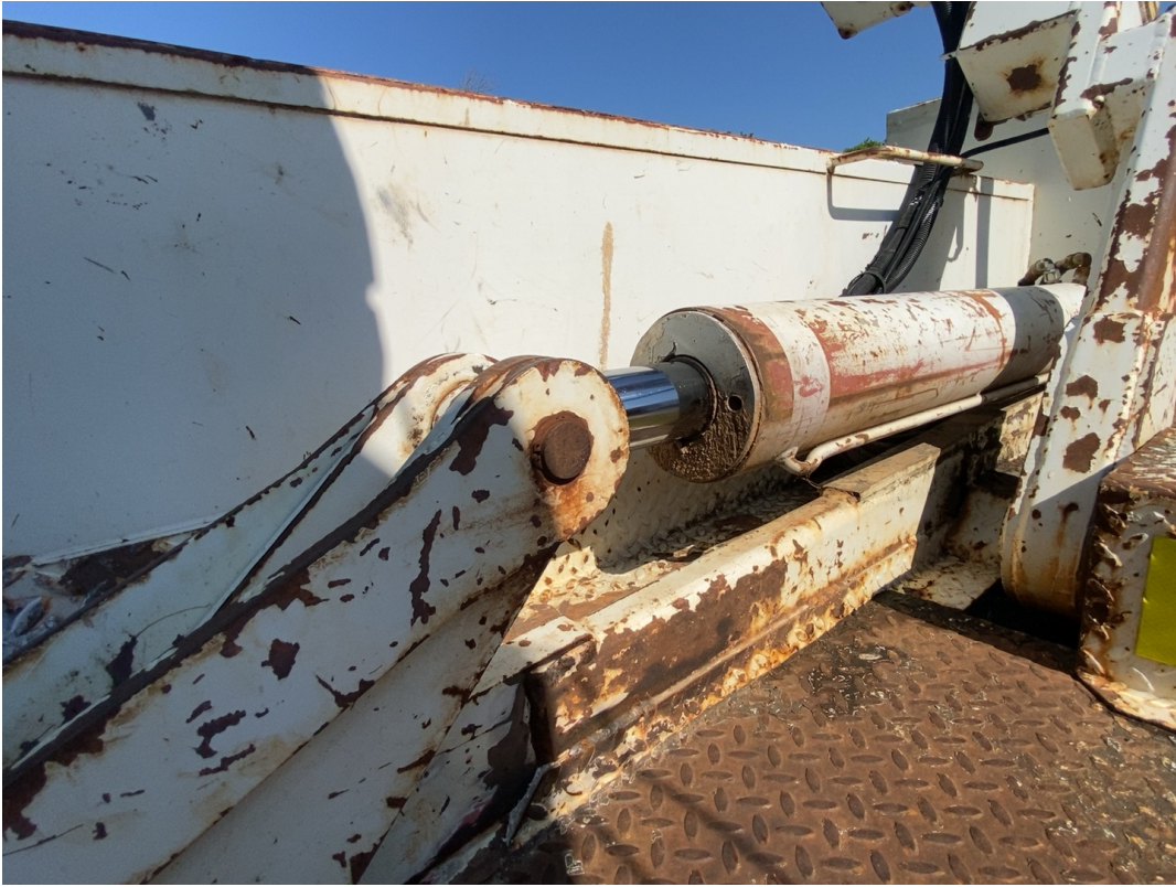
Cylinders / 05-14-2024