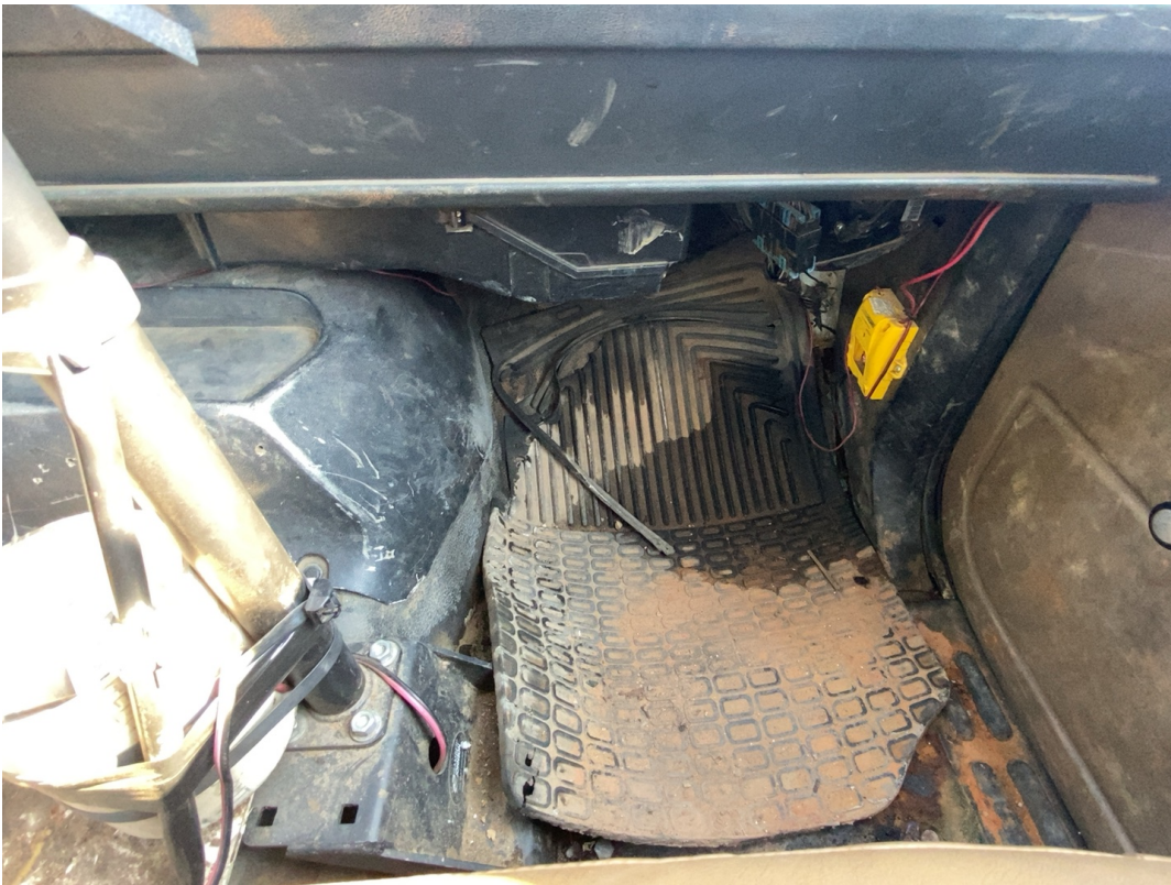
Floorboard / 05-14-2024