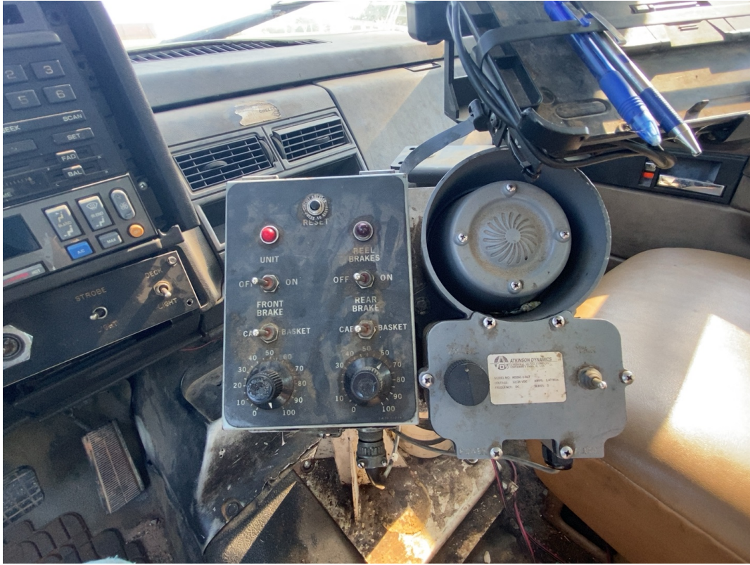
Switches and Controls / 05-14-2024