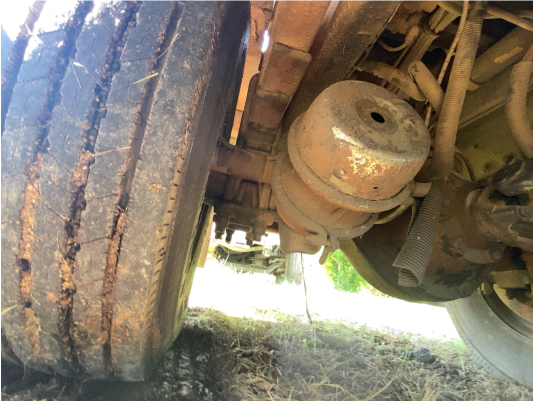
Axles / 05-14-2024