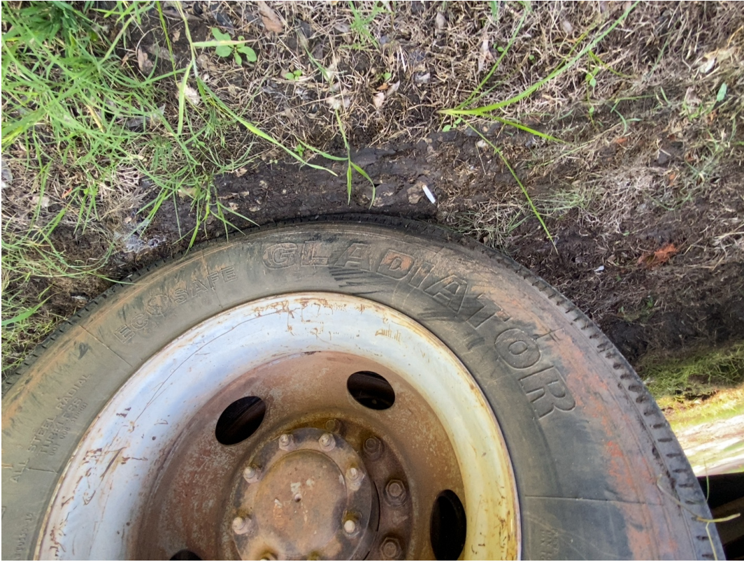
Left Outer Drive Tire Brand / 05-16-2024