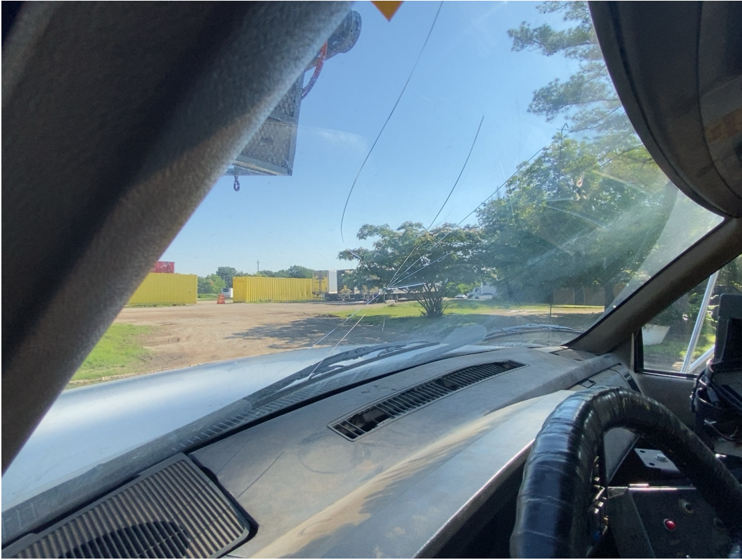
Cab Interior / 05-14-2024