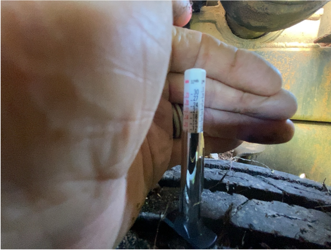
Left Inner Drive Tire Tread Depth Measurement / 05-14-2024