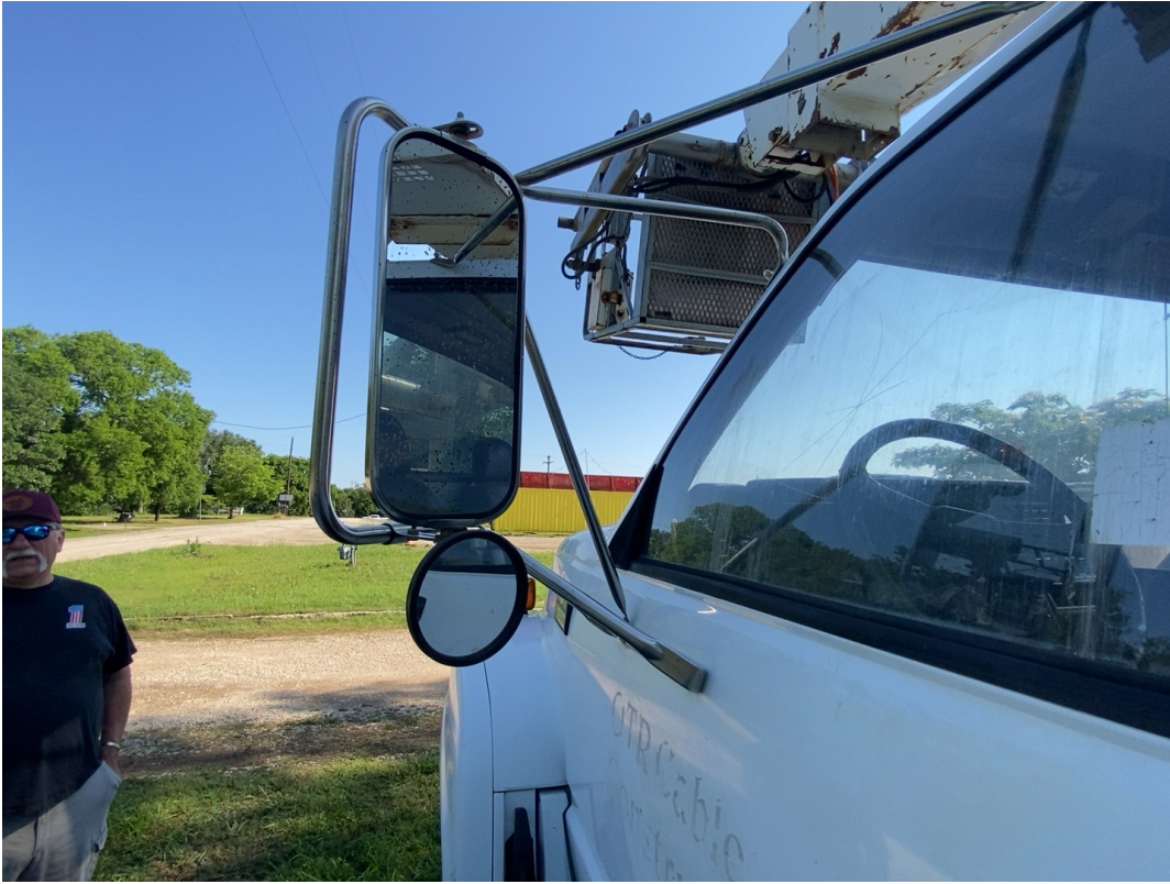
Mirrors / 05-14-2024