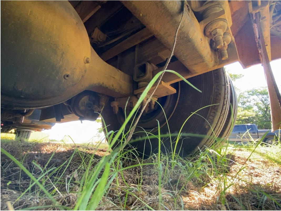
Axles / 05-14-2024