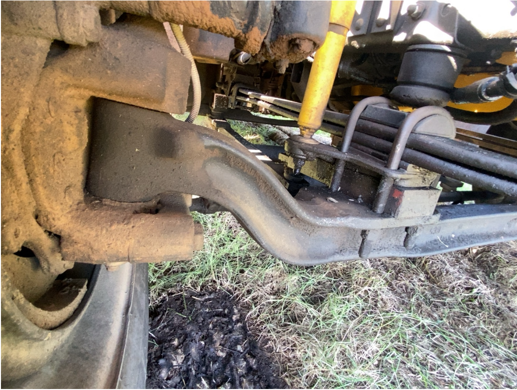
Axles / 05-14-2024