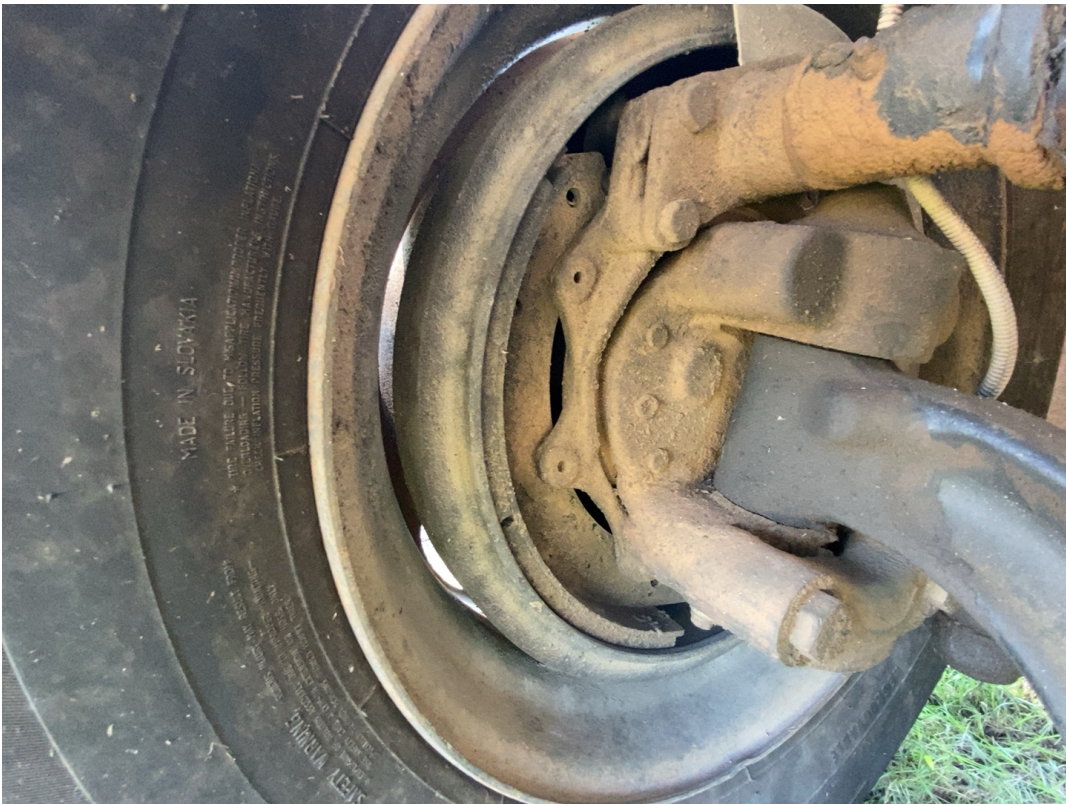
Axles / 05-14-2024