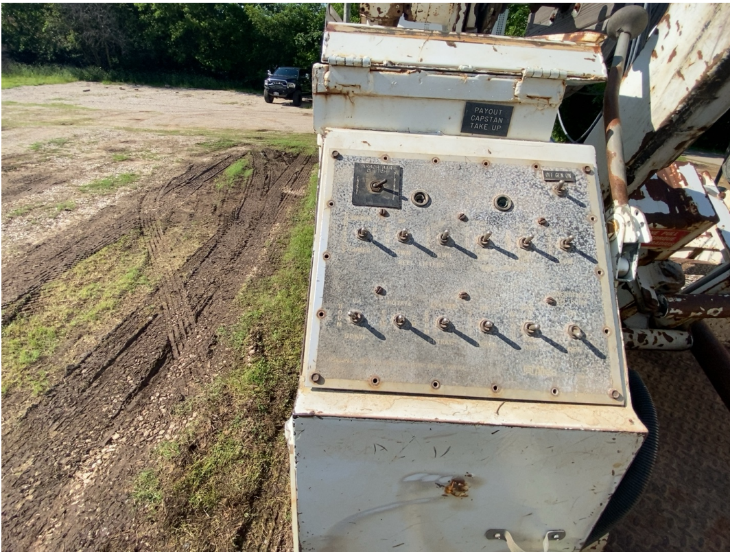
Switches and Controls / 05-14-2024