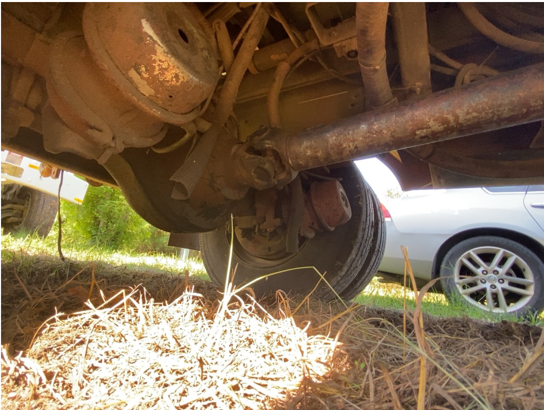
Suspension / Axles / 05-14-2024