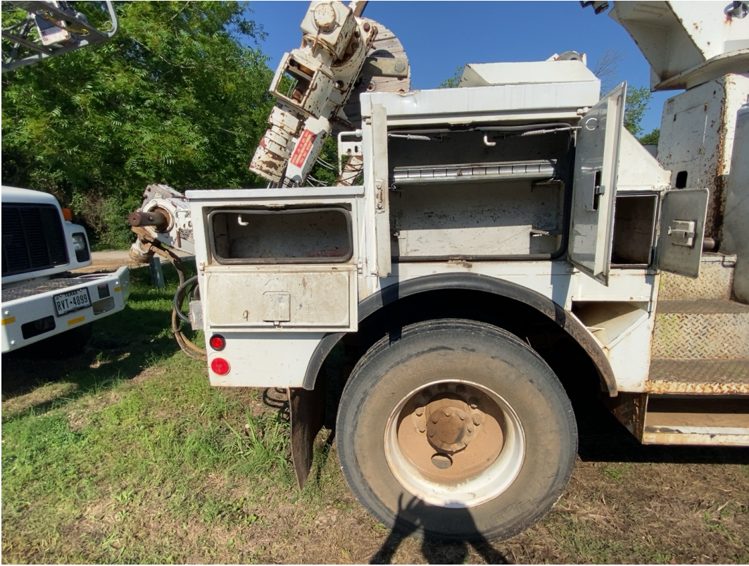
Unit Condition / 05-14-2024