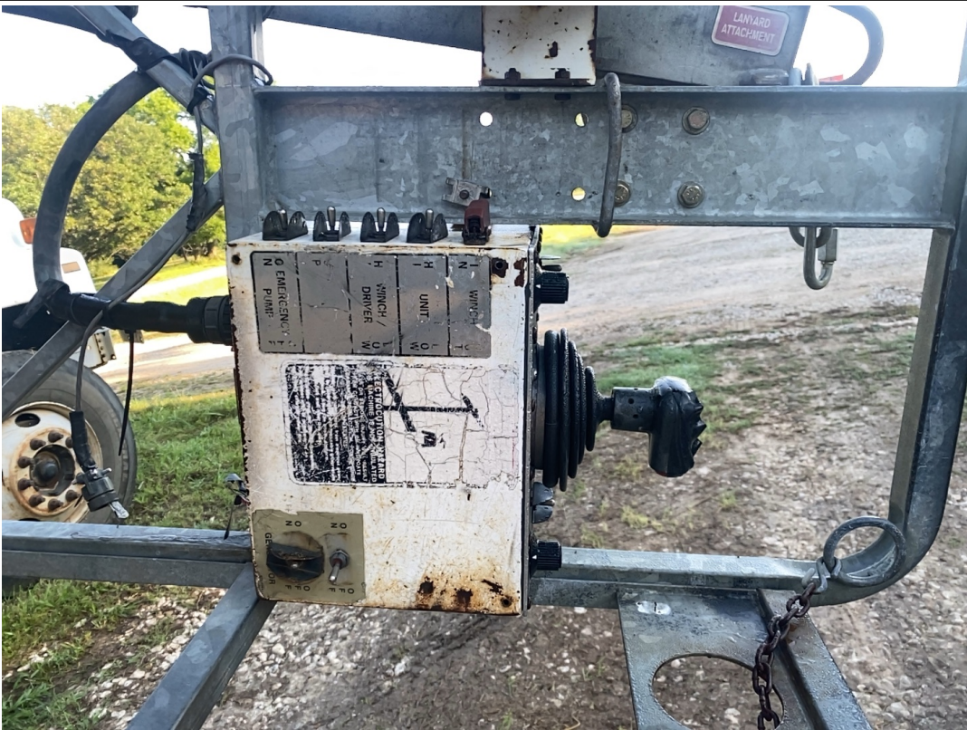
Switches and Controls / 05-15-2024