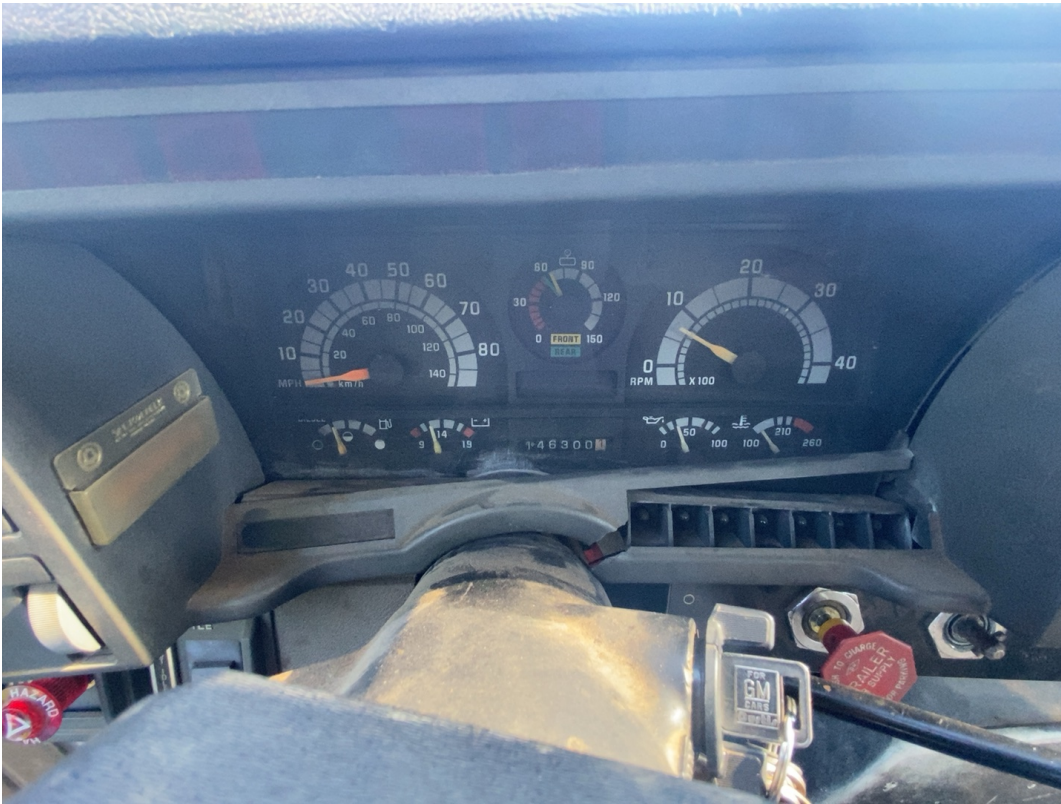
Odometer: 146,300 / EMS Warning Lights / 05-14-2024