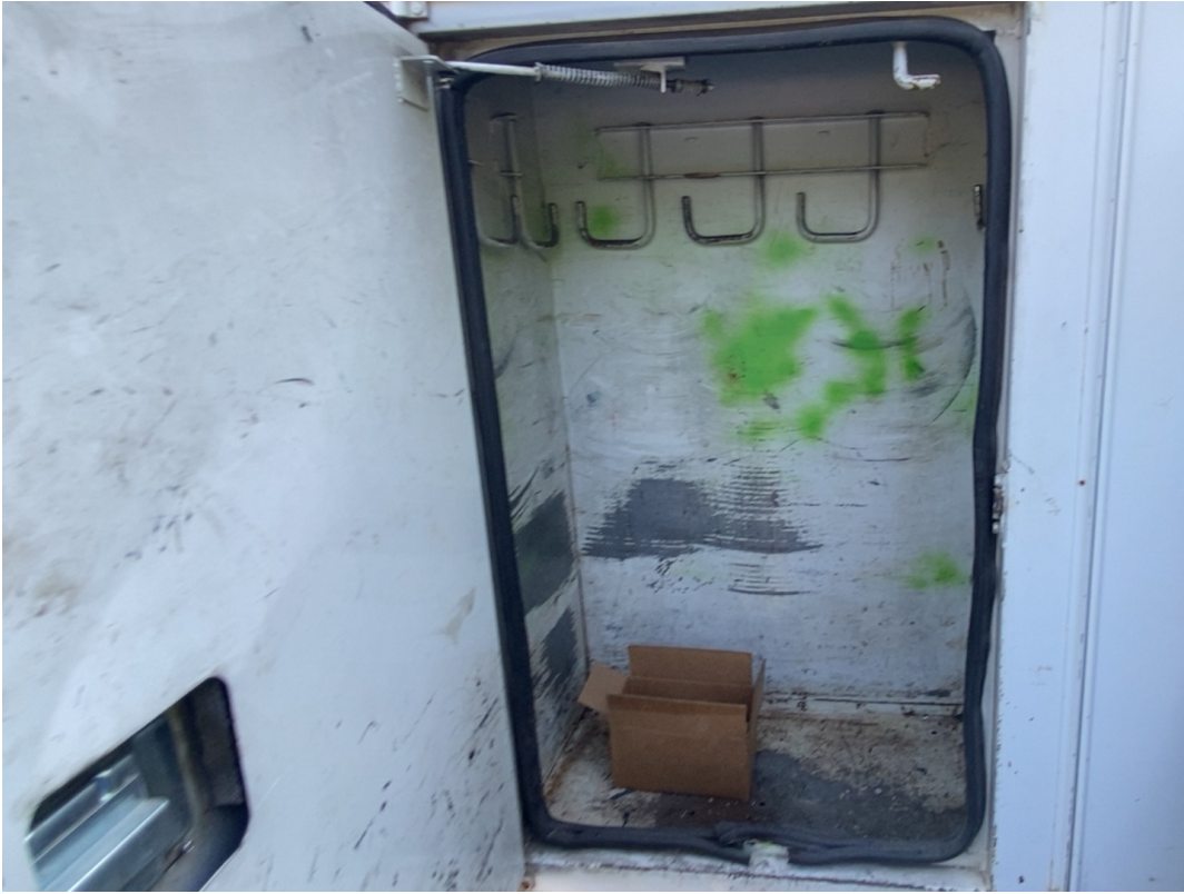
Unit Condition / 05-14-2024