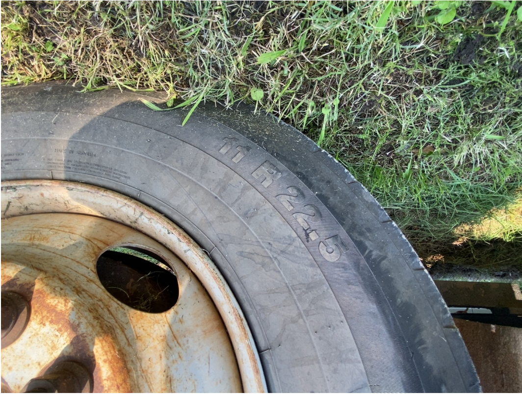
Right Steer Tire Size / 05-16-2024