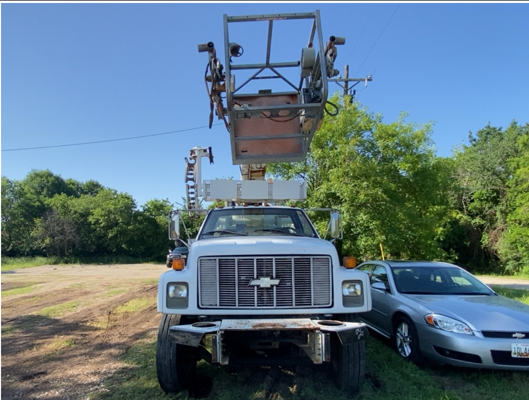
Front / Front Lights / 05-14-2024