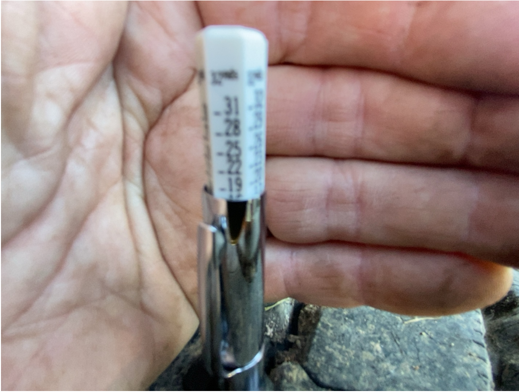
Left Steer Tire Tread Depth Measurement / 05-14-2024