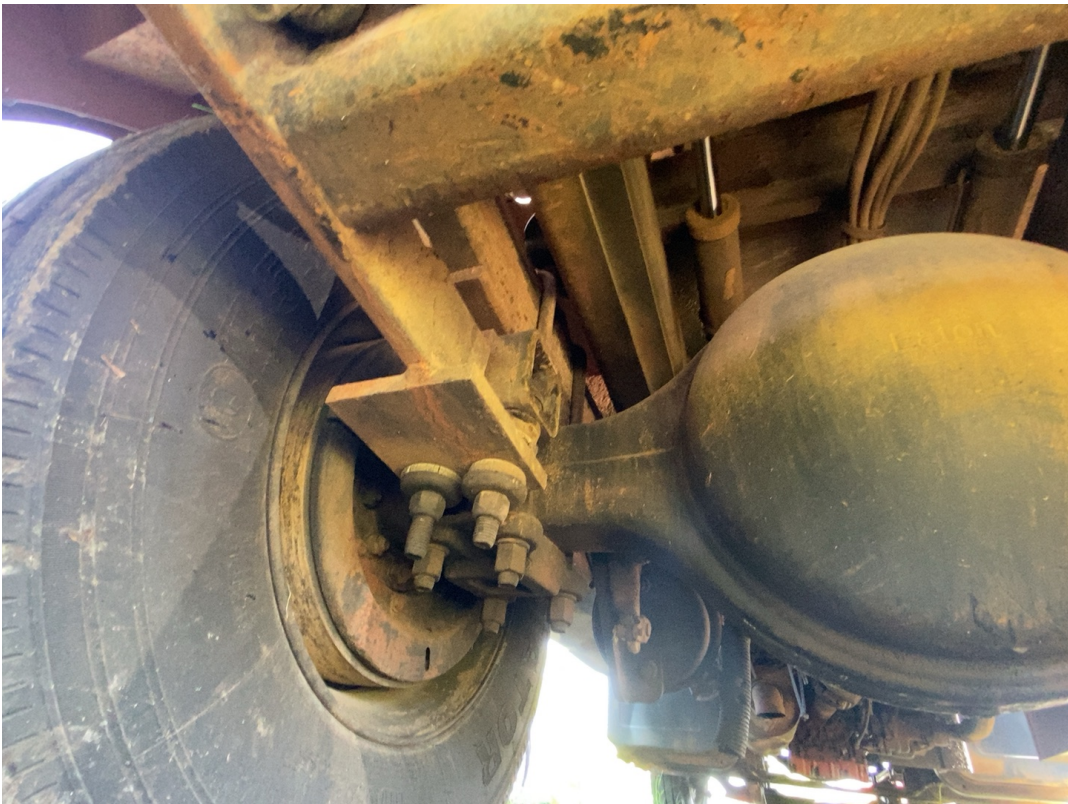
Axles / 05-14-2024