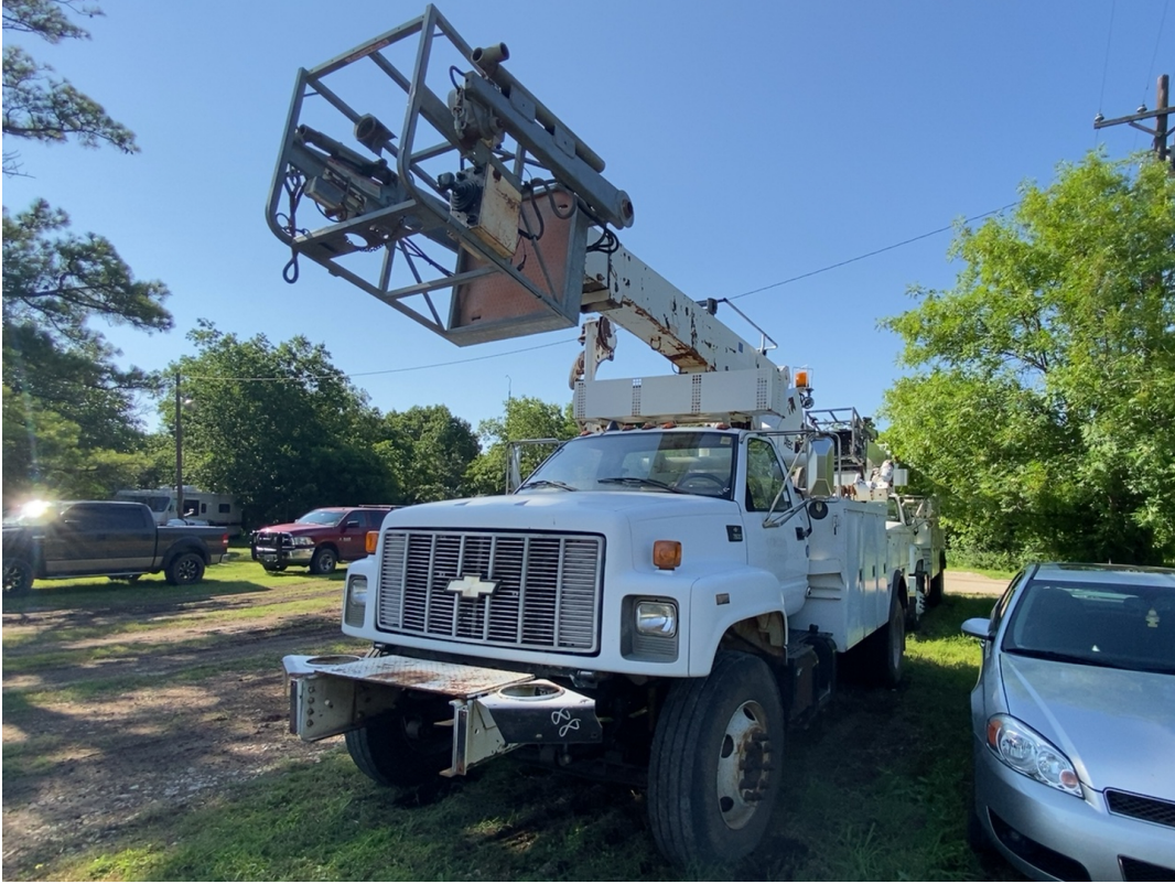
Front Left / 05-16-2024