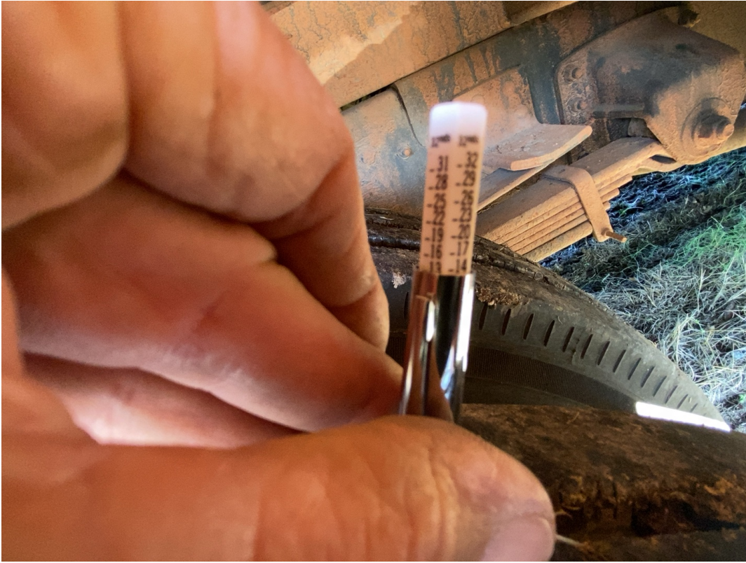
Right Outer Drive Tire Tread Depth Measurement / 05-14-2024