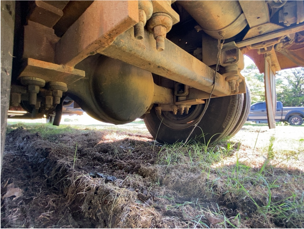
Axles / 05-14-2024