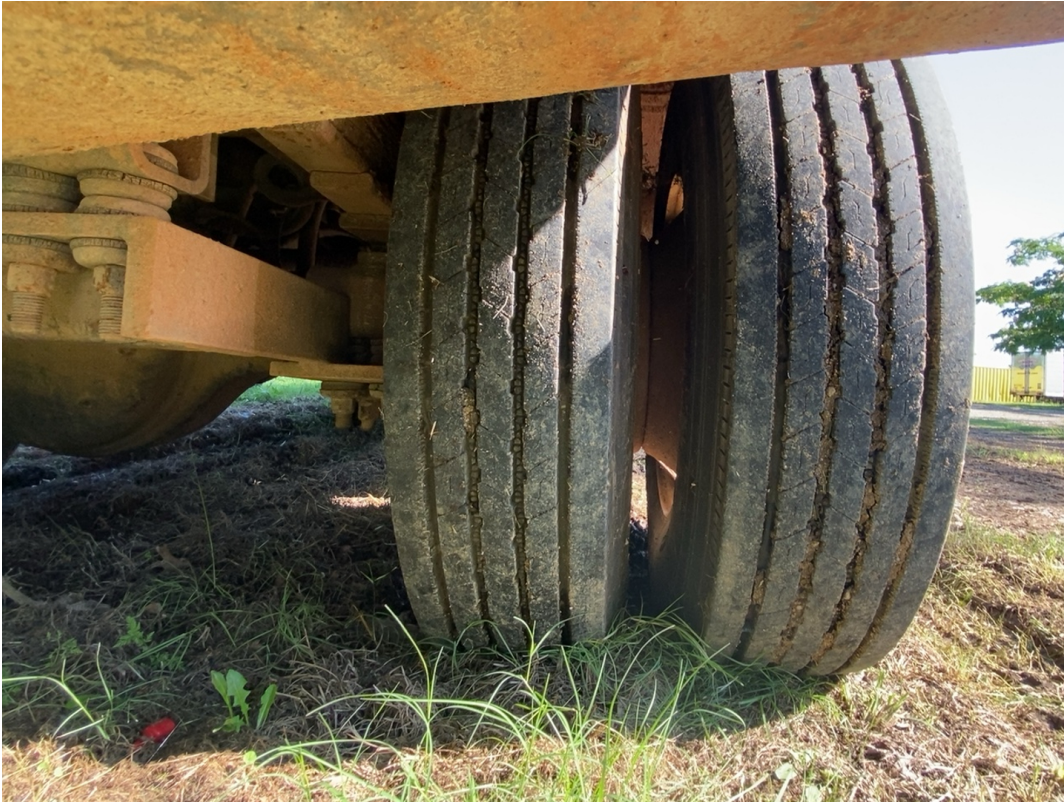
Right Outer Drive Tire Condition / Right Inner Drive Tire Condition / 05-15-2024