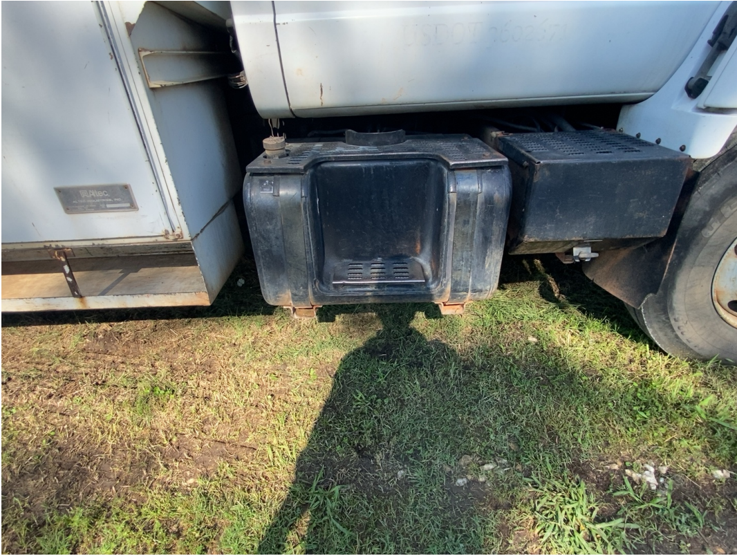
Steps / 05-14-2024