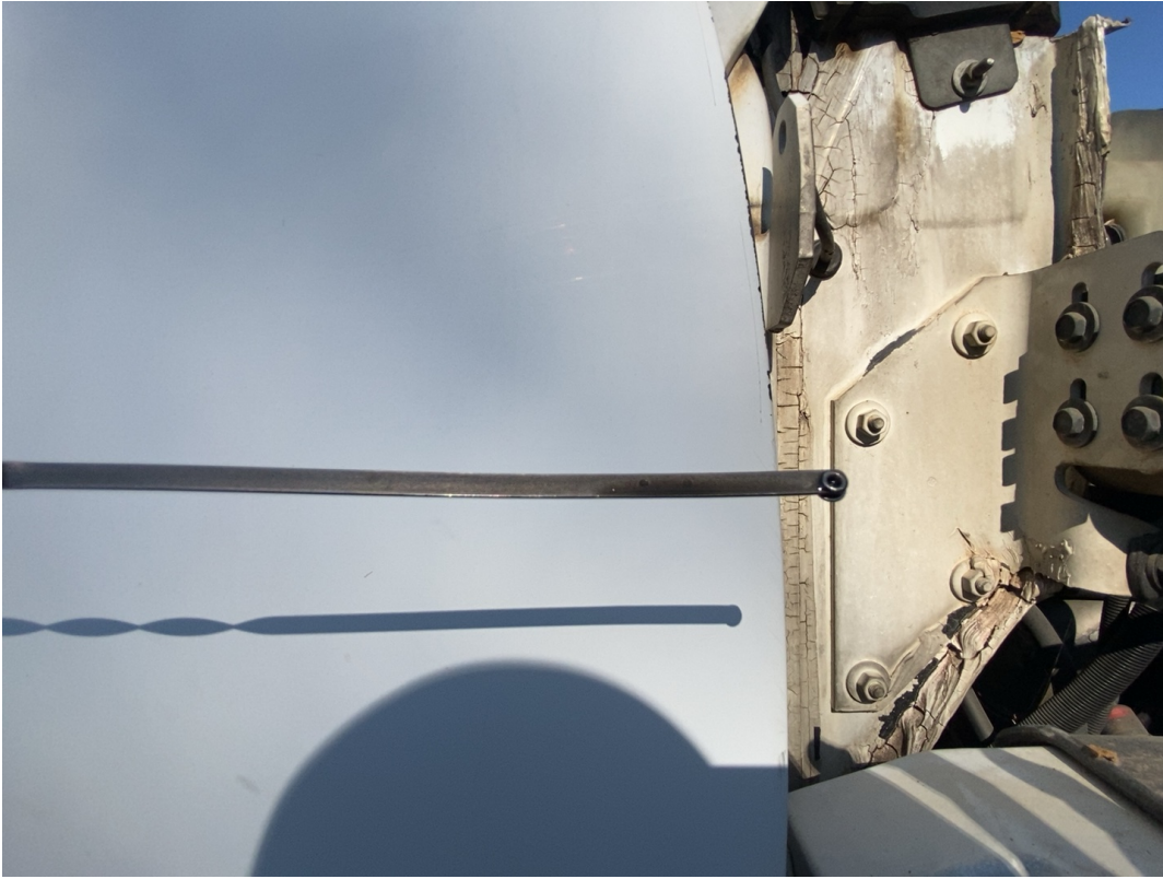
Oil Dipstick / 05-14-2024