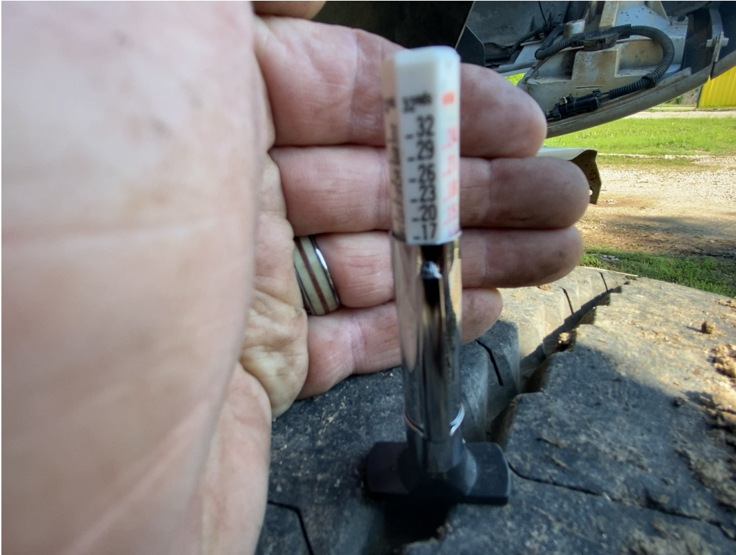
Right Steer Tire Tread Depth Measurement / 05-14-2024