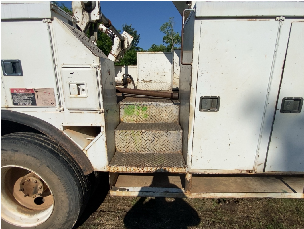
Steps / 05-14-2024