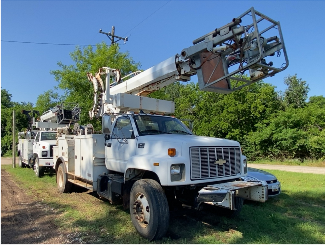
Front Right / 05-14-2024