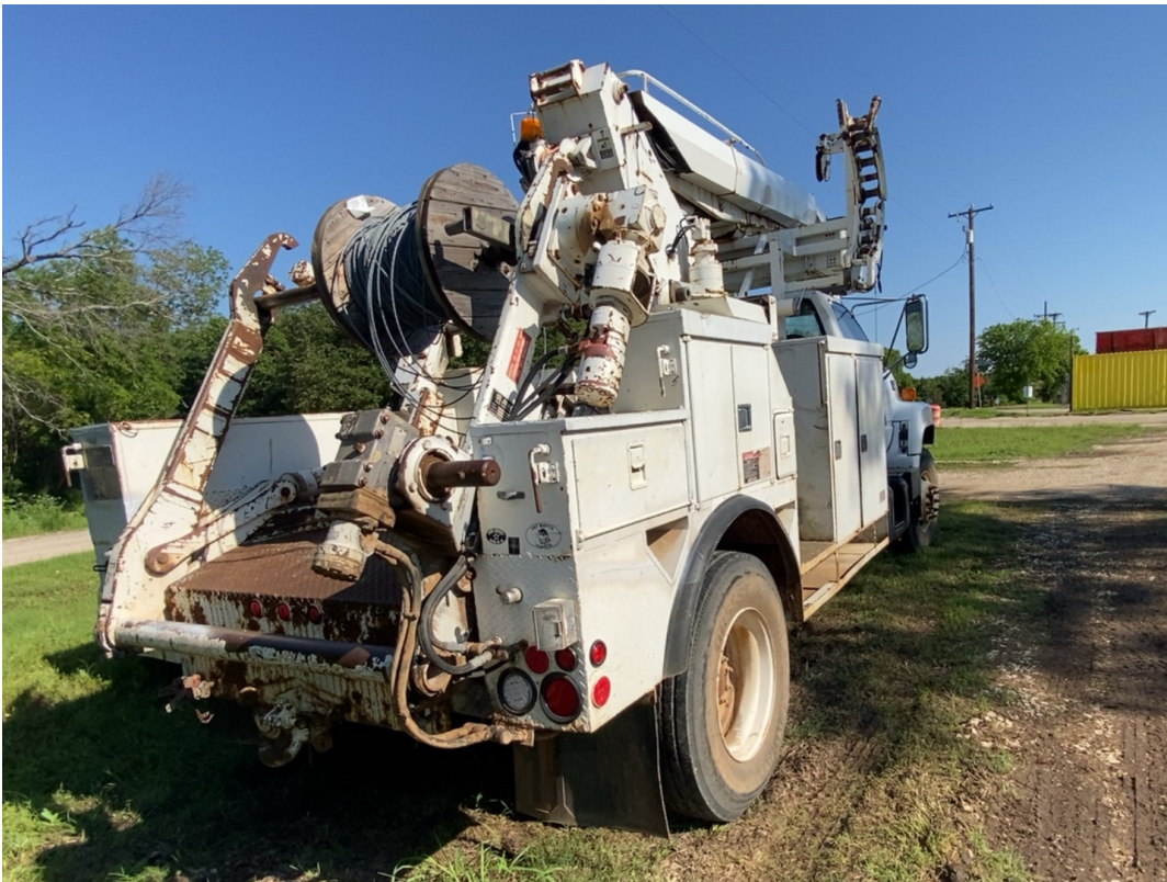
Rear Right / 05-14-2024