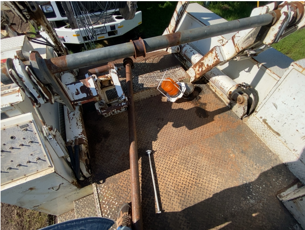
Floorboard / 05-14-2024