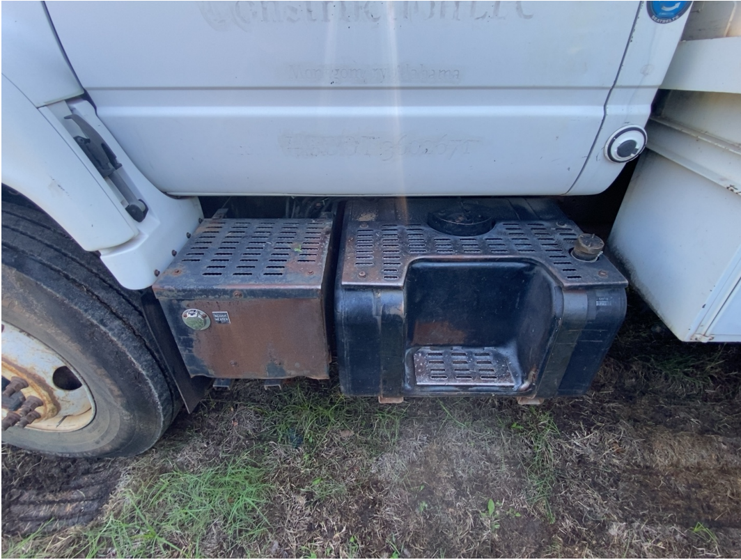
Steps / 05-14-2024