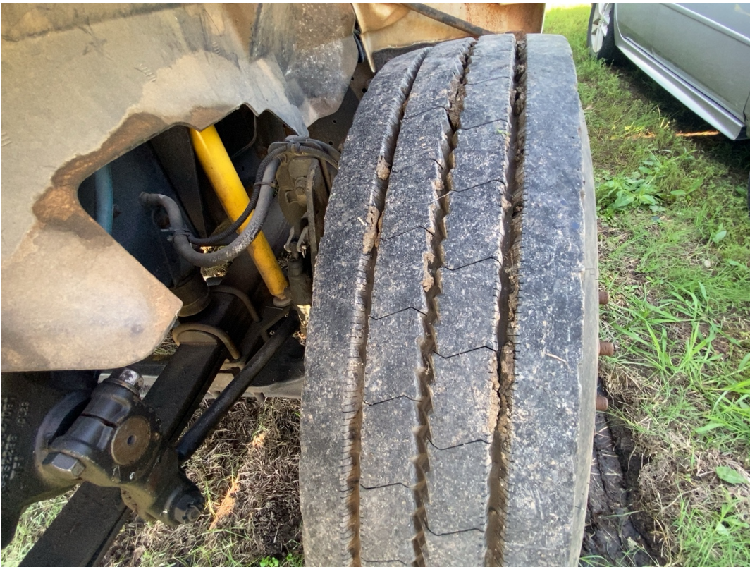
Left Steer Tire Condition / 05-14-2024