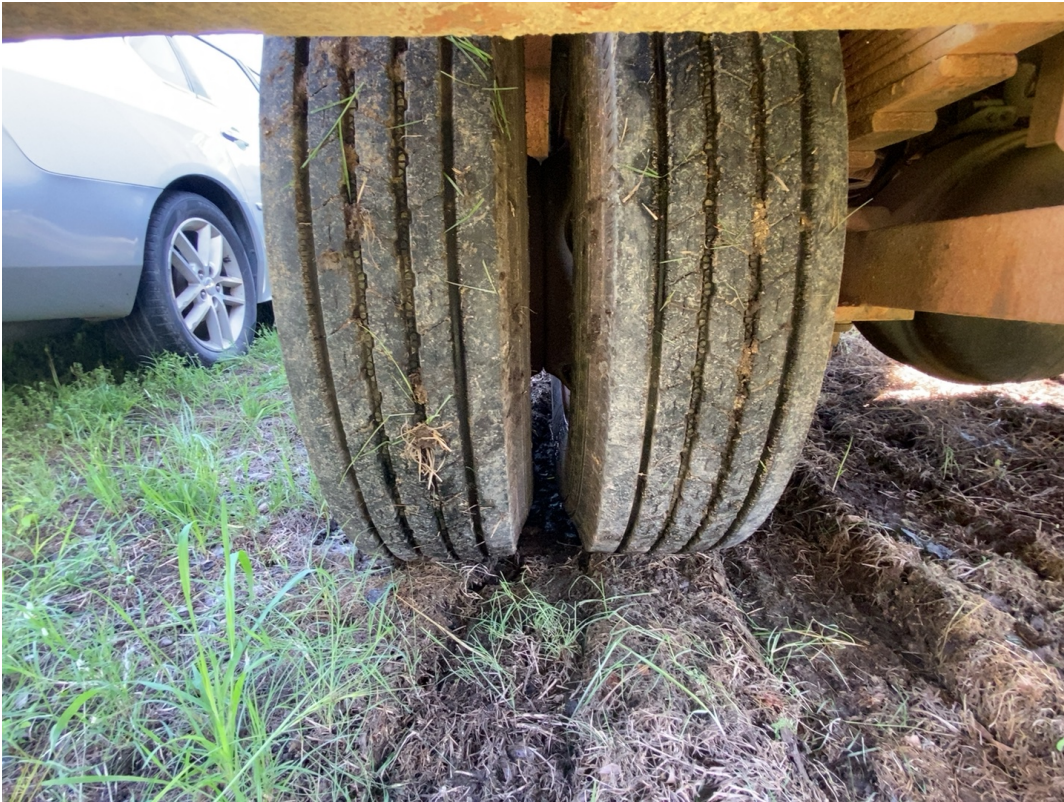
Left Outer Drive Tire Condition / Left Inner Drive Tire Condition / 05-14-2024