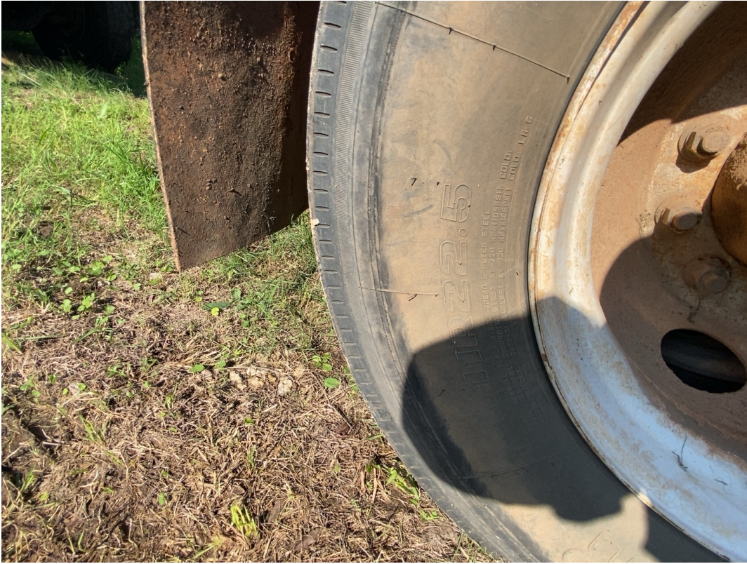
Right Outer Drive Tire Size / 05-14-2024