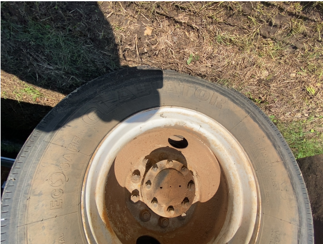
Right Outer Drive Tire Brand / 05-16-2024