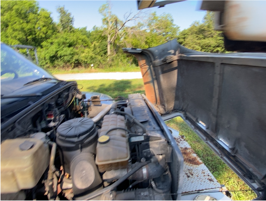
Engine Compartment / 05-14-2024