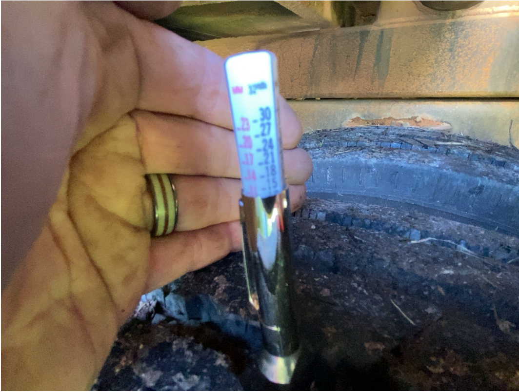
Left Outer Drive Tire Tread Depth Measurement / 05-14-2024