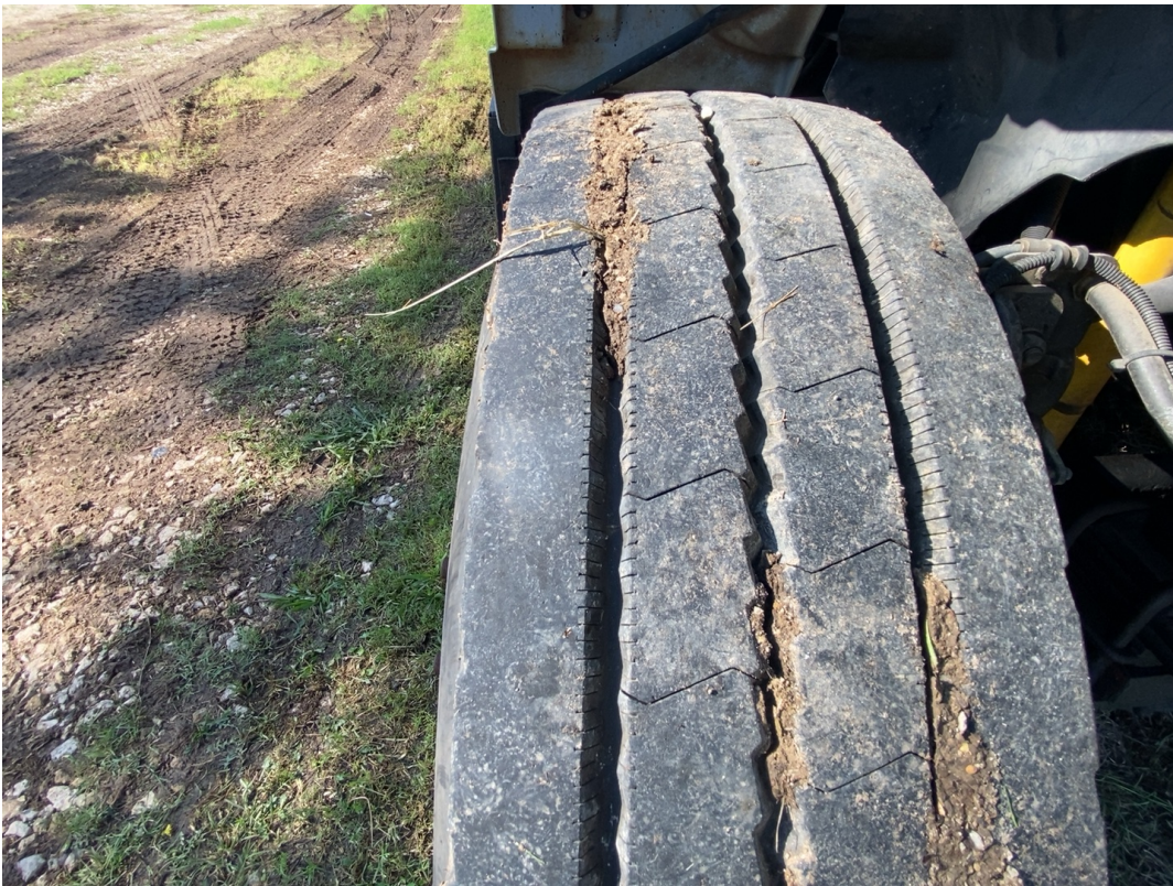
Right Steer Tire Condition / 05-14-2024