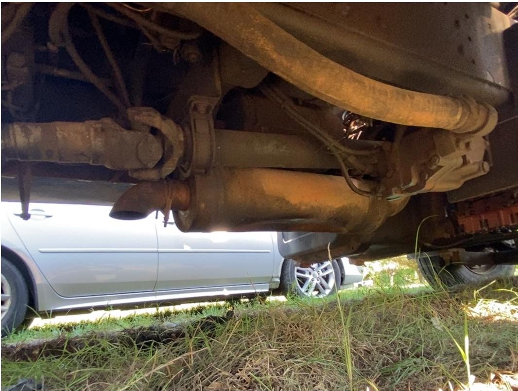
Exhaust Pipe / 05-15-2024