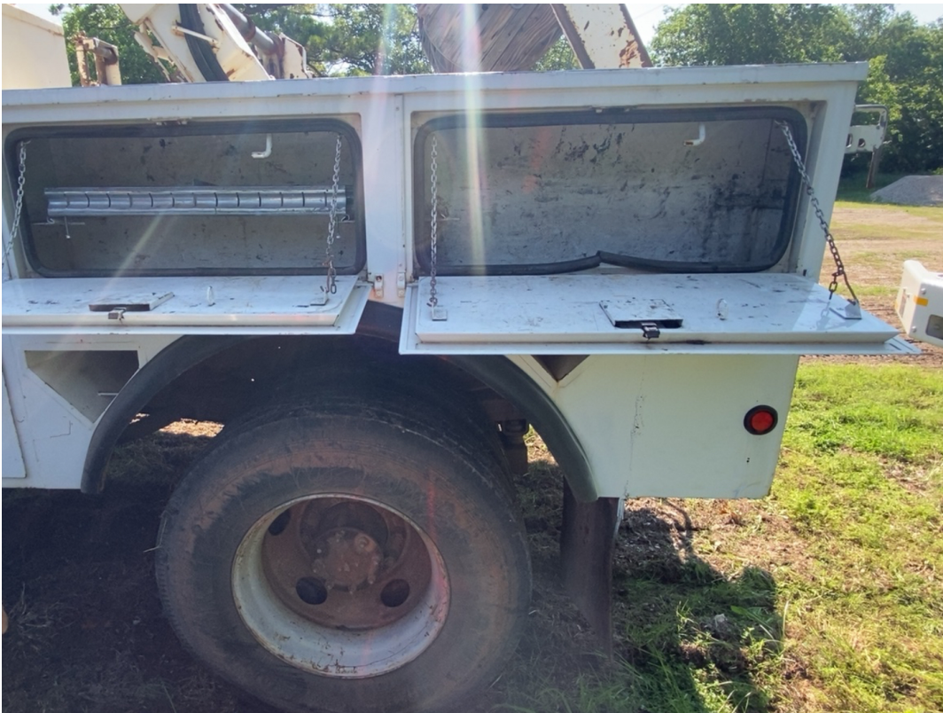
Unit Condition / 05-14-2024