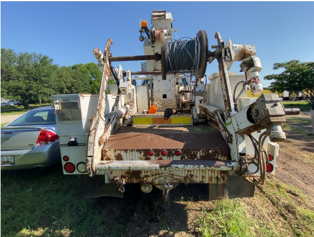
Rear / Rear Lights / 05-14-2024