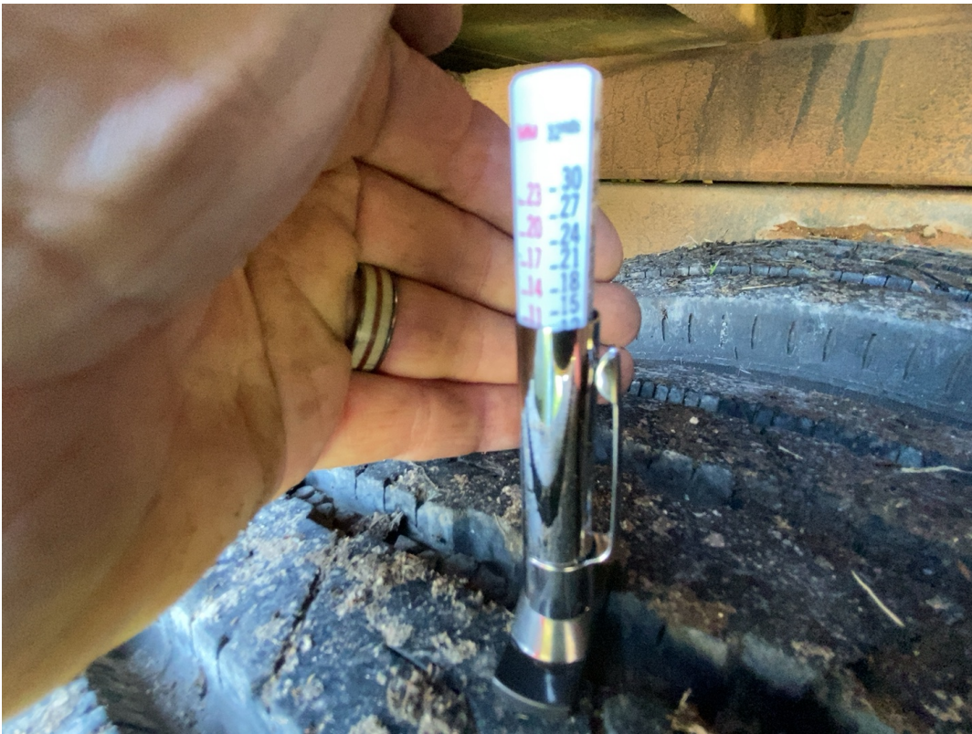
Left Outer Drive Tire Tread Depth Measurement / 05-14-2024