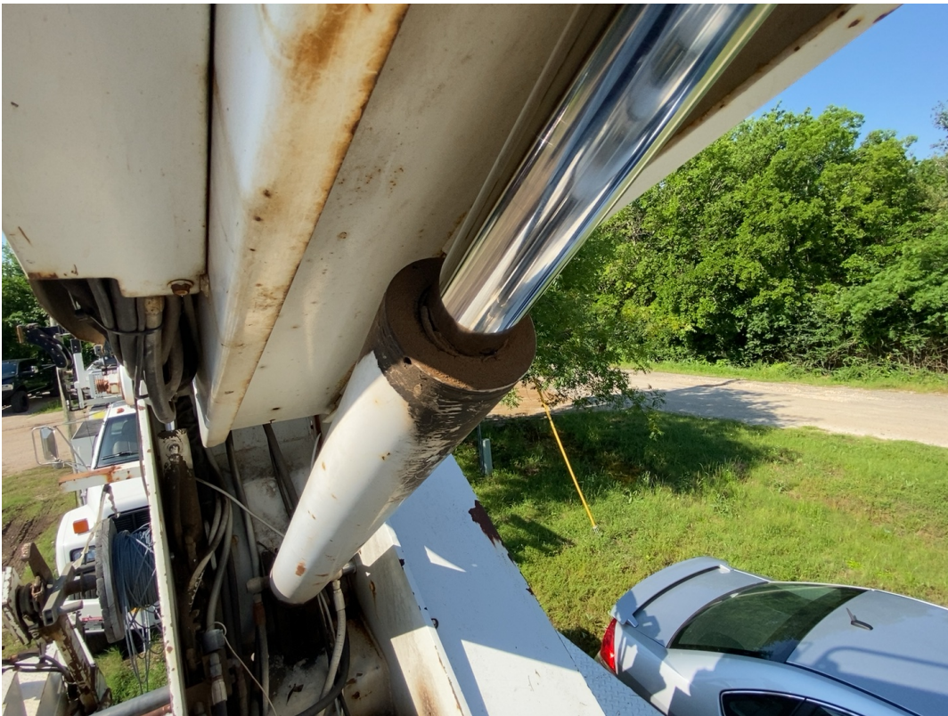
Cylinders / 05-14-2024