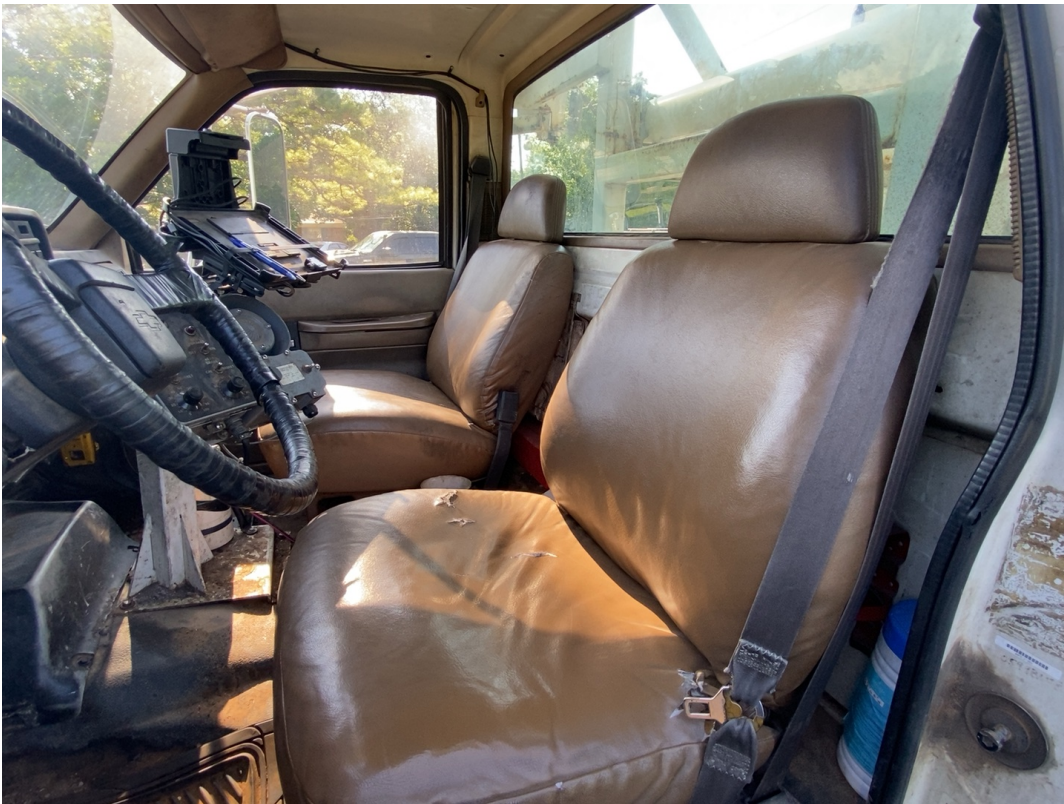
Driver's Seat / 05-14-2024