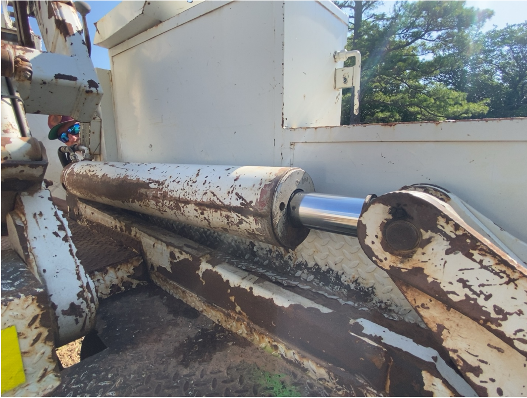
Cylinders / 05-14-2024