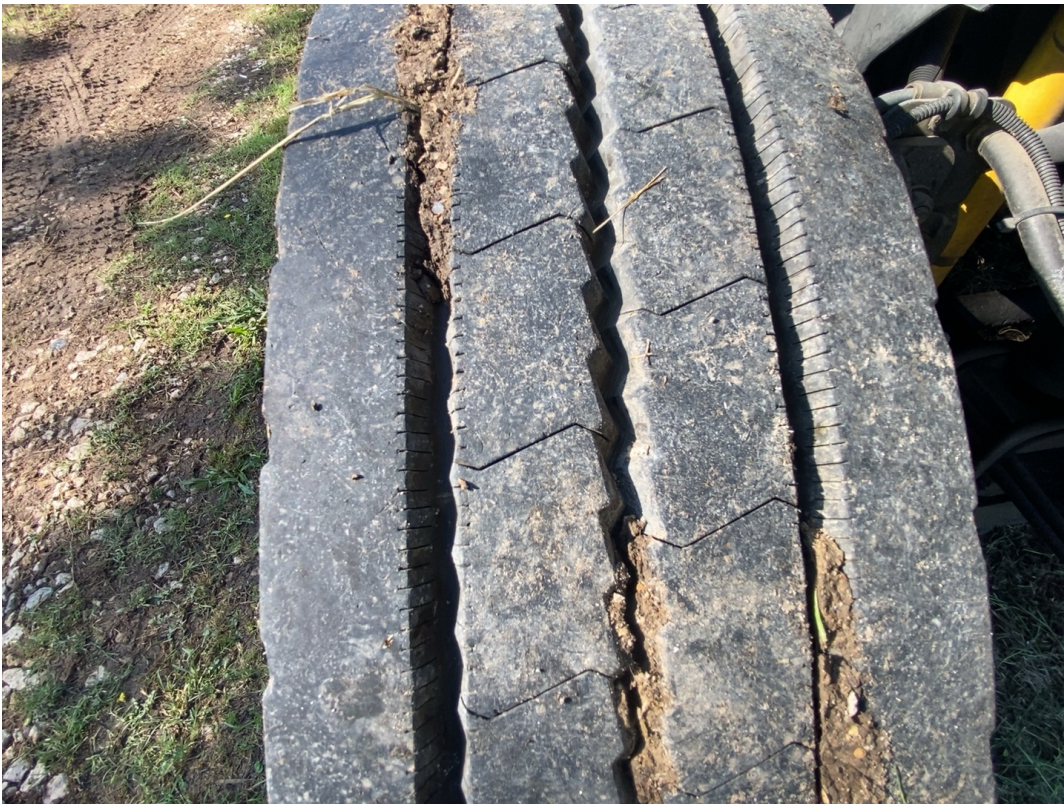
Right Steer Tire Condition / 05-14-2024