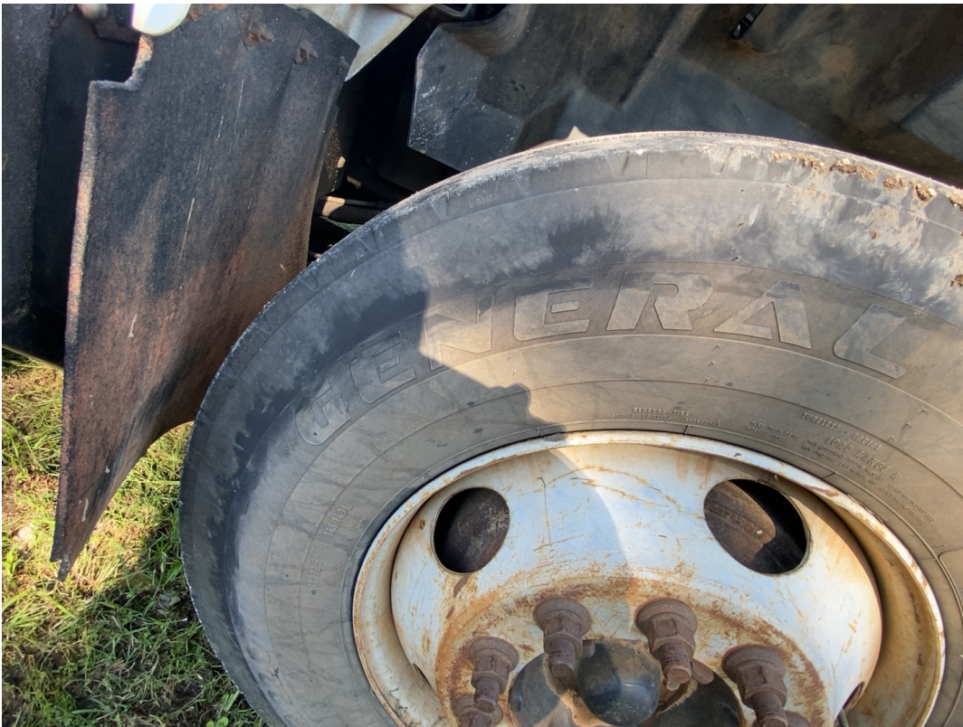
Right Steer Tire Brand / 05-14-2024