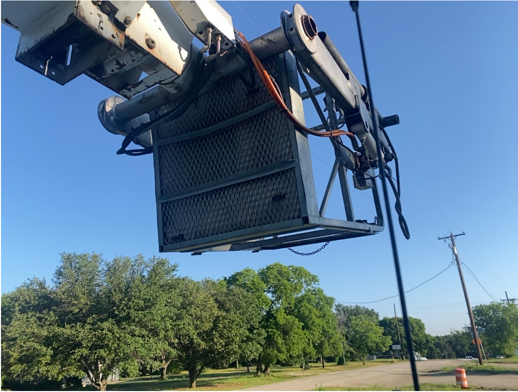
Attachments / 05-15-2024