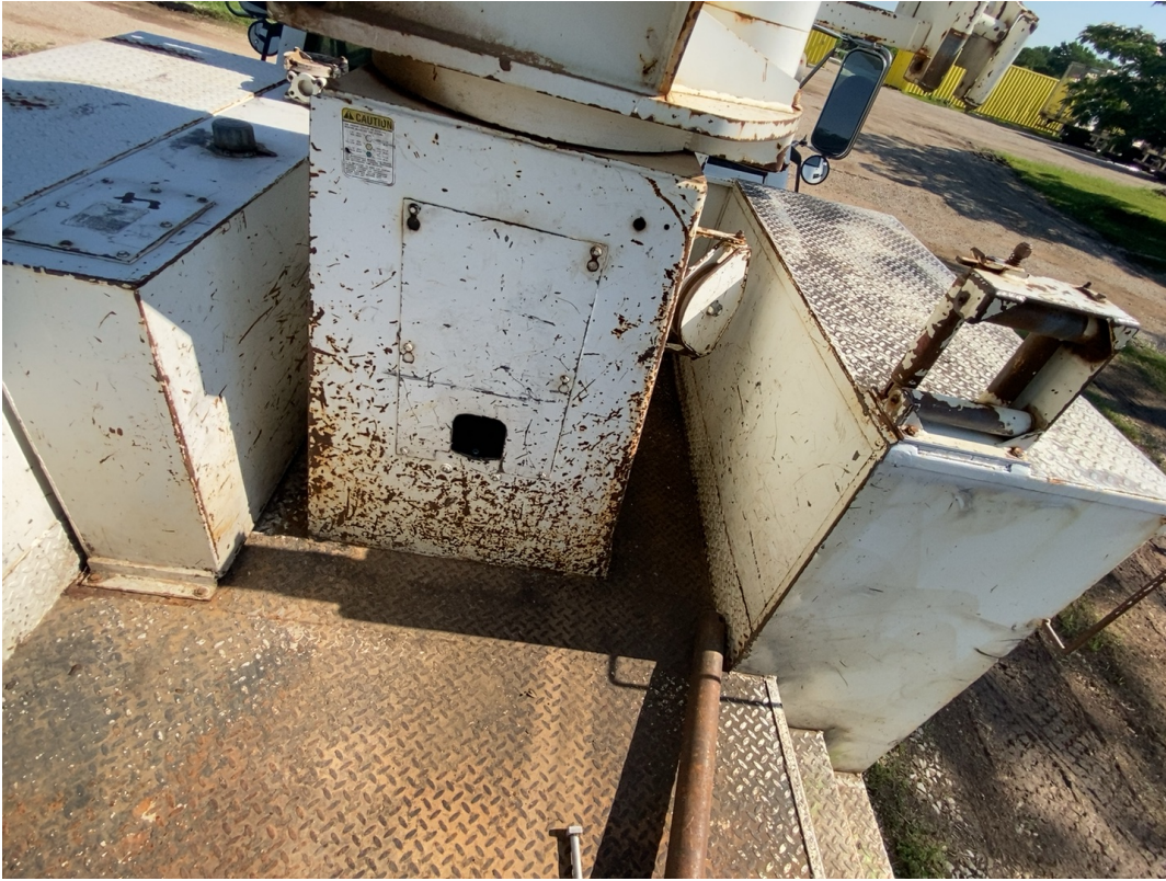
Floorboard / 05-14-2024