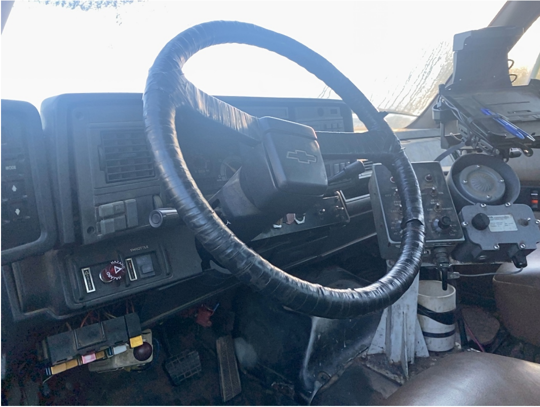
Steering Wheel / 05-15-2024