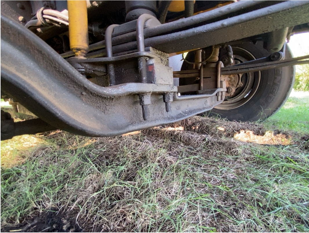
Axles / Suspension / 05-14-2024