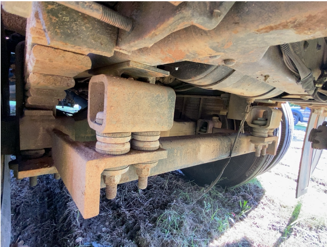
Suspensions / Axles / 05-14-2024