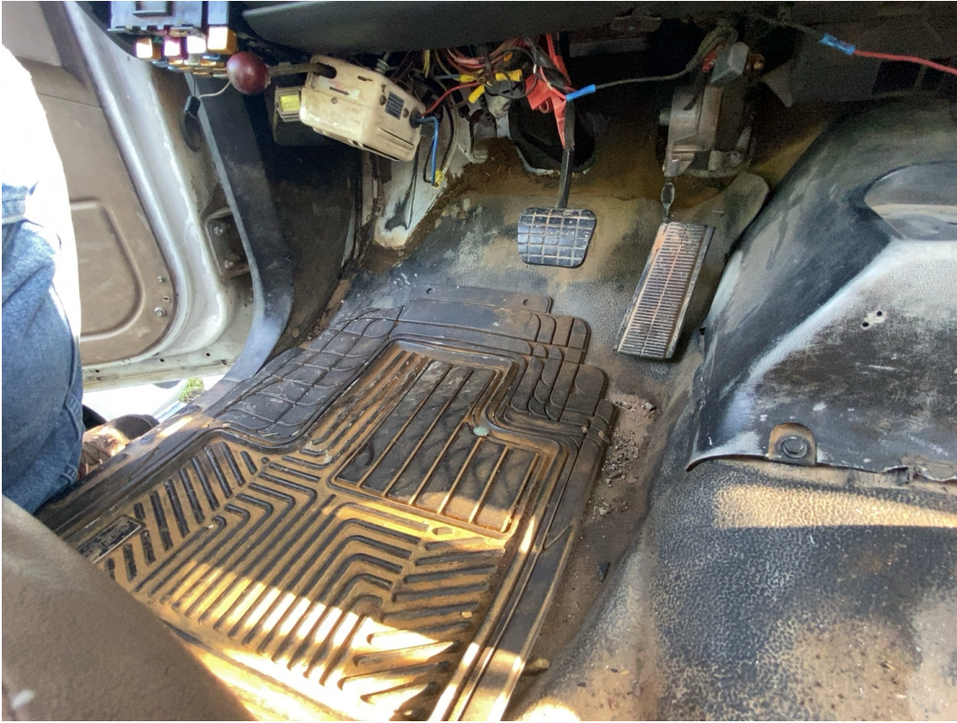
Pedals / 05-14-2024