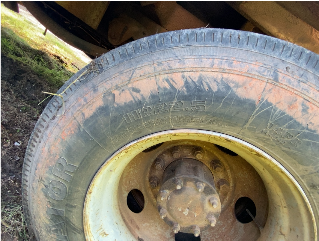
Left Outer Drive Tire Size / 05-14-2024