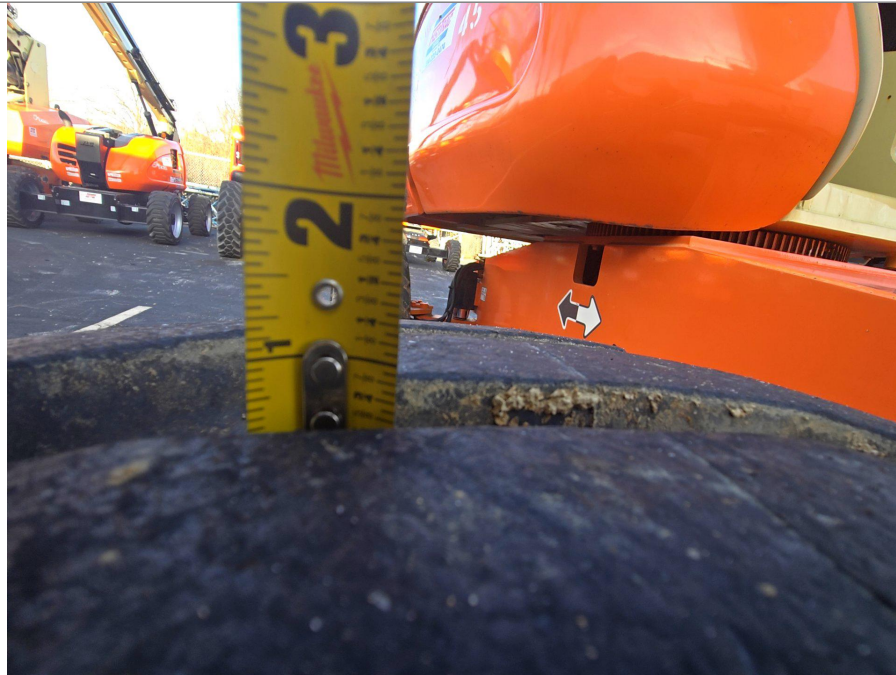
Rear Left Tire Tread Depth Measurement

Aspen is committed to providing helpful inspection reports to you. Aspen does not provide a warranty as to the information in the report. Furthermore, because Aspen does not at any time possess the property inspected, Aspen does warrant that the property inspected has not changed in a manner that would materially affect the inspection report.