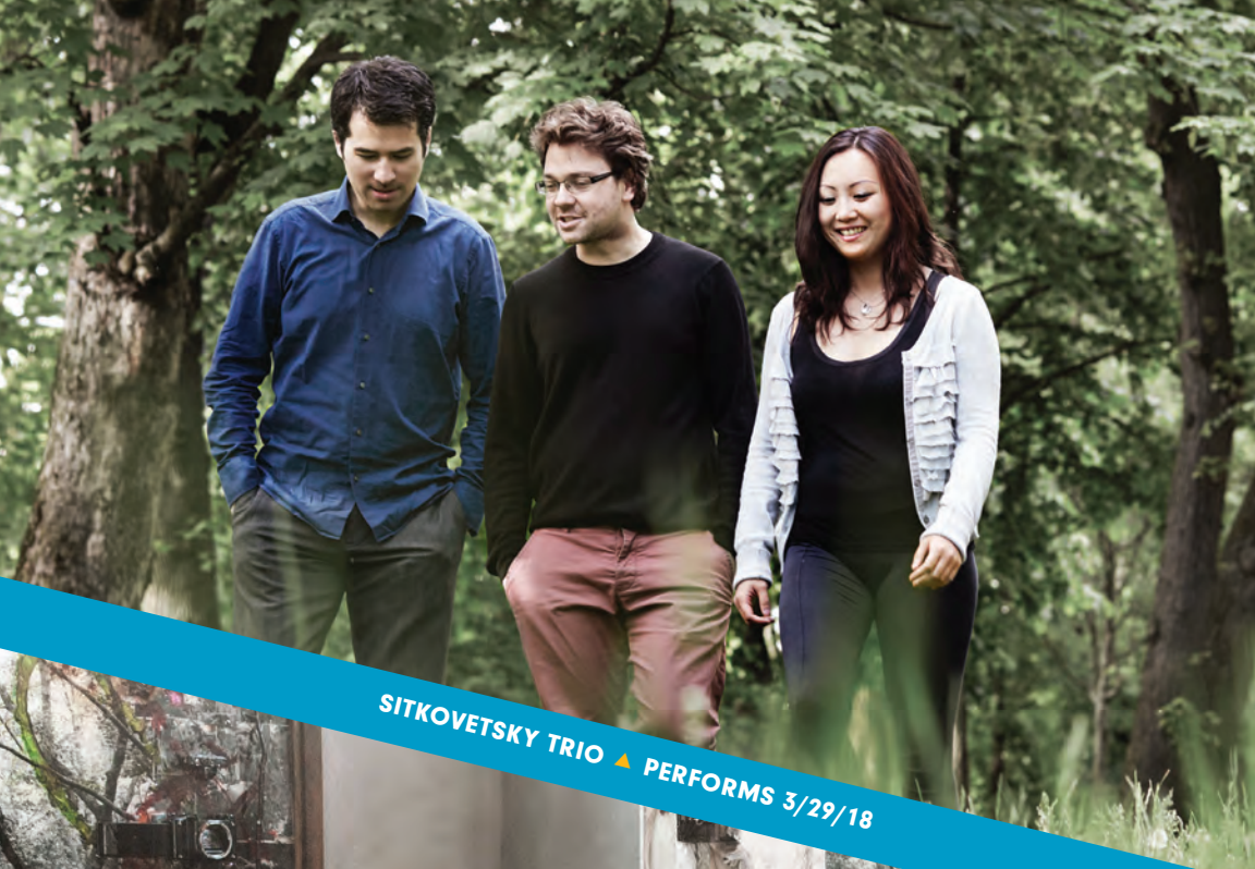
SITKOVETSKY TRIO ▲ PERFORMS 3/29/18