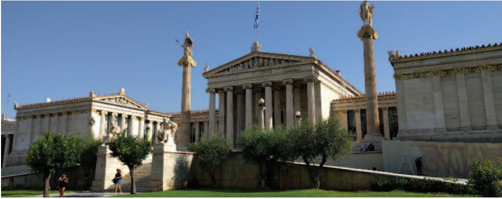
The Academy of Athens