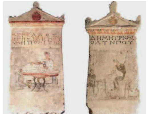
Stelae from ancient Dimitrias, Archaeological Museum of Volos

Leave the hotel in the morning and drive to Delphi, the shrine of Apollo and the seat of his