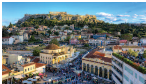
View of Monastiraki square and Acropolis Hill

Arrive in Athens and transfer to the elegant Hotel Grande Bretagne, located on Constitution Square, the center of the city. In the evening enjoy a “welcome” cocktail reception and dinner at the hotel and meet the CMS accompanying artists. (D)