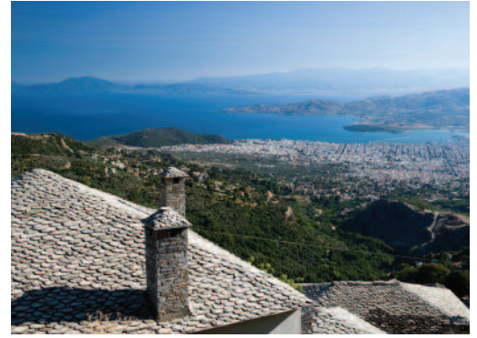
View of Volos from Pelion