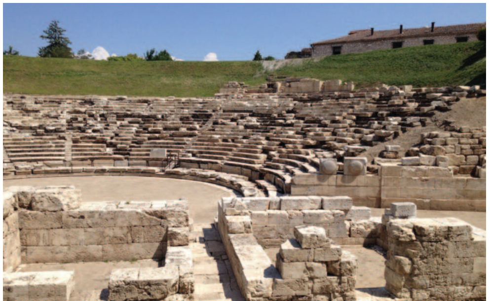
Ancient Theater of Larissa