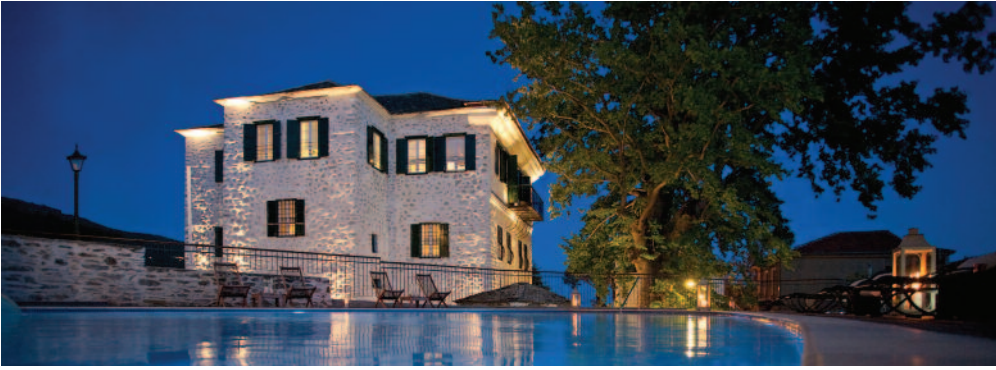
The lovely boutique Hotel Despotiko