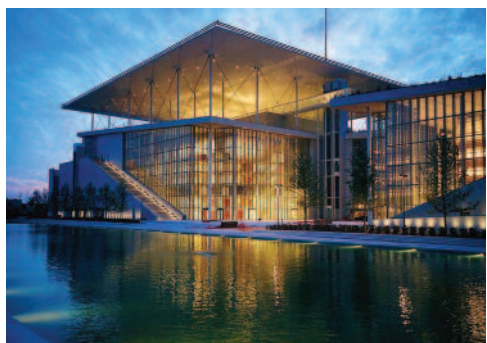
Stavros Niarchos Foundation Cultural Center

One of the world’s most venerable cities, Athens is the capital of Greece and the oldest city in Europe. Its ancient monuments attest to its glorious past. This is the birthplace of democracy and many other ideas, concepts and institutions that form the integral part of the Western tradition. In the morning, explore the Acropolis and its celebrated monuments, including the incomparable Parthenon and other temples built in the 5th century BC. Also, visit the Acropolis Museum, which houses an outstanding collection of sculptures and other artifacts. Alternatively, take an excursion to Eleusis, home of the great Sanctuary of Demeter, and site of the Eleusinian Mysteries, and the 11th-century Daphni Monastery, which is adorned with some