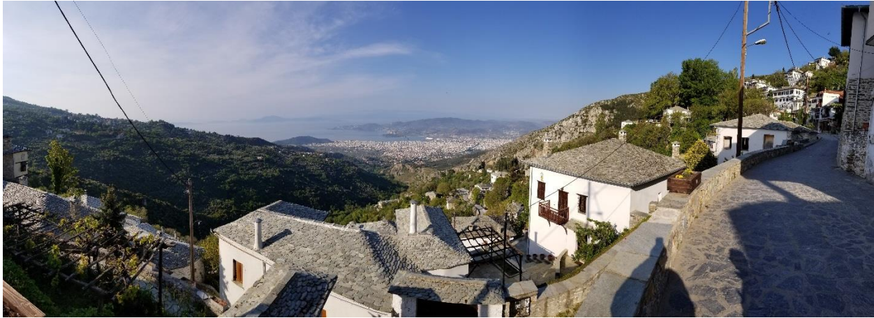
Pelion

The production is made possible in part through a generous exclusive grant from the Stavros Niarchos Foundation and the generosity and expert technical assistance provided by Greek public broadcaster Ellinikí Radiofonía Tileórasi (ERT). Broadcast is planned on PBS and Greek public television. Additional broadcast details will be released in the coming months.