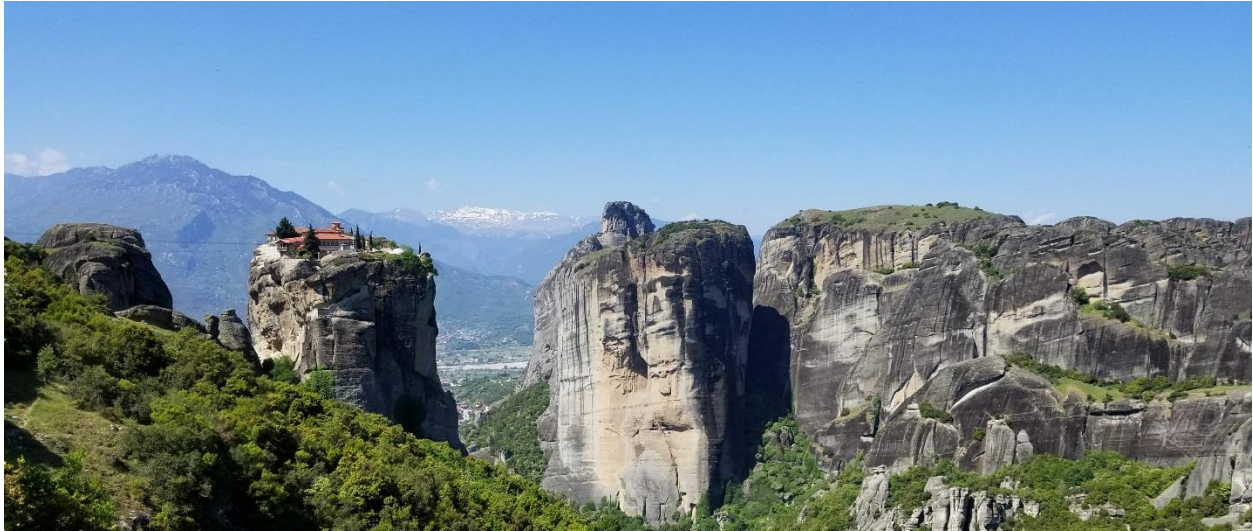
Meteora Monasteries