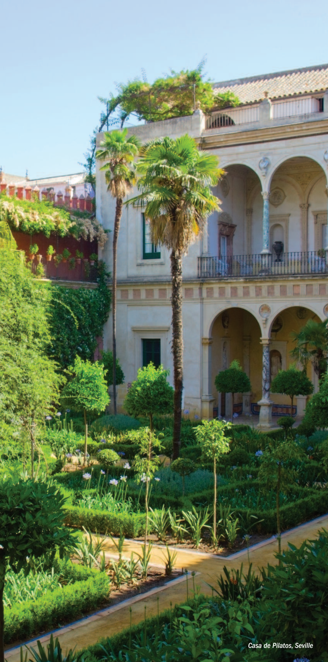
Casa de Pilatos, Seville