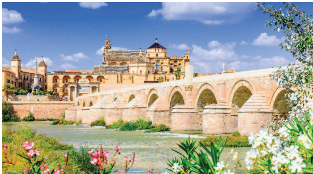
The Roman Bridge spanning the Guadalquivir River, Seville