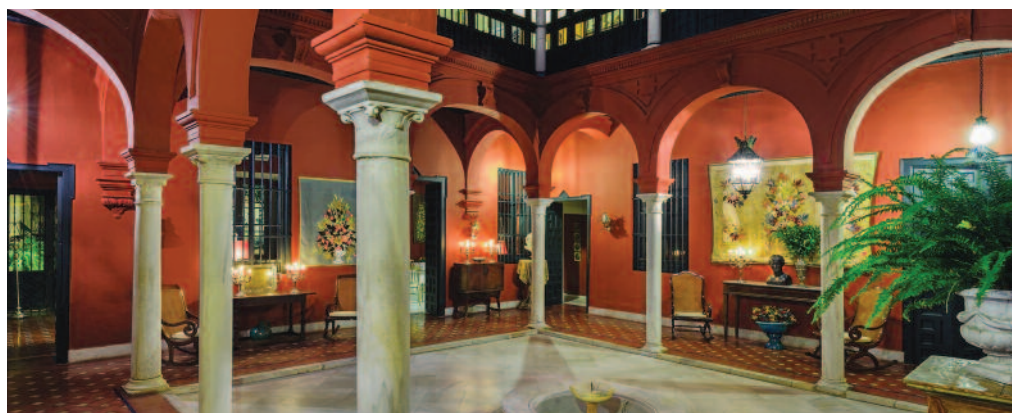
Seville's privately-owned Casa Palacio Bailén, site of our opening concert