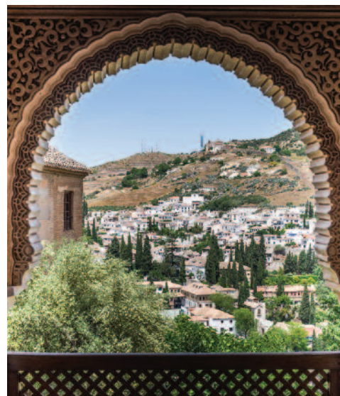
View from the Alhambra, Granada