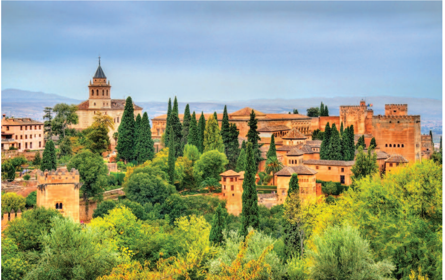
Panorama of the Alhambra, a palace and fortress complex in Granada