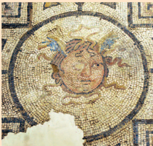
Cabeza de Medusa, Roman mosaic, Archaeological Museum, Córdoba

NOT INCLUDED: Airfare; passport fees; trip cancellation and luggage insurance; meals, soft drinks and alcoholic beverages other than specified in the itinerary; personal expenses such as laundry, telephone calls, faxes and e-mail service; any items not mentioned in the Program Inclusions.