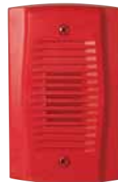
MHR UL S4011