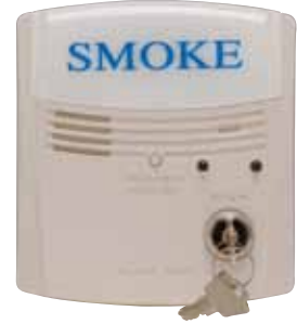
RTS2-AOS UL S2522