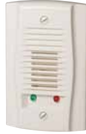
APA151 UL S4011