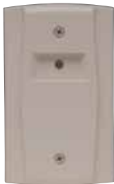
RA100Z UL S2522