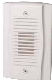
MHW UL S4011