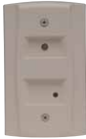
RTS151 UL S4011

System Sensor provides system flexibility with a variety of accessories, including two remote test stations and several different means of visible and audible system annunciation. As with our duct smoke detectors, all duct smoke detector accessories are UL listed.