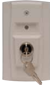
RTS151KEY UL S2522