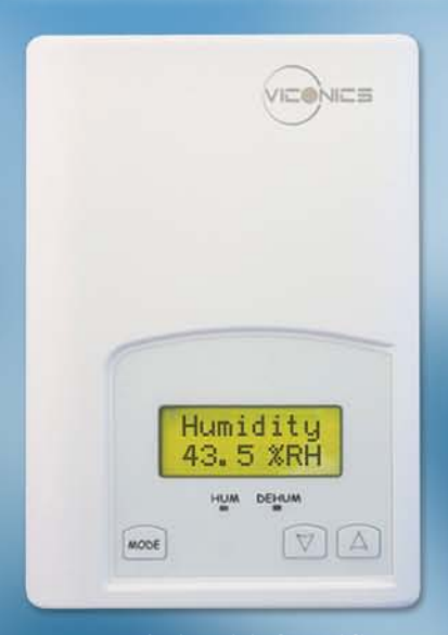
VH7200 Series Digital Humidistat