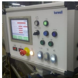
Brand new control interface cabinet with large 8" colour TFT touch-screen interface. Includes push buttons and control label.