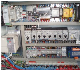
Newly wired cabinet complete with new circuit breakers, contactors, PLC, cutter inverter, safety relay and motor looms.