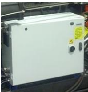
Includes new and compact electrical cabinet housing.