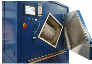
The Spin Trim can be used in conjunction with the Barwell Freeze Trim cryogenic deflashing machine.

The benefit of having a two-stage process is that it reduces the time taken during cryogenic deflashing, including the amount of nitrogen used, which reduces operational costs. It also means that a higher quality part is produced as the cryogenic and media blasting process can concentrate on polishing and fine trimming the products.