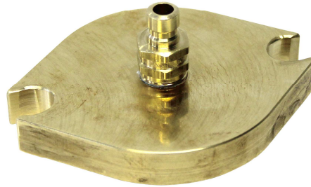
201399 EGR Manifold