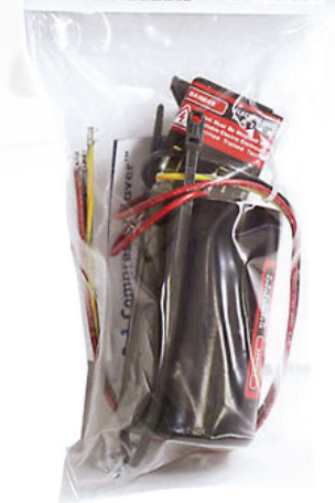
CSRU3 For 4 to 5 Ton units