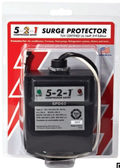
SPD60 Rated up to 60,000 amps

*Based on maximum energy dissipation (Joule) rating