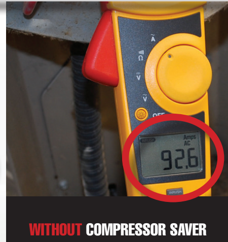
WITHOUT COMPRESSOR SAVER