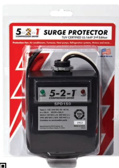
SPD150 Rated up to 100,000 amps