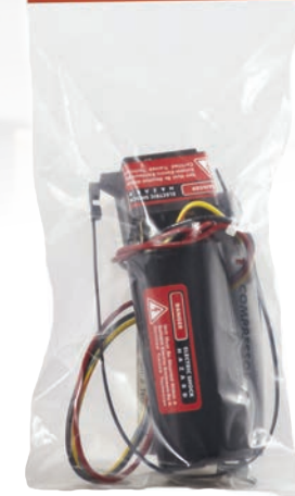
CSRU2 For 3½ to 5 Ton units