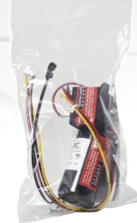
CSRU1 For 1 to 3 Ton units