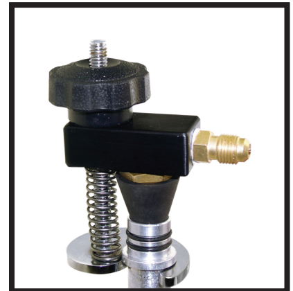
#6 Universal couplers