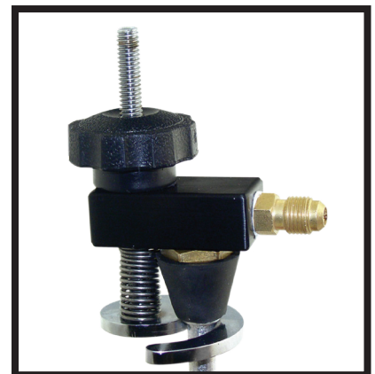
#12 Universal couplers