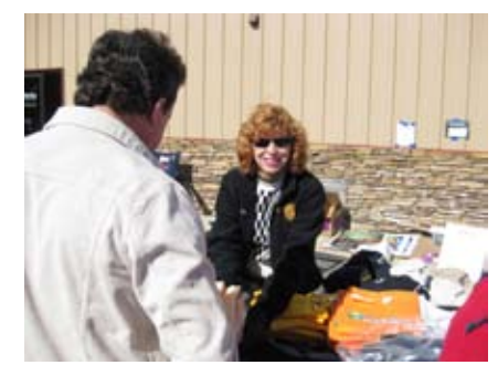
February 21st Swap Meet