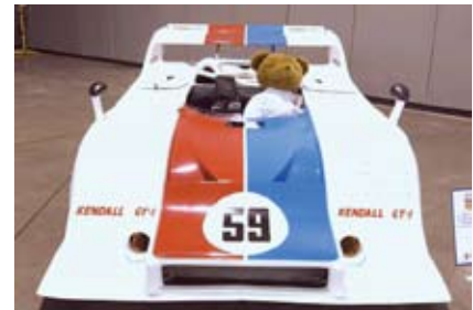
40 Years of Porsche 917! page 17