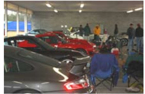
Photos from the Feb DE and the Jan Mid-Winter Track Seminar