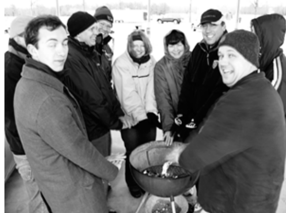
Gathered around the grill to keep warm!