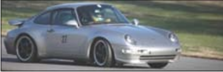
A Busy Month ... and it's just March!

If you recall last month I was looking forward to our first Driver's Ed of the 2009 Season. And while I had a great time hanging out with everyone at CMP, the weather was wet, cold and basically pretty miserable all weekend. But being the hearty bunch of gearheads that we are we weren't going to let a little bad weather put a damper on the weekend.