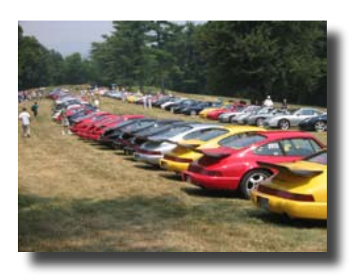
964 RS Americas on display at Parade Hershey