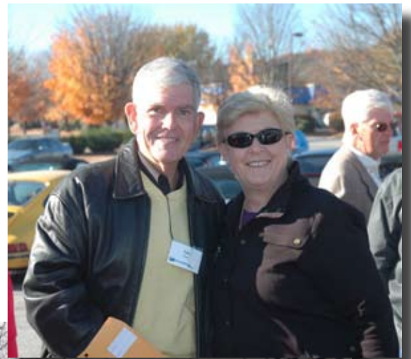
Fall Tour 2009