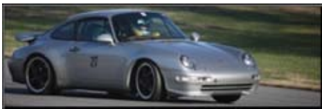
The Times They Are A-Changin'---

This past weekend I went to the North American International Auto Show (NAIAS) aka the Detroit Auto Show. This has been a ritual for me for about 10 years or so. I usually catch an 8AM flight, take a cab to the Cobo Center, knock around for about 2 hours, grab lunch, knock around for another couple of hours, take a cab back to the airport then get home usually before 7PM.