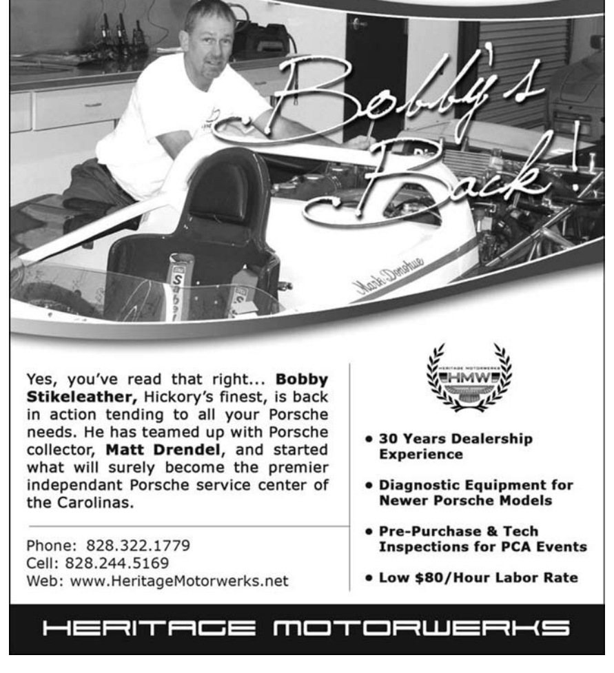
April 2010 - Page 22

Boxsters/Caymans will be allowed additional time to make their engine bays available for inspection since this involves removal of the engine cover. Owner's can choose to not display their engine but will be assessed penalty points assigned to the engine area. We will not have the tools available for this task so you must provide your own tools and expertise. Practice prior to the day of the event and plan of having a friend or fellow entrant that is knowledgeable of the task to assist. Judges will not assist unless requested to do so prior to the event and agree to the request.