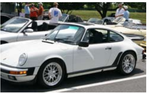
Porsches at the July Salsarita's Show & Shine