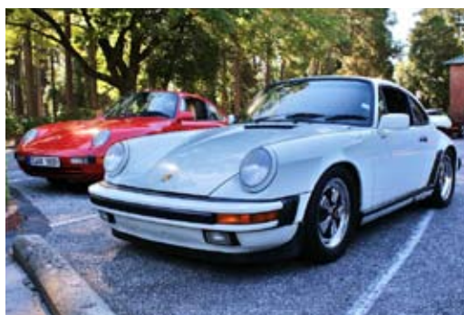
Triangle drivers at lunch in historic Pittsboro after meeting up with the Sandhills Region.