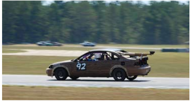
As the LeMons web site says, “Where Halloween meets gasoline.”