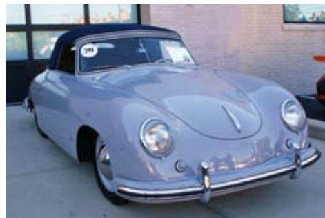
Just a few of the Porsches that make up the Ingram Collection.

By the time this update is published, we will have attended the Open House and Tech Session at Digital Chassis in Durham – October 30th, 9am-11am. I'll provide a full update in the next issue of Tobacco Roads.