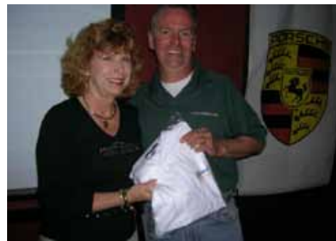
Photos from Triad's April monthly meeting.