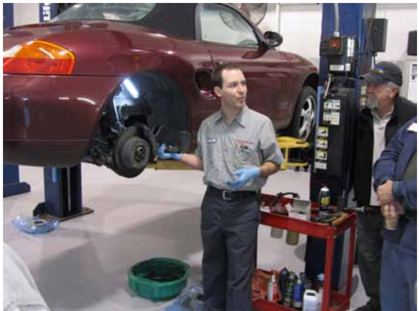
Brakes were the subject of the Mountain Area's April tech session.