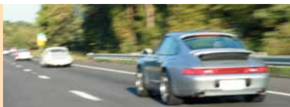
The Largest Annual Carolinas Region PCA Gathering – Multi-event Weekend