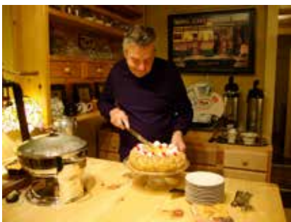
Cutting some cake at the Porsche Drive and Dine Dinner Gable Haus event