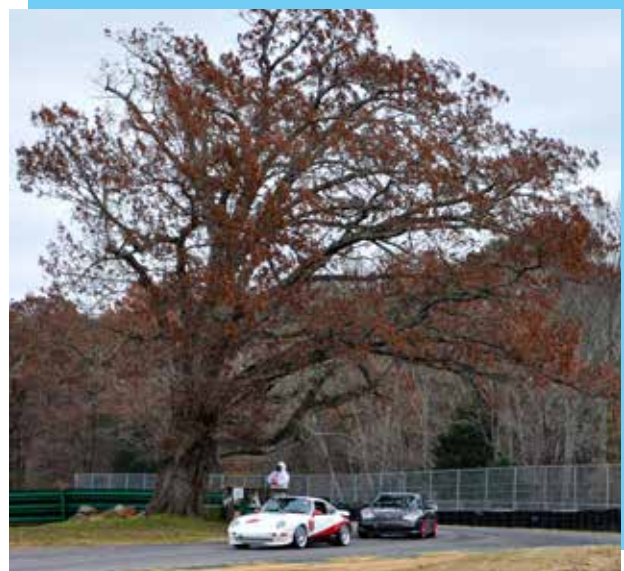
Around the Oak Tree, then give it the beans!

As a first time participant to VIR most of the words I had heard about it were at least confirmed. The venue's late fall beauty, rolling elevation and pucker inducing blind apexes were all displayed at this edition of the season finale. The incredible straights, well run organization and good company made this an good end to the season.