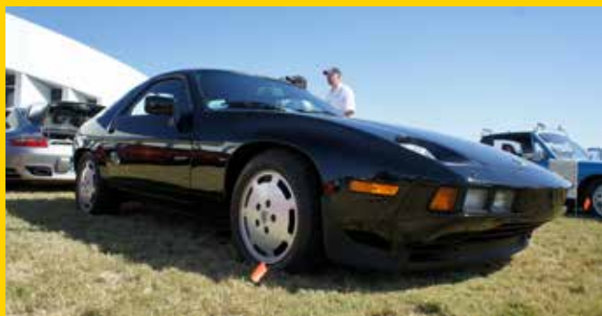
Porsche 928 Collectors Choice Award