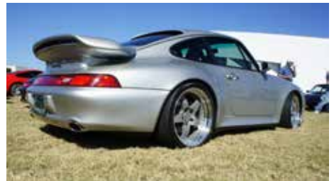
Porsche Carrera S