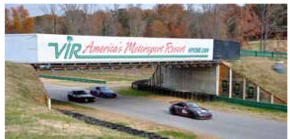
Under the bridge

November 16th-18th was the 3-day season DE finale at VIR outside Danville, Virginia. Cold temperatures and a brisk wind kept everyone on their toes. What little motivation the mercury had for rising, the sun tried to compensate for it Saturday afternoon, making the morning frost disappear.