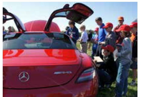
Youth Judge AMG