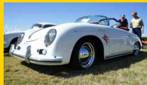
Porsche Peoples Choice