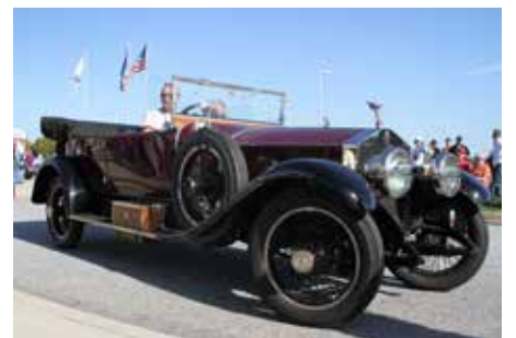
1914 Rolls: Brass Era Rolls Royce