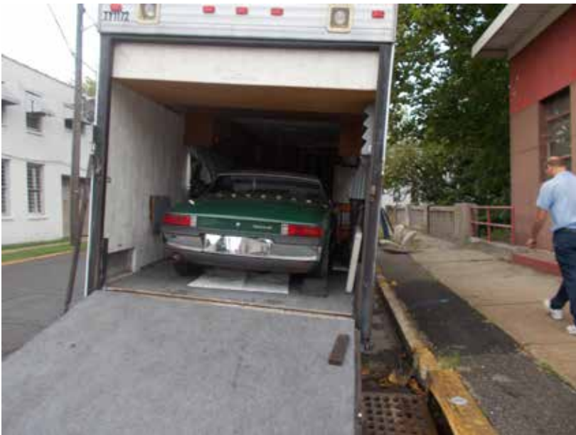
The 914 coming off the truck getting ready to have the resident squirrels evicted.