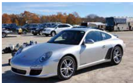
Look for this car in upcoming Ironman film