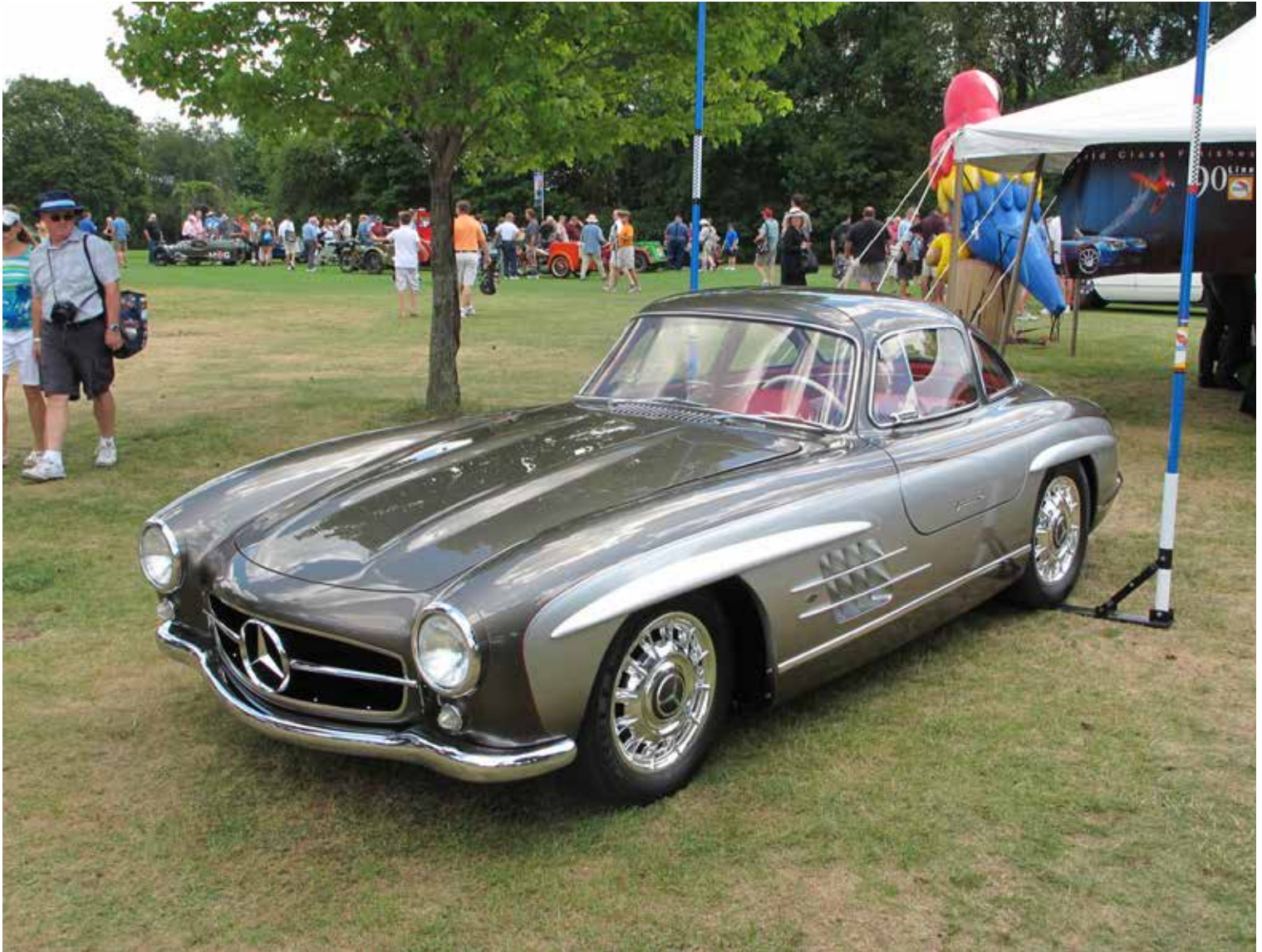
Chip Foose 300 SL