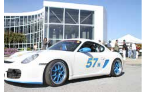
Porsche Cayman Exhibit

The morning started off with a chill in the air but by late morning the temperatures were in the low 70s. By 10:30 in the