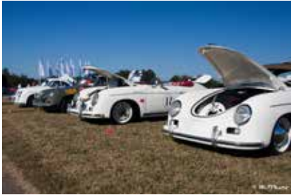
Porsche 356 Line Up, say 'ahhhh'