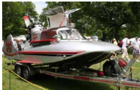
BASF Tupolev 007: Cosmonaut Recovery