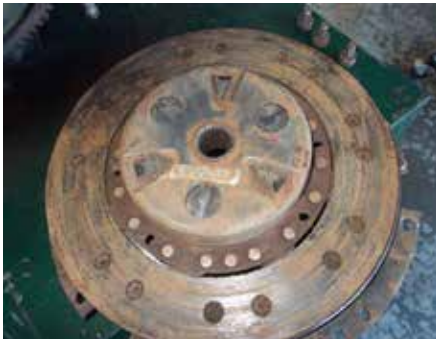
Original rubber center clutch with factory part sticker still on it.