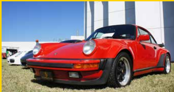
Porsche Old Timer Award