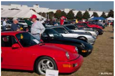
Porsches on Show Field