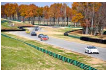
Foot on the gas up through turns 4-6