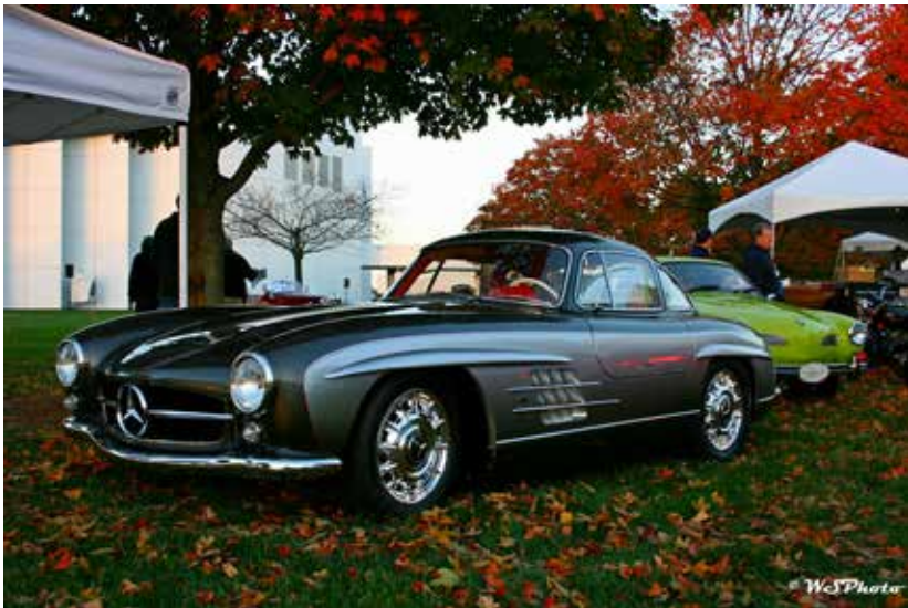
Chip Foose Prepared 300 SL

morning there were 415 of Europe's finest, representing 30 marques in 54 classes spread out across the lawns surrounding the BMW Zentrum museum and the entrance to the BMW Manufacturing plant. The variety of vehicles present had something for everyone, from a 1914 Brass Era Rolls Royce up to many fine examples of 2012 machinery. One of the major sponsors, BASF,