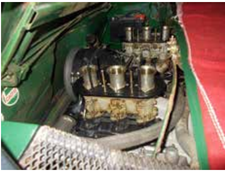
The 6 cylinder engine bay.