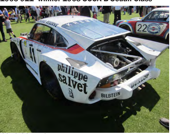
1979 935 K-3

dining and some great blues music and the oldest bar in Florida; the Palace Saloon, which has been open since 1903!