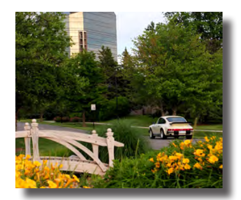
For More Information & Registration - Visit Parade 2013. Pca.org