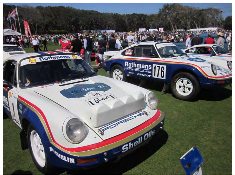
1984 Factory Rally Cars, as they were when last raced

than a production 911, in that the doors and side glass will not fit a production 911-truly one of a kind!