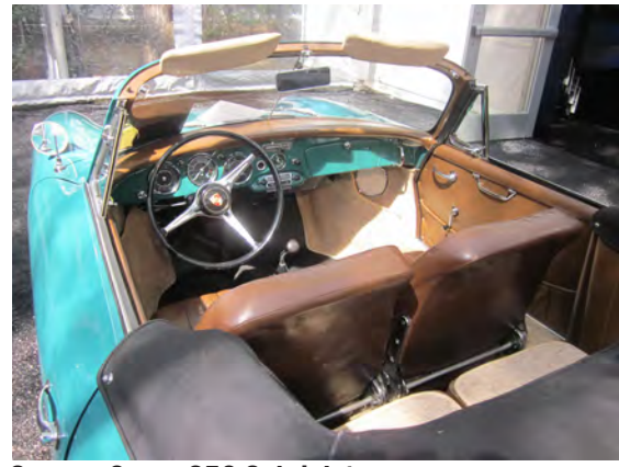
Smyrna Green 356 Cabriolet