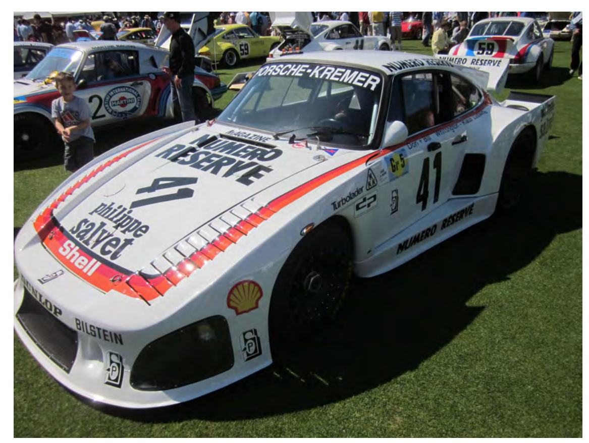
1979 935 K-3, winner 1979 LeMans, and some say, the most important 911 of all