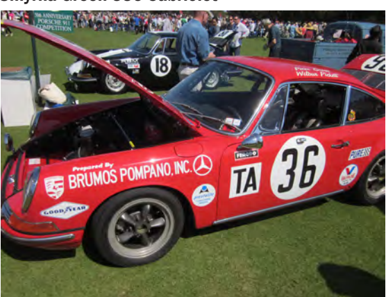
1965 911- winner 1968 SCCA B Sedan Class