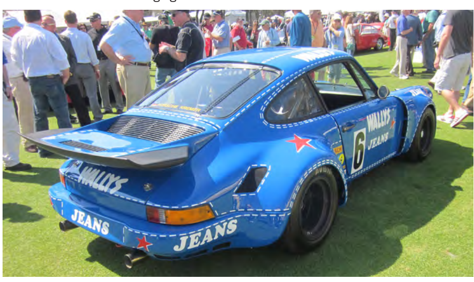
1974 911 RSR 3.0 Liter

encouraging success led to the more extreme 959 Paris - Dakar