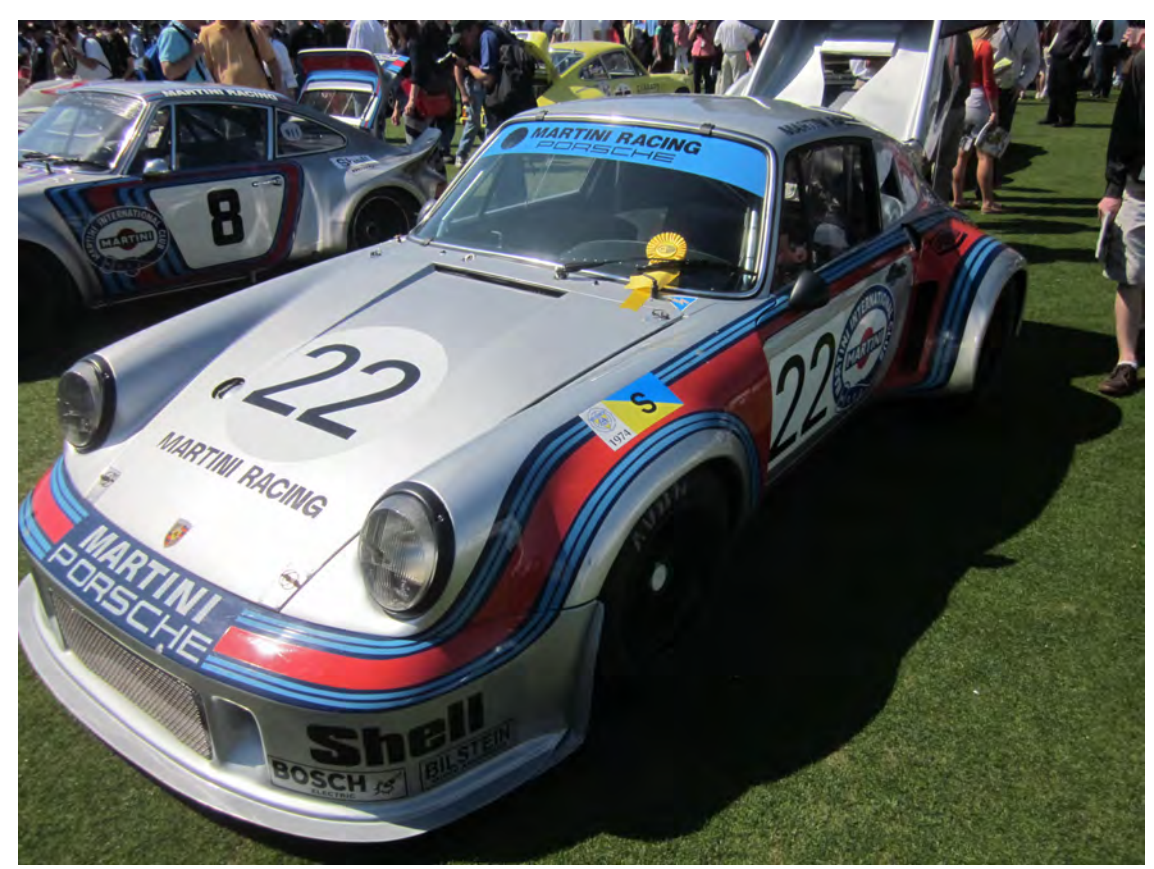
1974 911 RSR 2.14 Turbo R13