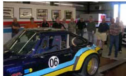
RWR Tech Session