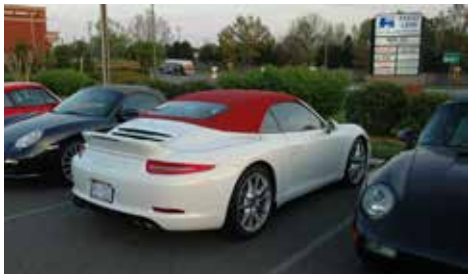
Manager's Choice Winner, 991