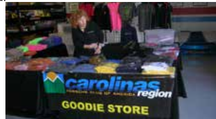
Goodie Store on the Scene