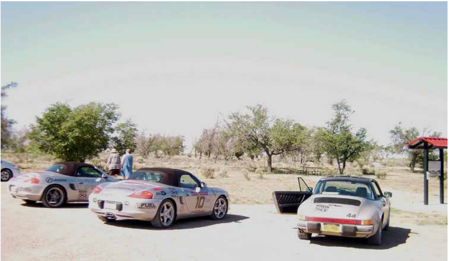
Three of the Porsches at the site of the Japanese internment camp