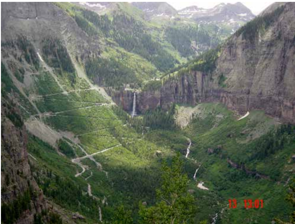
Looking down from Imogene Pass toward Telluride