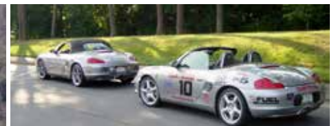
All dressed up & somewhere to go