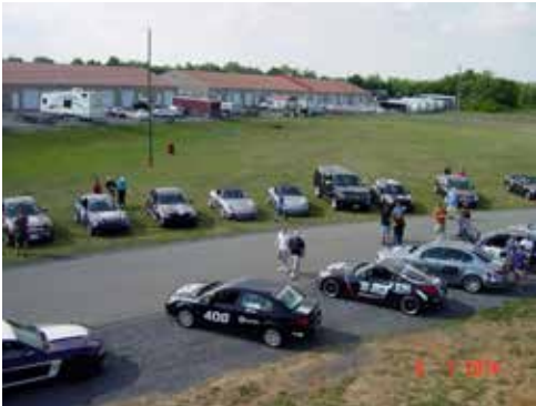
Waiting to do laps at Summit Point Raceway