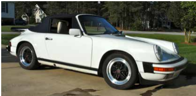
My fourth and current 911, a 1988 Carrera Cabriolet, all original paint.

No member story this month. So I'm running a photo of another one of mine. I would love to run your story. Otherwise I may have to run photos of BMWs!