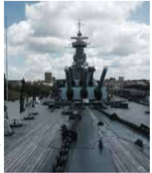
Nine 16-inch guns, six forward and three aft, fired projectiles about 4 feet in length and utilized up to six bags of gunpowder per shot.

The idea that funding racing by a manufacturer is in part justified because racing innovations find their way into production automobiles was true way back in 1911 if not before. Ferry Porsche's philosophy was "we race in order to build the best sports cars for the road." The winning car in the