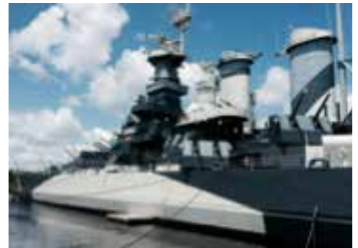
The North Carolina is 729 feet long and has a loaded displacement of 44,800 tons.