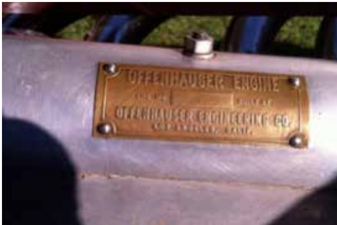
The Offy