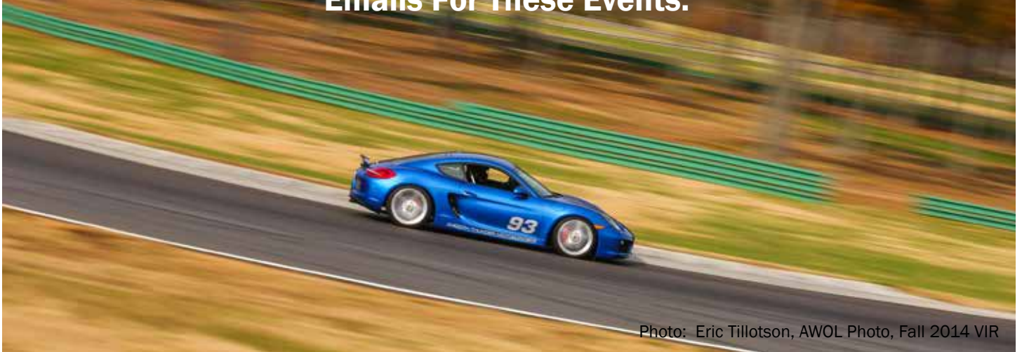
Fall 2014 VIR

Early 2015 Will Be The Planning Time For 2015'S Events. Check With Your Area Director, Facebook, Future Tobacco Roads, And Emails For These Events.