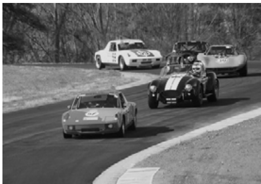
Builder of the finest Air-Cooled Engines.