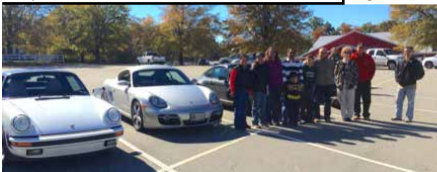
Some of the participants in the Old Homestead Rally—humans and autos.

Our January meeting in 2015 will be a planning session for the activities in the new year. A date and time will be announced shortly.