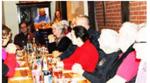
Some of the crowd At All Souls Pizza