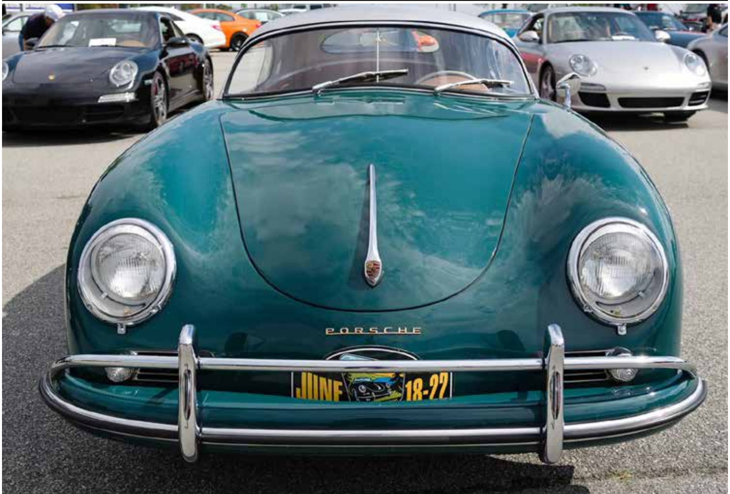
Octoberfest 2014