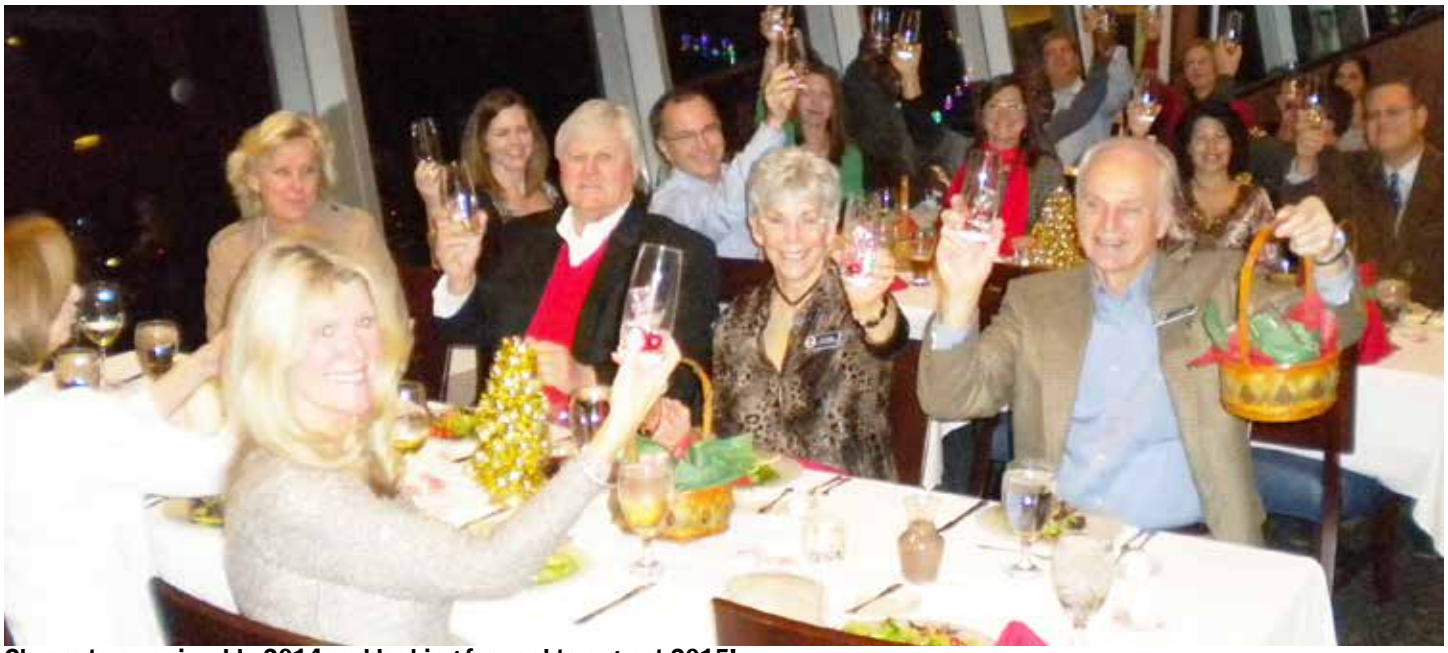
Cheers to an enjoyable 2014 and looking forward to a great 2015!