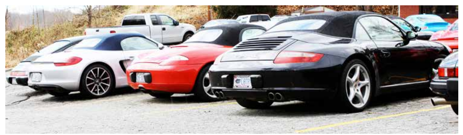
Porsches taking over the parking lot!