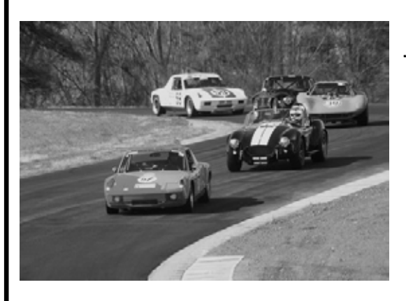
Builder of the finest Air-Cooled Engines.