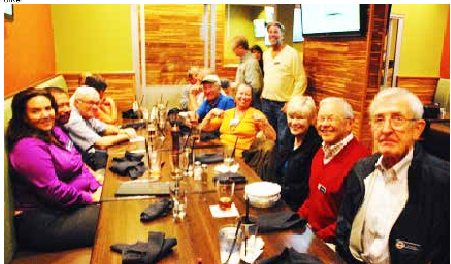
Some of the large crowd at Tobacco Road Sports Café in Chapel Hill for our October dinner meeting. And the November turnout was even larger.

To be kept current on Triangle Area events, consider joining our meetup group. http://www.meetup.com/Triangle-Area-Carolinas-Region-PCA/. If you're not getting my periodic emails about events, please send your email address to triangle-ad@carolinas-pca.com.