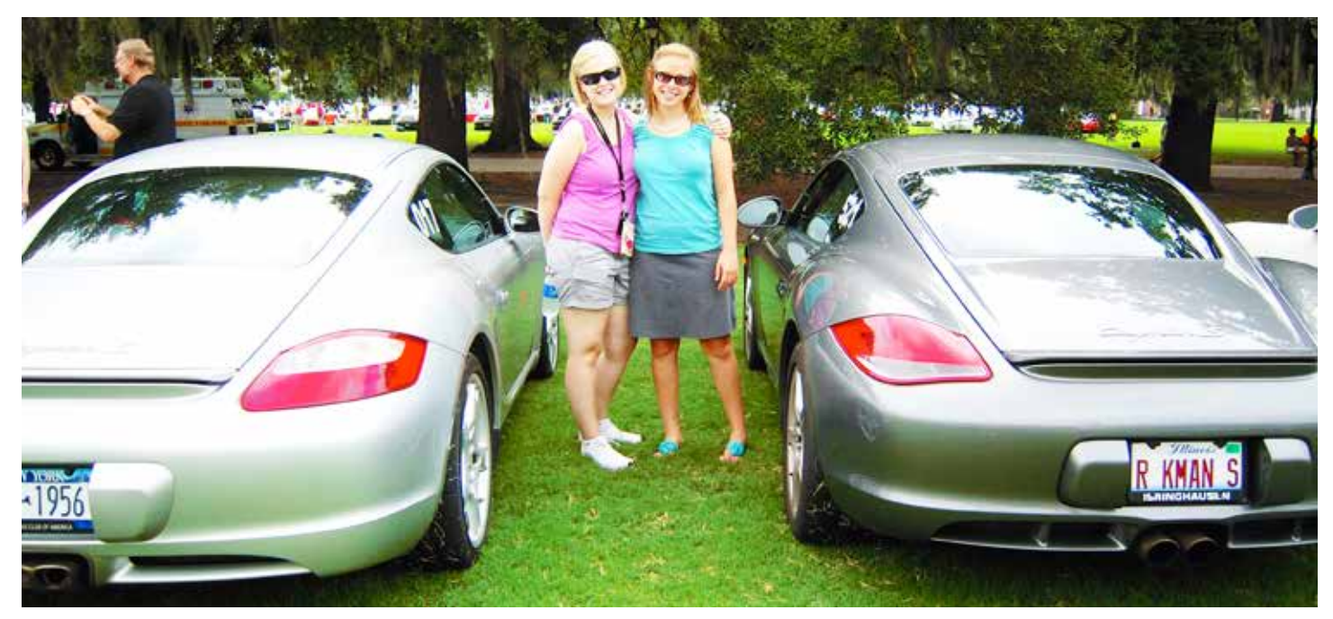
"do we have to go look at more cars?" We stayed till the very end, though. Both girls standing with the other workers at the volunteer party, it was sad to see the close of our first Parade.