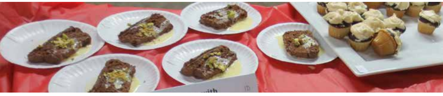
March 2015 - Page 15