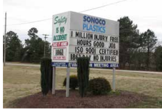
At Sonoco, safety is "Job One"

the progress that has been made in safety performance over the years. I still remember my first supervisor job and being told what my "budget" was for injured employees. Yup, back then it was fully expected that over the course of a year I would get someone hurt, maimed or possibly even killed. The mindset at the time was that it simply was an inherently dangerous process and therefore accidents were bound to happen. Over the years that mindset has changed. Our safety philosophy is now