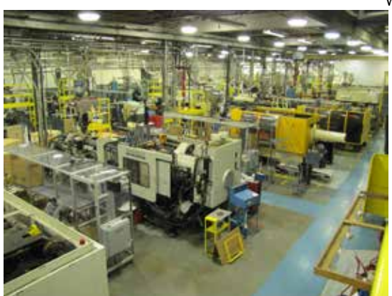
The production floor can be dangerous

one of "ALL injuries can be prevented". We've made great progress in our safety performance by focusing on several key areas designed to prevent injuries. 1. Engineering solutions. 2. Training. 3. Behavior modification.