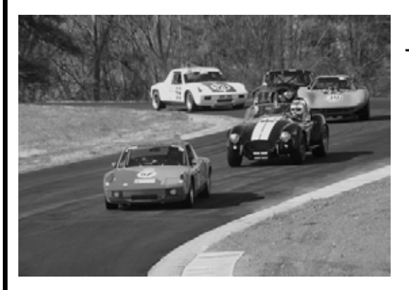
Builder of the finest Air-Cooled Engines.

Before Sommerfest, on April 18, Sandhills, Triad & Triangle Areas, and Porsche of Greensboro, are hosting the Tri-Area Shine & Show in the town of Seagrove. Not much town, but it the pottery capital of North Carolina and a neat area to visit. Please join us.