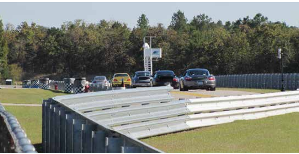
Applying Safety as "Job One' to the track

rules about convertibles and rollbars, and we've insisted that expanded passing be only for our red run group. While some of these decisions may take away the fun and excitement of our events for a handful of participants, I truly believe these are the