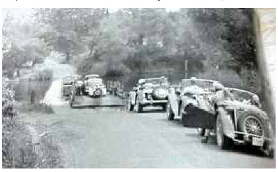
Communing with nature in the TC.

This flashback begins at a time before any Porsche motor vehicles had made it across the pond to the United States. My father's interest in automobiles might have been driven by the fact that in 1919 at the age of six months his parents drove