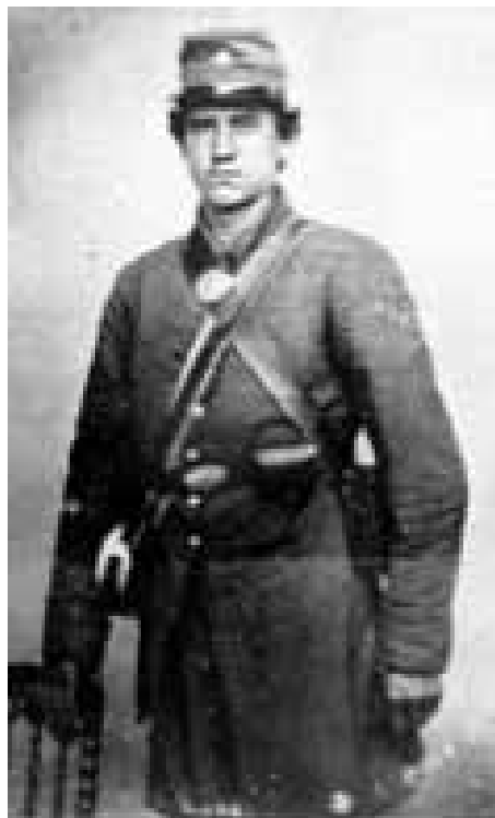
APRIL 2015 - Page 8

Our pop culture entry for this month: For twenty points, can you name the pictured Confederate soldier who was hanged in Iredell County, NC in 1868? Correct spelling counts.