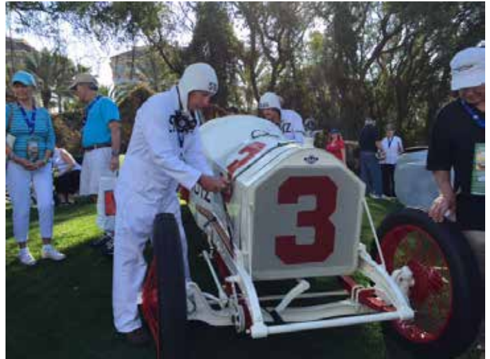
Images from a great Amelia Island Concours