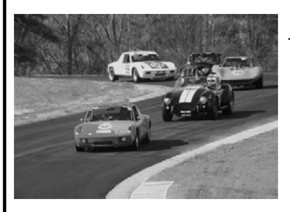
Builder of the finest Air-Cooled Engines.