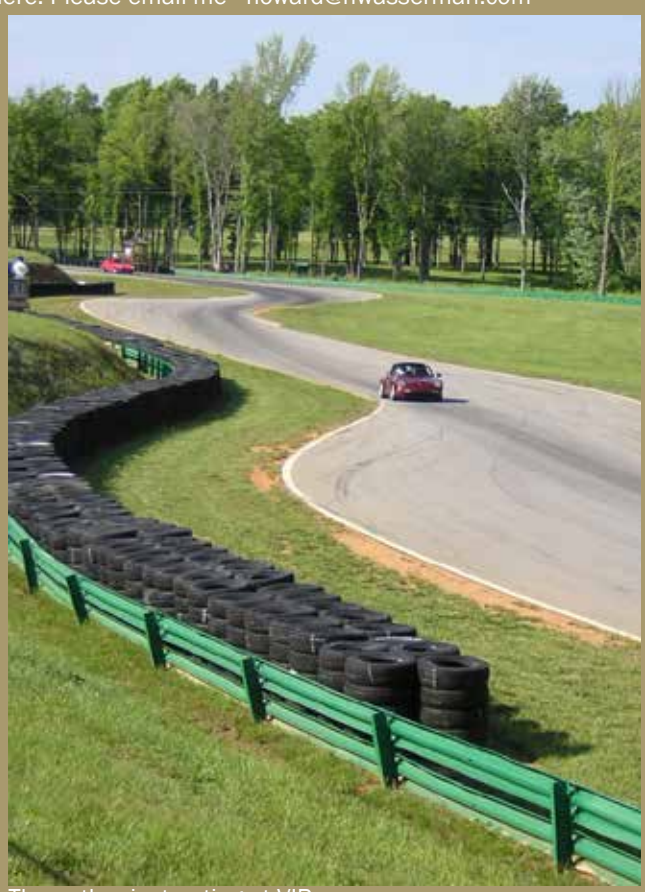
The author instructing at VIR

Are there not some ladies who have photos of their Porsches and interesting stories to tell involving them? I'd like to print those here. Please email me - howard@hwasserman.com