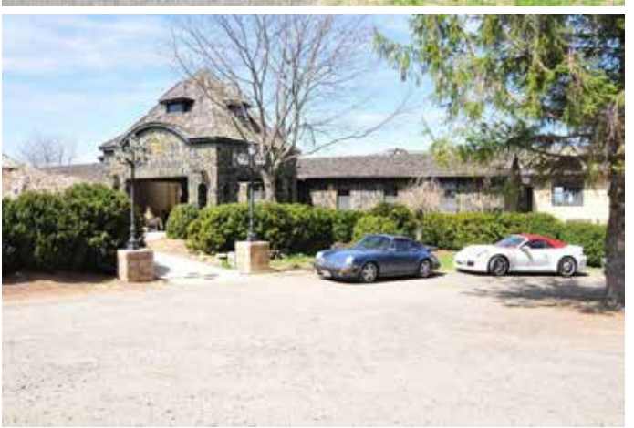
Three photos above: Chateau Morrisette caravan trip!