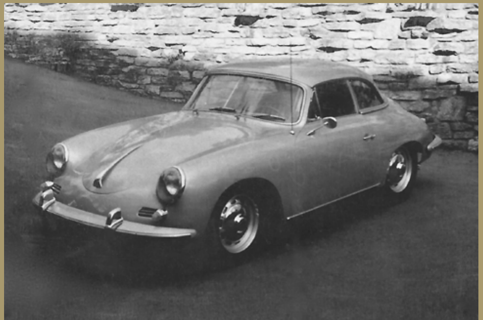
Start of 50 Years

This car almost spoiled my appetite and faith in Porsches! It had a well-known habit of “backfires” in the intake manifold. Recall this was a system wherein the fuel was injected into the manifold, not via individual injectors per cylinder. That created the opportunity for an “explosion” should a random spark occur and it would often happen if the car were not started carefully using the separate “throttle” on the dashboard. Said “explo-