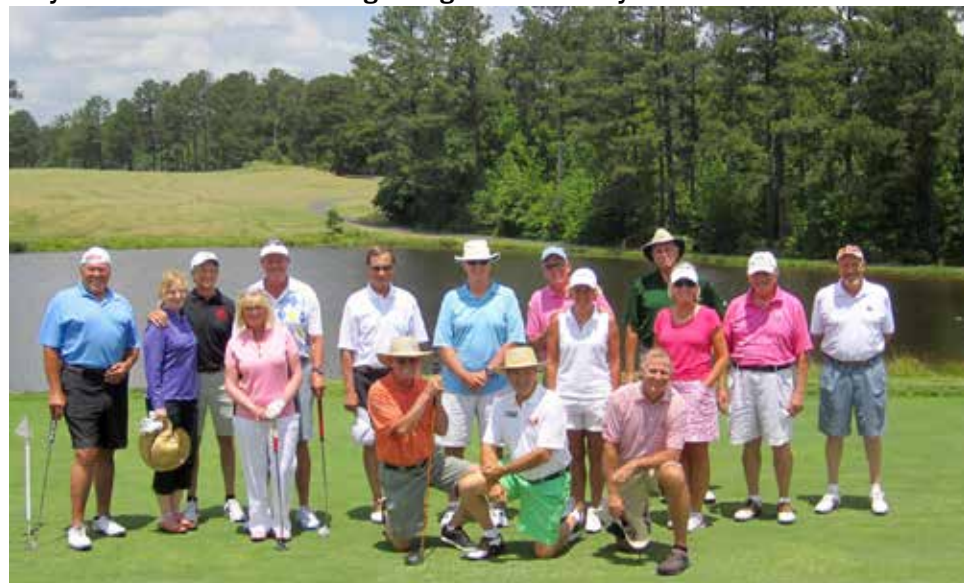
Golf tournament participants