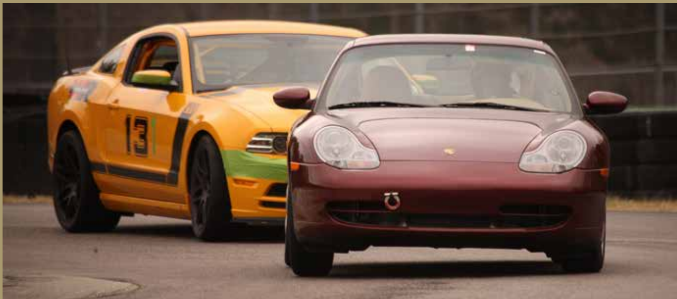
2'20 at VIR

I recently added a Carrera S Cabriolet (2009 997.2) to try more horsepower, top down motoring, PDK and Sport Chrono driving. The '09 is a beautiful car, the PDK is smarter than I am, the Sport Chrono and Sport/Sport Plus settings do amazing things and showcase the ten years of technology and racing knowledge and I like 89 more horsepower ... but I miss the left pedal. Thus I am selling the car and will run the 996 on road & track forever!