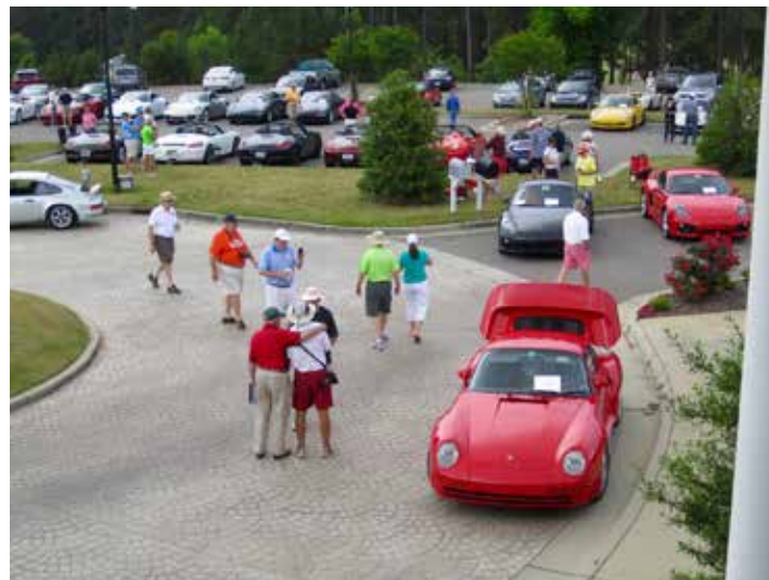
Ingram 959 display featured at concours

Most of the classes were very close in voting as people had a myriad of opinions as to their favorite. The same could be said for the overall People's Choice as there were 14 cars receiving votes.