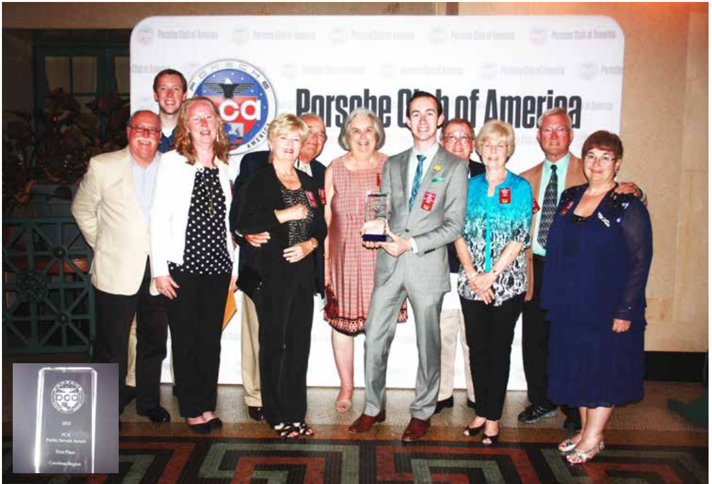
Carolinas Region receiving Public Service Award at Porsche Parade, award shown in inset. Read below for the programs from three different Areas.

Following is the write up I submitted to PCA in consideration for the National Public Service award. It is gratifying to see so much hard work and charity on the part of our members be justly recognized