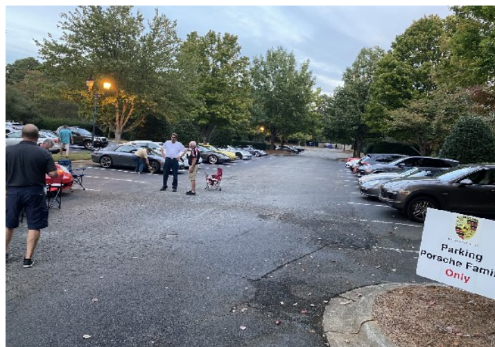
(above) Meeting in the Porsche Corral at PYC