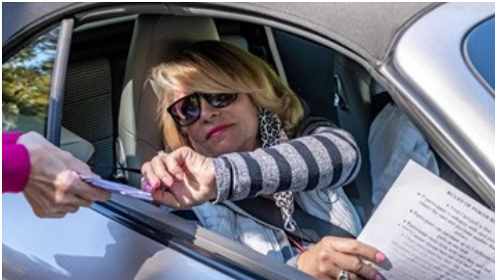
Pick a card

Due to restrictions imposed by COVID, the event was held in the open-air shelter located at Beth Eden Lutheran Church in Newton, NC. The day began early with registration and a light breakfast, compliments of our sponsor, Porsche of Hickory. Following a brief driver's meeting and explanation of instructions, cars were released on-by-one on their 70-mile quest to acquire the "best" Poker hand. For those who may be unfamiliar, a Poker Run is a drive wherein participants travel to designated checkpoints, drawing a playing card at each. The object is to enjoy the drive and to have the best poker hand at the end of the "run".