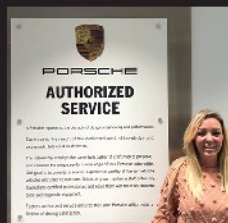
Porsche Service Advisor