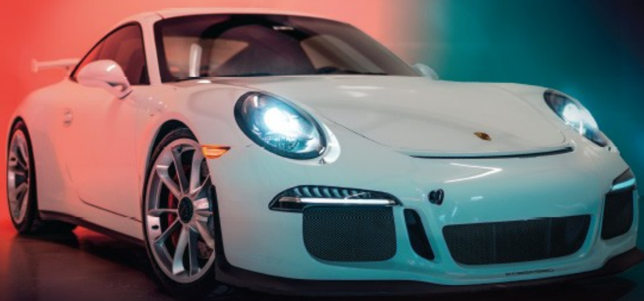
PORSCHE 911 GT3

BUILDING RELATIONSHIPS ONE CAR AT A TIME SERVICE | SALES | PERFORMANCE | DETAIL | TRANSPORT