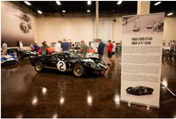
Ford GT 40

as well such as a gorgeous G model Carrera S, a 959, and the famous 917.