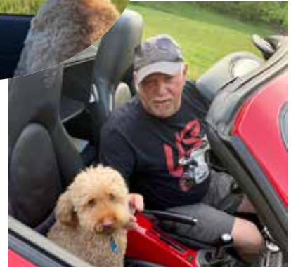
Here’s looking at ya

The story goes like this, I had a Cayman and my wife and I like to hike and so does Tug. But he got too big to sit in my wife’s lap. I put him on the engine cover once and that didn’t go over with him well. Found the 911 back seat worked well, so we traded the Cayman. He loves the cabriolet. The attached pics are from a solo trip and the pic of Tug and I was taken by another PCA member.