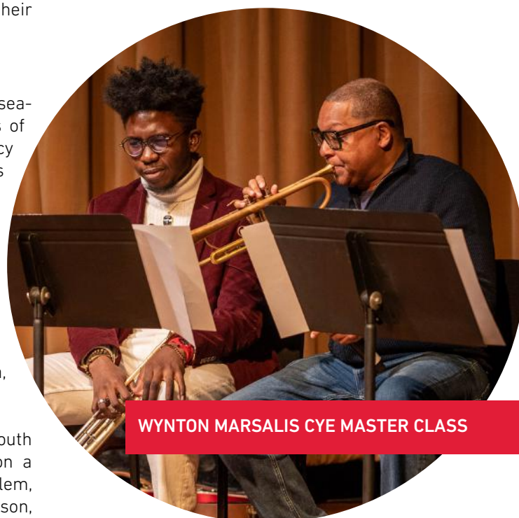
WYNTON MARSALIS CYE MASTER CLASS