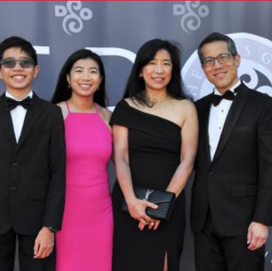
THE WU FAMILY