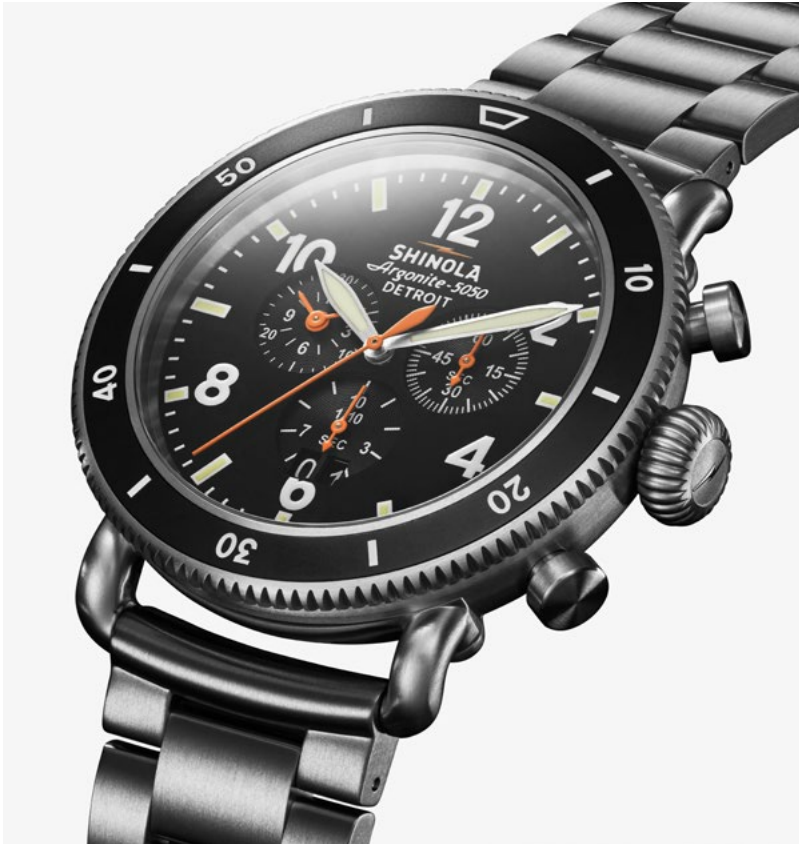
THE BLACK BLIZZARD 48MM Inspired by the Dust Bowl of the 1930s and the homesteaders who weathered the storm, The Black Blizzard titanium wristwatch is an emblem of the American spirit, a willingness and determination to overcome adversity. $1,500 ITEM: 10000118

The quartz analog movement that makes our flagship timepiece tick is made up of 40 delicate components and requires 16 steps to build. It’s called the Argonite 1069, and it’s the caliber—or tiny engine—that taught us how to be Shinola.