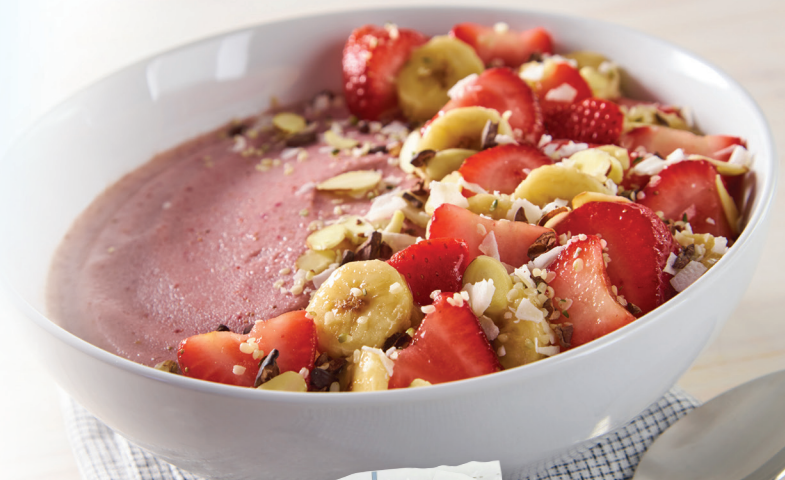
Strawberry Banana Smoothie Bowl made with DOLE® Chef-Ready Cuts Sliced Strawberries & DOLE Chef-Ready Cuts Sliced Bananas