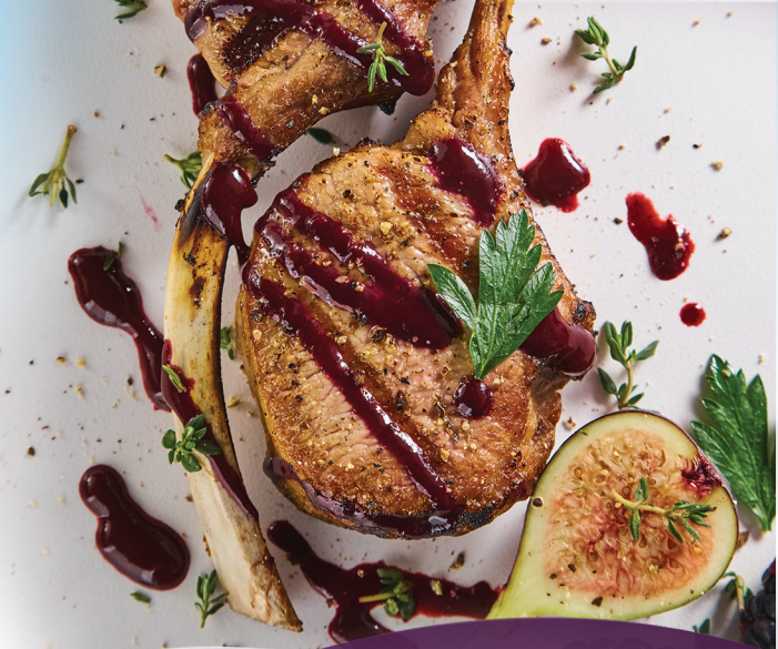
Blackberry Chipotle Purée made with DOLE® Chef-Ready Frozen Blackberry Purée