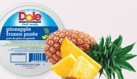
Pineapple Coming Soon!