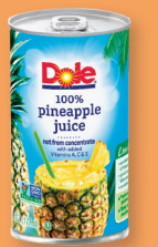
Pineapple Banana Punch made with DOLE® 100% Pineapple Juice