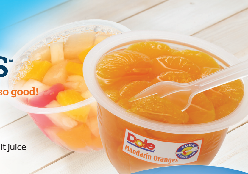
DOLE® Fruit provides delicious choices that today's customers are craving!