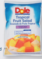
Cheesecake and Fruit Dessert Pizza made with DOLE® Tropical Fruit Salad