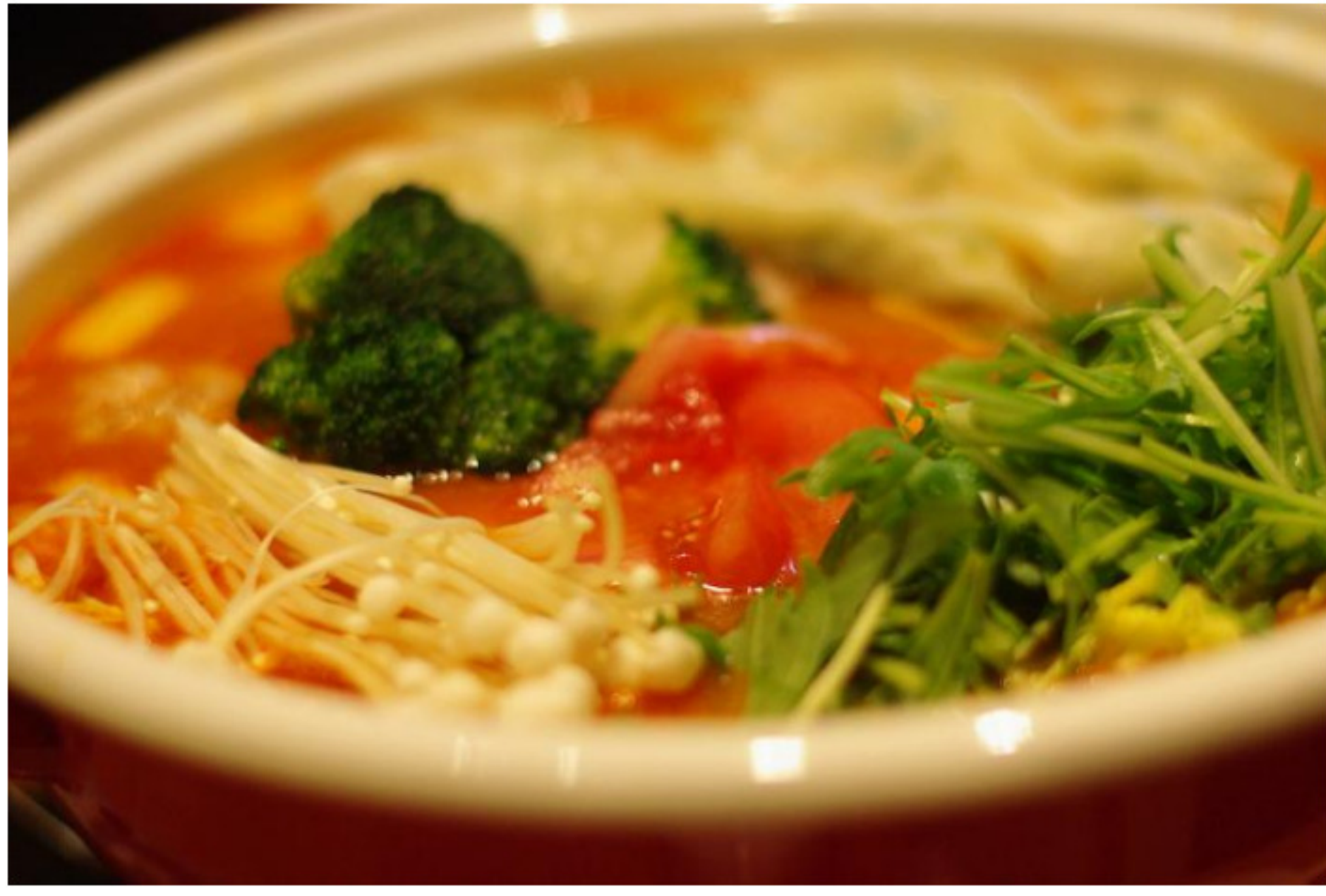
Beer and nabe —a delicious combination, and gourmet staple of Japanese winter.

While the batch varies yearly, it is a typically a golden beer with a white head, full bodied and malty, with a bit of dryness. It isn't radically different from their standard Black Label (黒ラベル; kuro raberu ). This is likely because beers in this style are most popular in Japan. What makes Winter's Tale stand apart is that it is specifically crafted with the demands of the Japanese winter in mind—it needs to pair well with winter cuisine, such as hot pot (鍋; nabe ) dishes, winter fruits such as clementines or tangerines or mandarins (beer and fruit make a pleasant combination after a nice meal), and hot, hearty noodle soups, like udon . For the third year in a row, Sapporo is even providing recipes for dishes to eat with Winter's Tale. Part of their goal of making a nice winter beer is achieved by using a different kind of malt than usual: a Vienna malt. Another key to winter is just good ol' fashioned alcohol content. Sapporo Winter's Tale boasts 6% alcohol, a step up from their typical 5-5.5% brews. Nothing says winter like getting a little tipsy 'to stay warm'.