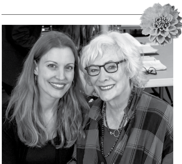
L-R: Rachel York and Betty Buckley.