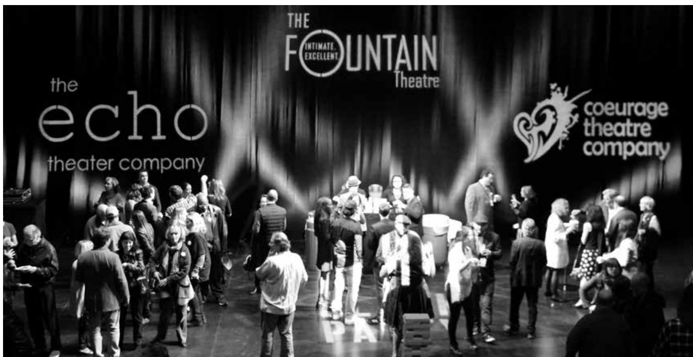
The free, open-to-the-public Block Party Kick-off Event on January 30, 2017 at the Kirk Douglas Theatre.

Sets, props, and additional costumes provided by the Center Theatre Group Shop.