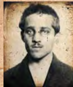
Gavrilo Princip The Assassin

Princip was born in a small town in present-day northwest Bosnia. In 1912, at age 19, he traveled to Belgrade after being expelled from his last year of high school and volunteered to join Serbian rebels fighting against Turkey. The rebels, however, would not take him because of his poor health.