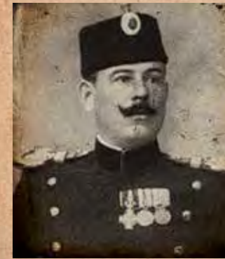
Dragutin “Apis” Dimitrijevic The Mastermind

The people we meet and the events we witness in Archduke are real, based on historical facts.