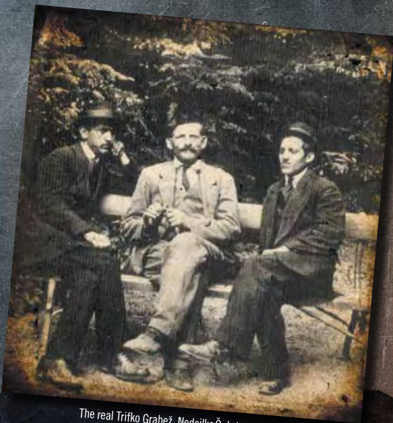
The real Trifko Grabež, Nedeljko Čabrinović and Gavrilo Princip.

Theatre is LIVE, right there in front of you, in real time. The performers respond to the way you listen, laugh, gasp and applaud. Live theatre can't happen without you!