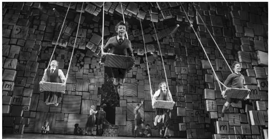
Original Broadway Cast.