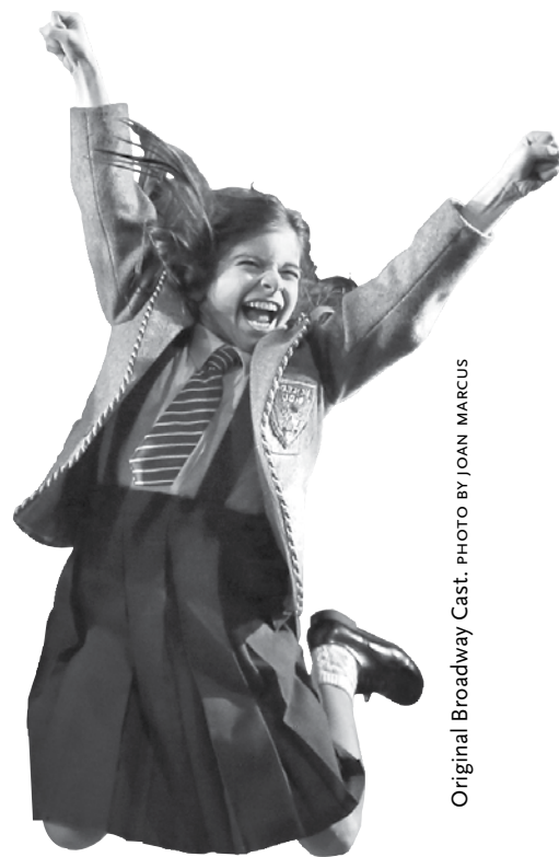
Original Broadway Cast.