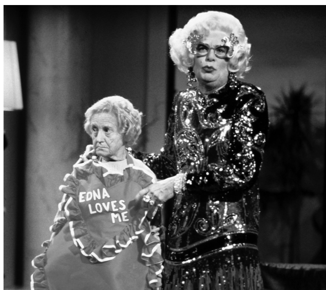
Mrs. Madge Allsop with Dame Edna Everage.

She had a part on the lawyer comedy Ally McBeal (“I brought that show to a close. My presence was impossible for Calista Flockhart, I was just too hard an act to follow”), and lived for a while in a little Beverly Hills house with a lemon grove and a swimming pool. But she said she knows there’s more to L.A. than Rodeo Drive. She admires the Oscar Wilde collection at UCLA’s Clark Library, and the “little organic tidbits” at the grocery store Erewhon.