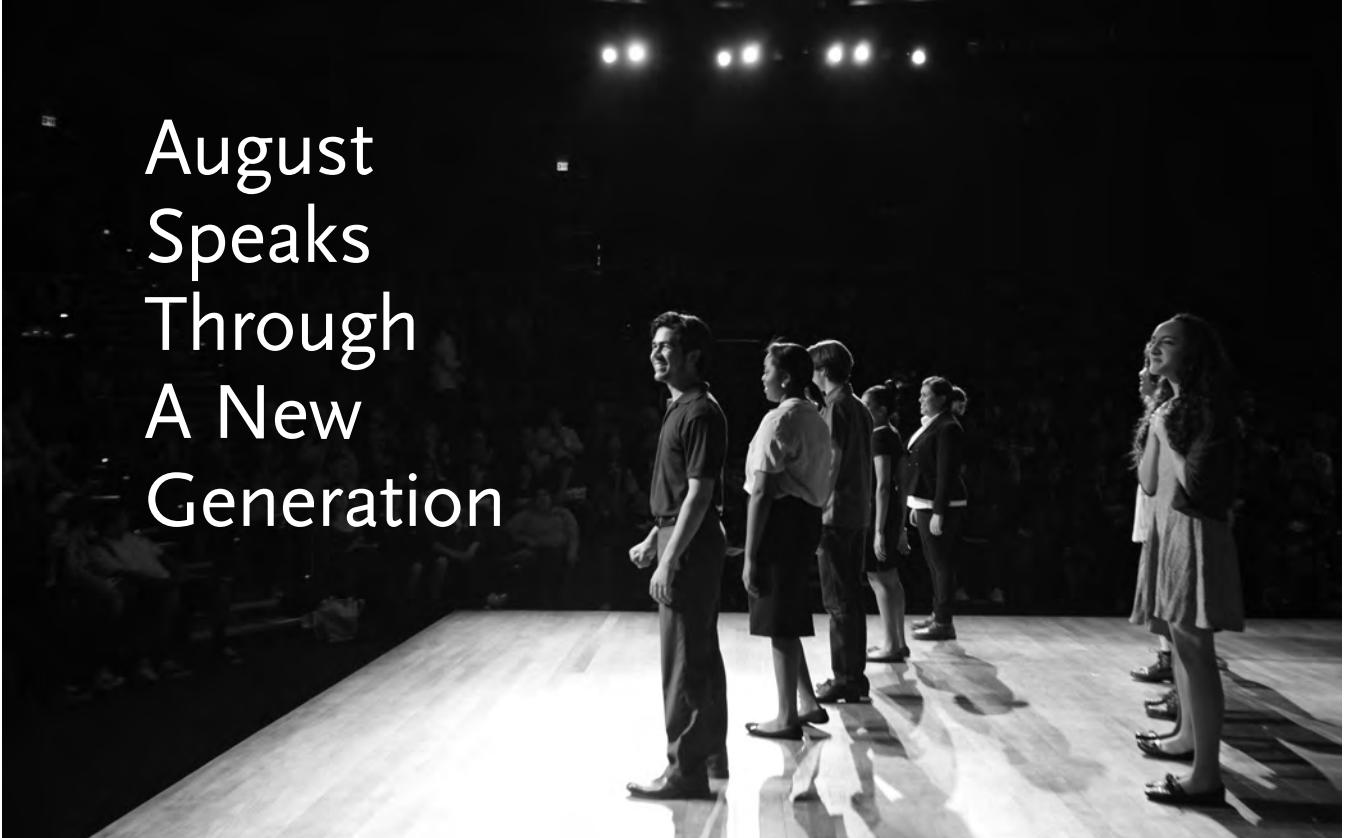
Southern California regional finalists in the 2013 August Wilson Monologue Competition at the Taper, hosted by CTG.