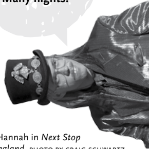
Daryl Hannah in Next Stop Amazingland.

We spent many nights at the Magic Castle. Many nights.