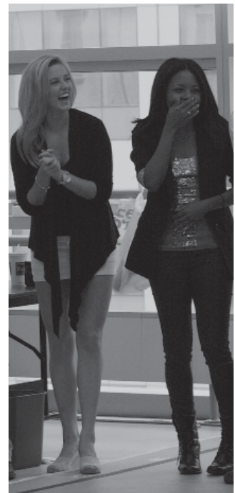
(L TO R) Taylor Louderman and Adrienne Warren.