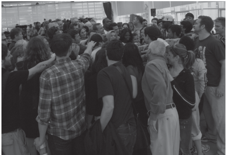
The company of Bring It On: The Musical