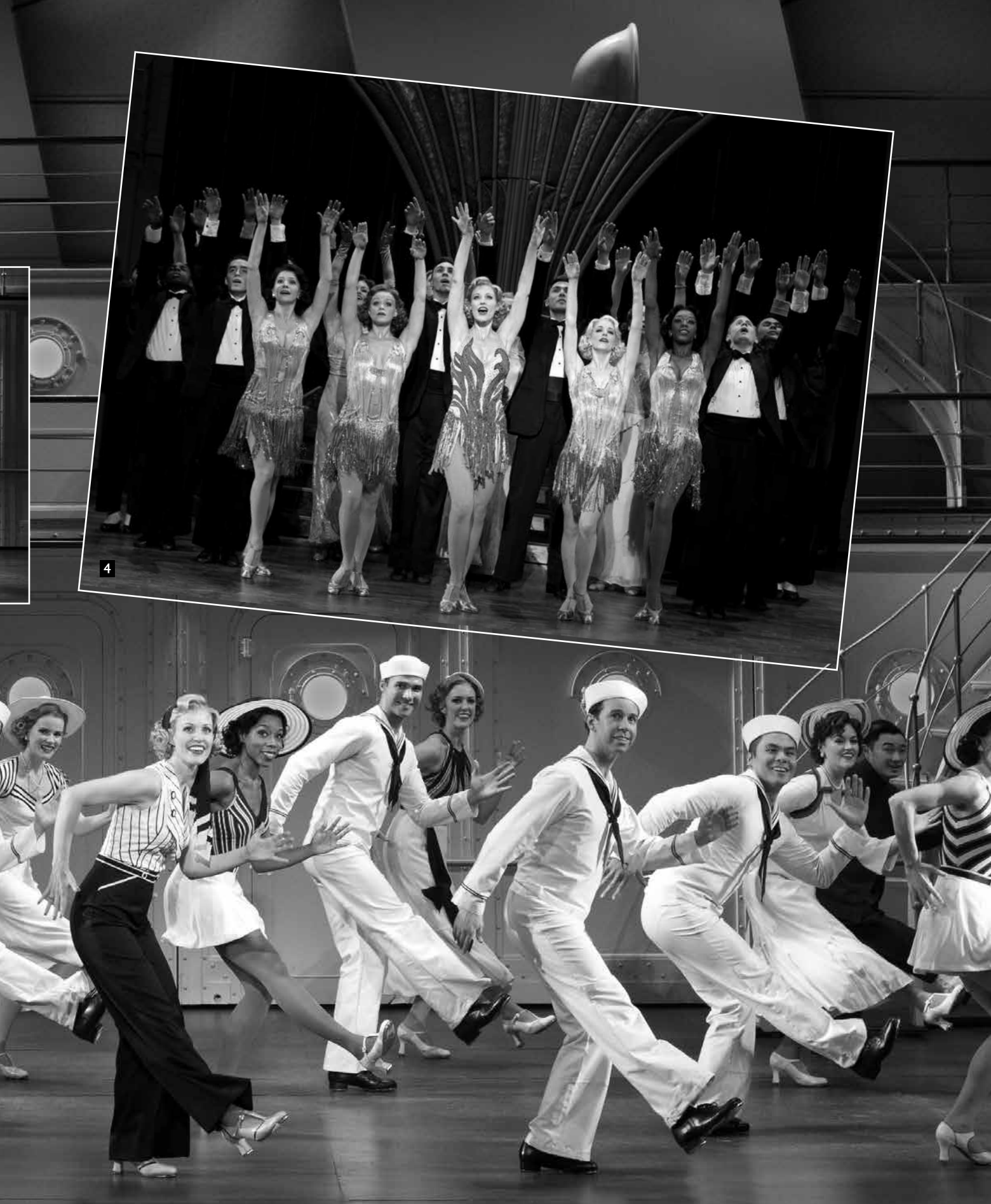
1. The cast of Anything Goes ; 2. Erich Bergen and Rachel York; 3. Fred Applegate and Rachel York; 4. Rachel York and Company in Roundabout Theatre Company's Anything Goes.