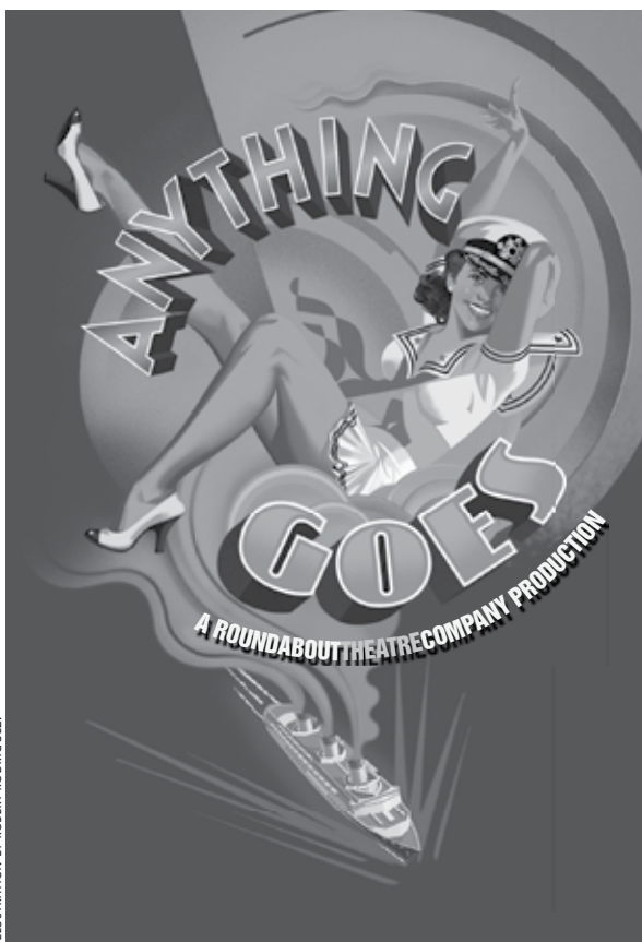
ILLUSTRATION BY ROBERT RODRIGUEZ.